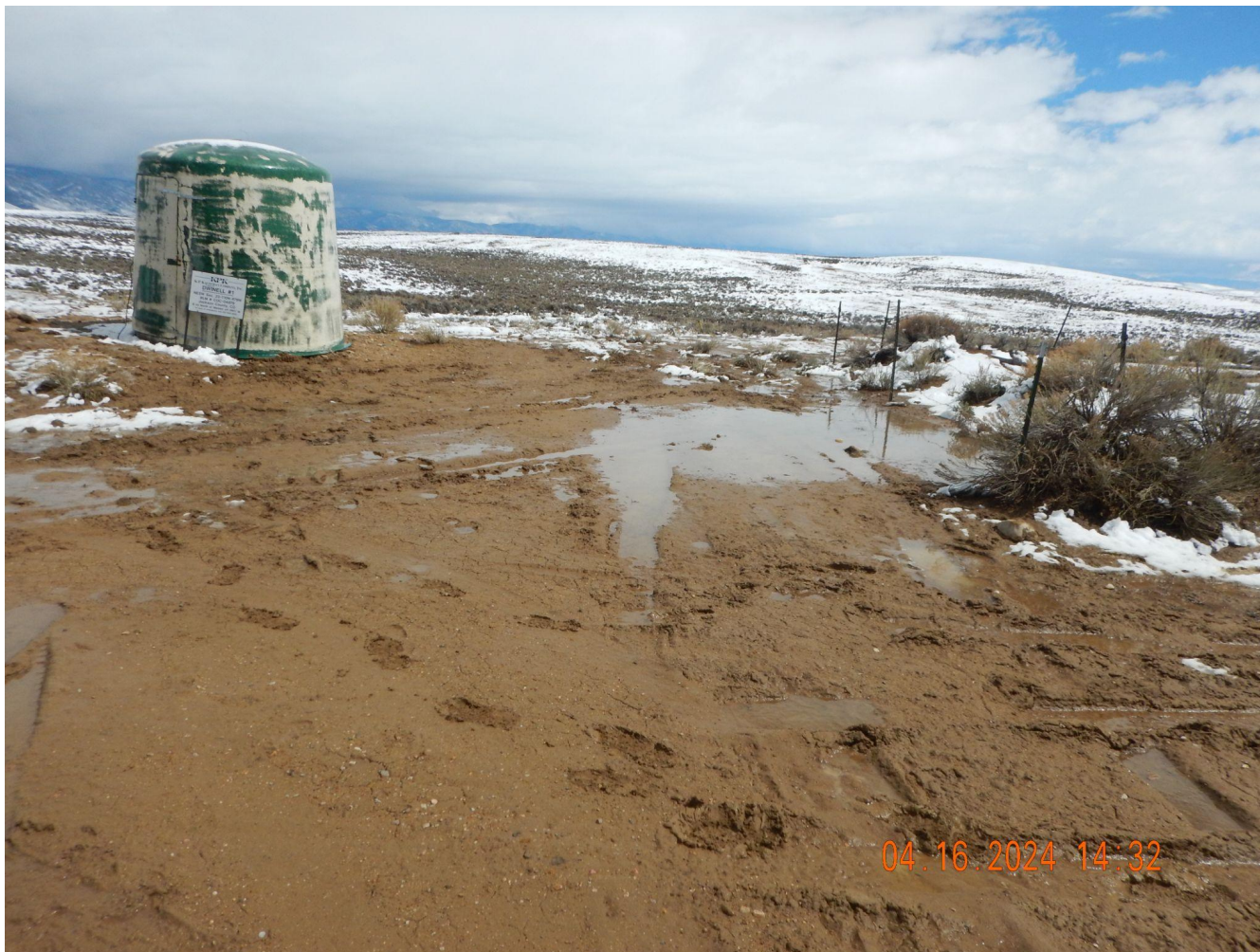
Photo 5. Photo taken from the southeastern location, facing East. See comments under Photo 3.

Note- photo also illustrates sediment laden stormwater is discharging off location.