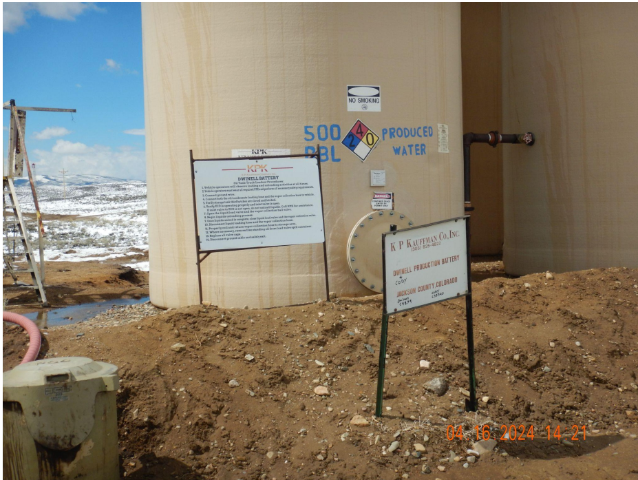
Photo 1. Photo taken of the Operator sign at the tank battery.