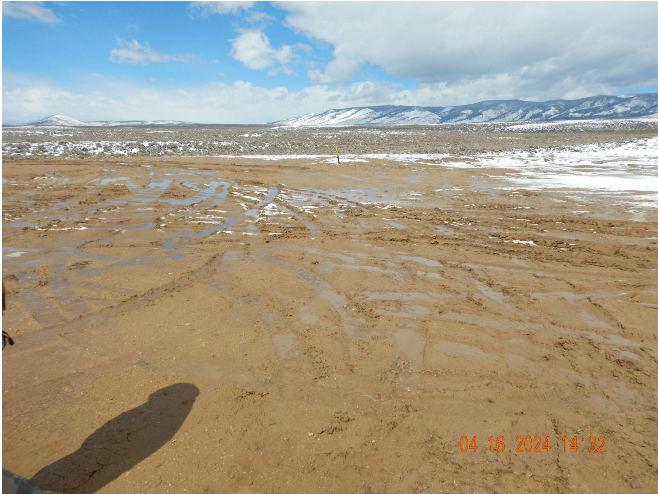
Photo 3. Photo taken from the southeastern location, facing North. Photo illustrates the location has not been adequately stabilized to minimize erosion, alteration of natural features, removal of surface materials and degradation due to contamination per Rule 1002.e.(1).