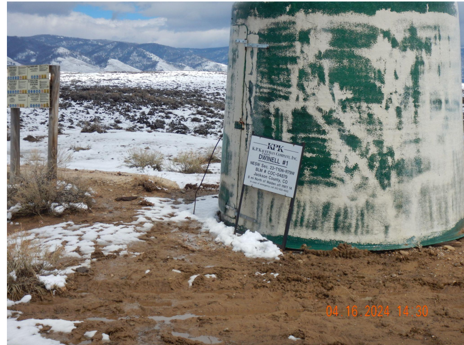
Photo 2. Photo taken of the Operator sign at the wellhead.