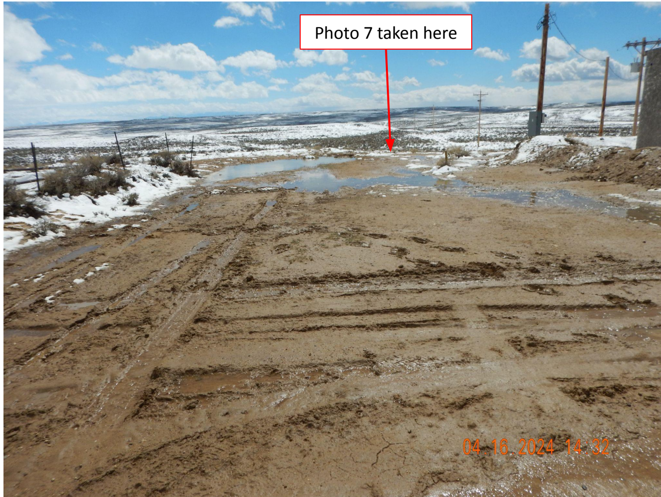
Photo 6. Photo taken from the southeastern location, facing South. See comments under Photo 3.

Note- photo also illustrates sediment laden stormwater is discharging off location.