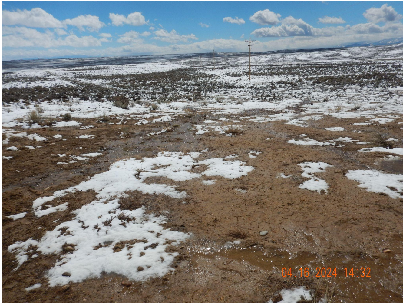
Photo 7. Photo taken from the southeastern location, facing South. Photo illustrates sediment laden stormwater discharging off location in violation of Rule 1002.f.