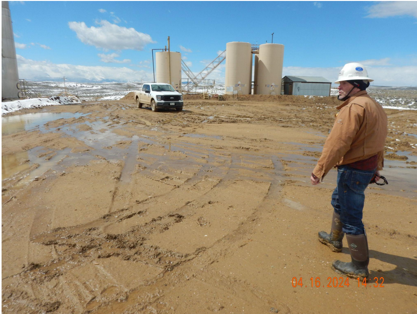
Photo 4. Photo taken from the southeastern location, facing West. See comments under Photo 3.