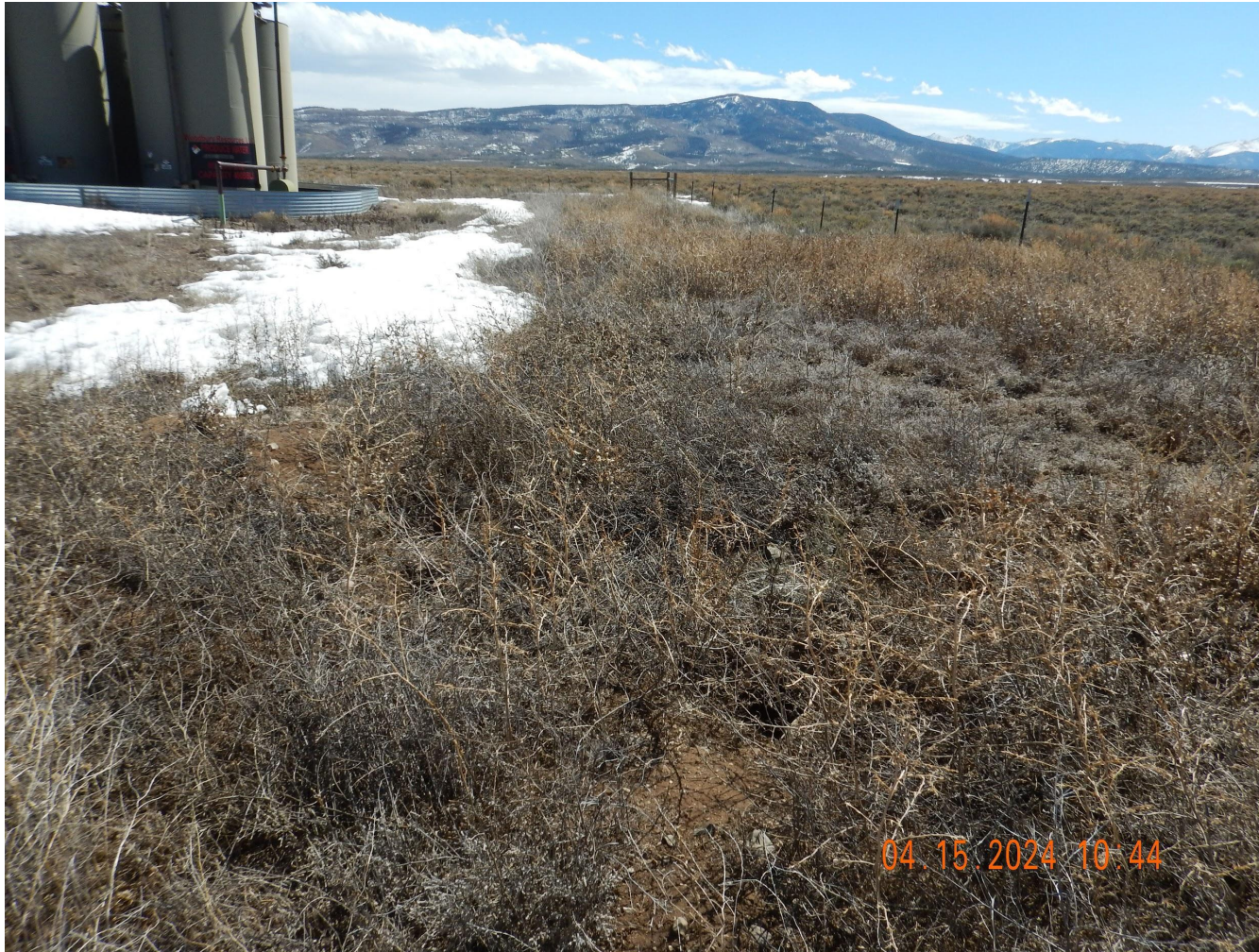
Photo 6. Photo taken from the southern interim reclamation area, facing East. Photo illustrates the area consists mostly of unmanaged annual, weedy Russian thistle vegetation that is not reflective of reference area conditions. Refer to Photo 7 documenting reference area vegetation.