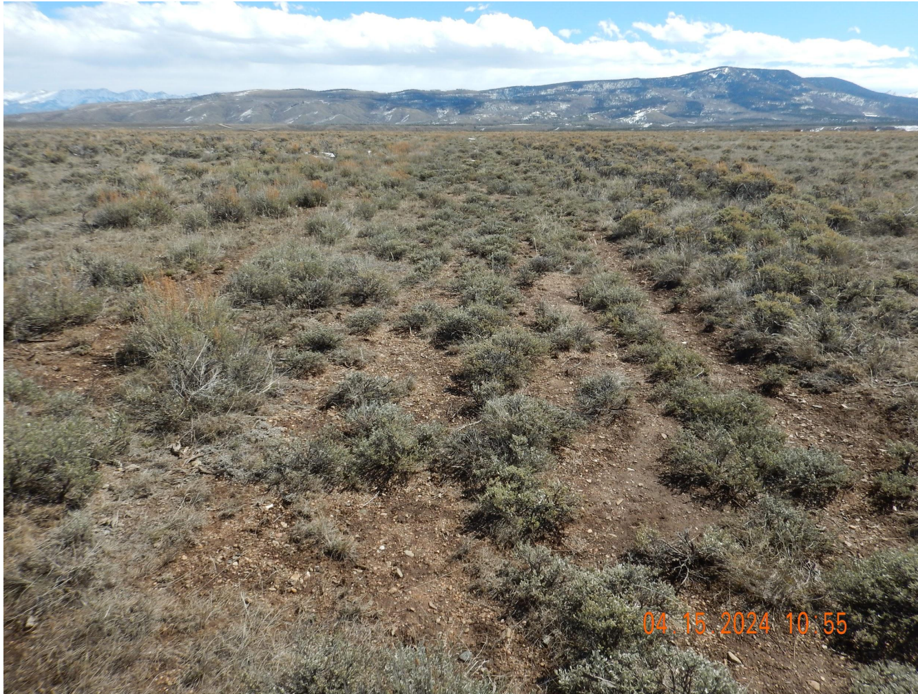
Photo 7. Photo taken from the disturbance feature shown in Photo #1, facing East. Photo illustrates the Operator bulldozed the disturbance feature in response to a 2012 E&P waste release for a proposed controlled burn. The disturbance feature has reclaimed back to reference area conditions.