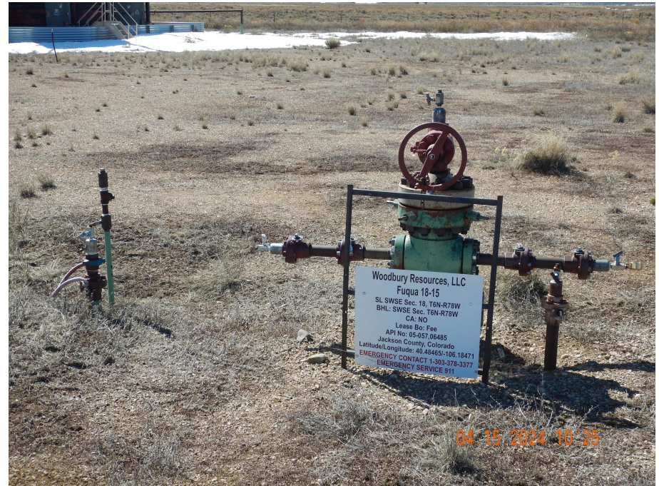
Photo 3. Photo taken from the wellhead. See comments on Photo 2 regarding the Operator sign.