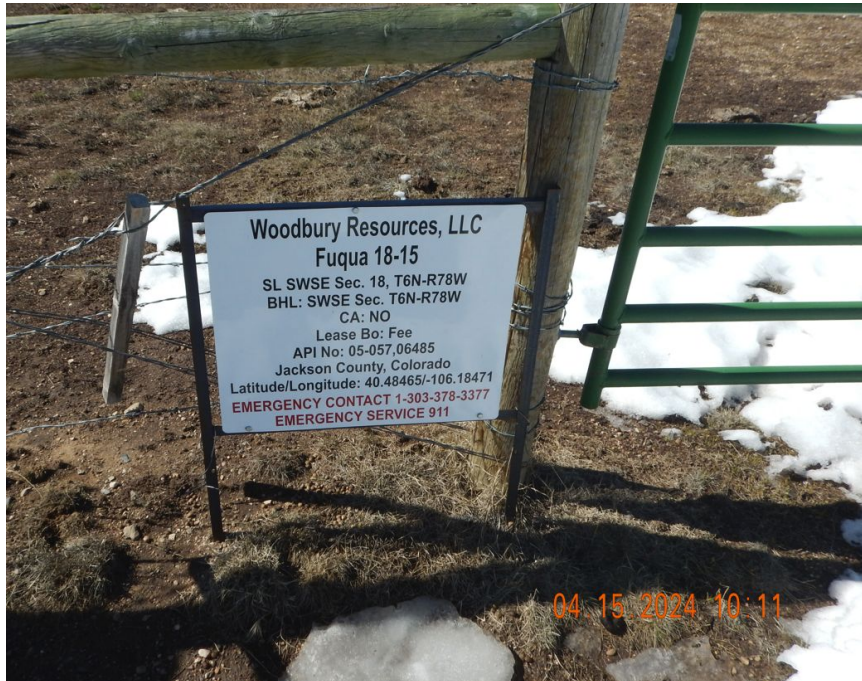
Photo 2. Photo taken from the entrance of location. Photo illustrates the Operator sign, which needs to be corrected due to an inaccurate Well API #.