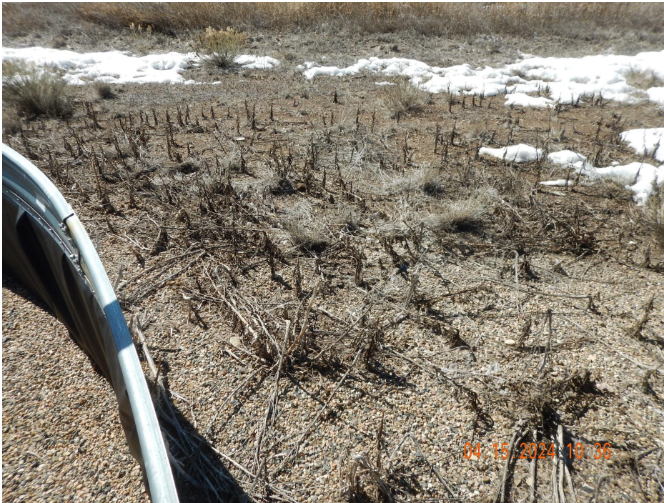
Photo 7. Photo taken from the southeastern interim reclamation area near the southern tank battery. Photo illustrates a List B Colorado noxious weed, Canada thistle. Note- there were other areas along the southern interim area with Canada thistle.