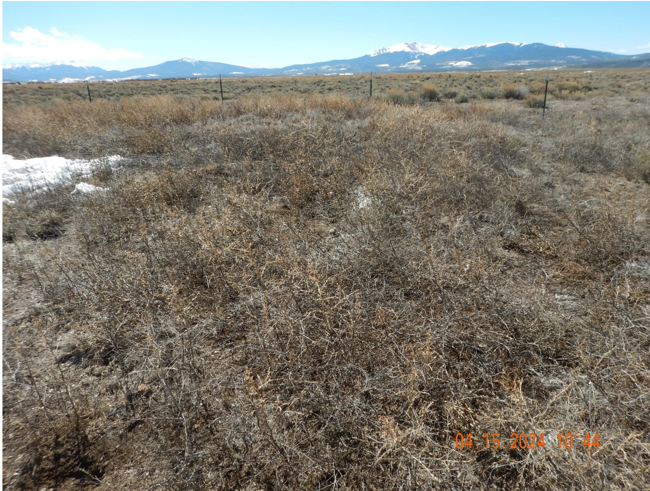
Photo 5. Photo taken from the southeastern interim reclamation area, facing South. Photo illustrates the area consists mostly of unmanaged annual, weedy Russian thistle vegetation that is not reflective of reference area conditions. Refer to Photo 7 documenting reference area vegetation.