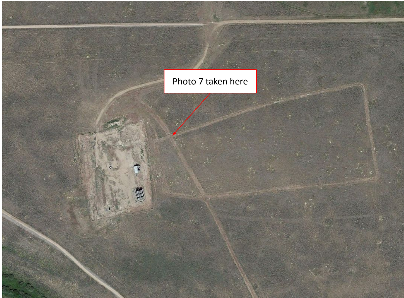
Photo 1. Google Earth aerial imagery from 8/27/2019 illustrating the location and a portion of the access road. The disturbances east of the location were from the Operator and have been reclaimed- refer to Photo 7. There is a disturbance to the southwest of the location that will need further investigation by ECMC.