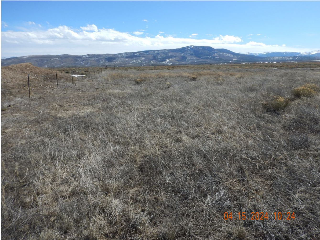
Photo 4. Photo taken from the northern interim reclamation area, facing East. Photo illustrates the area consists mostly of annual vegetation, which is not reflective of reference area conditions. Refer to Photo 7 documenting reference area vegetation.