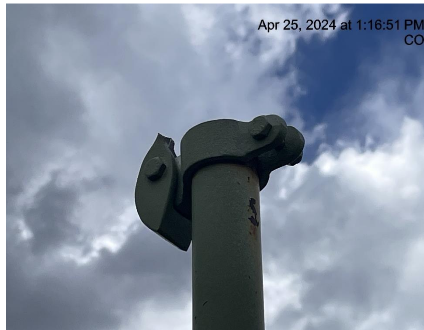
Photo # 5111 PRV vent line cap damaged/PRV vent line does not comply with CECMC pressure safety device rules