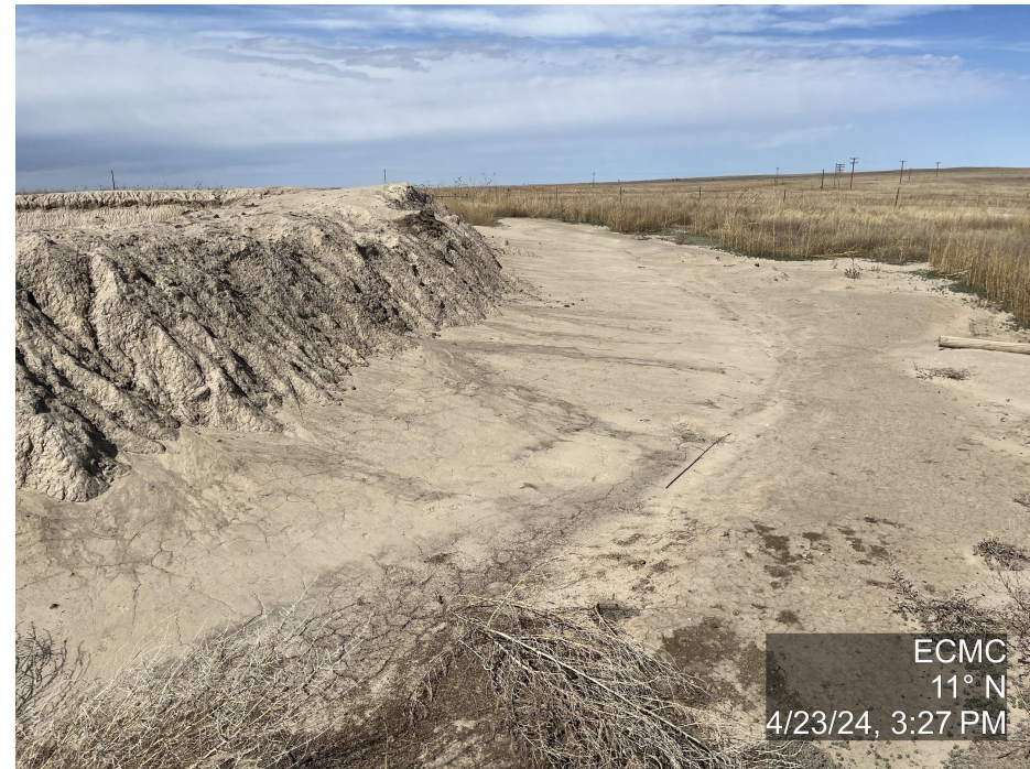
Photo 6. The photo was taken at the well location facing North. The photo illustrates erosion of the pit wall that should be repaired.