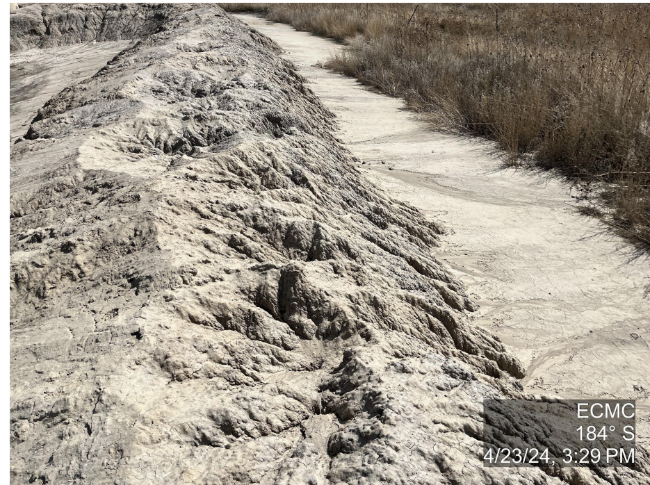
Photo 8. The photo was taken at the well location facing South. Refer to the comment for photo 6.