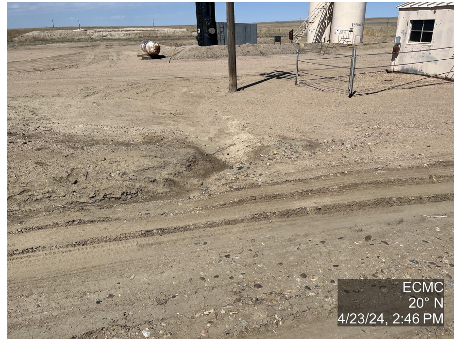
Photo 2. The photo was taken at the well location facing North. The photo illustrates the erosion on the production facility pad.