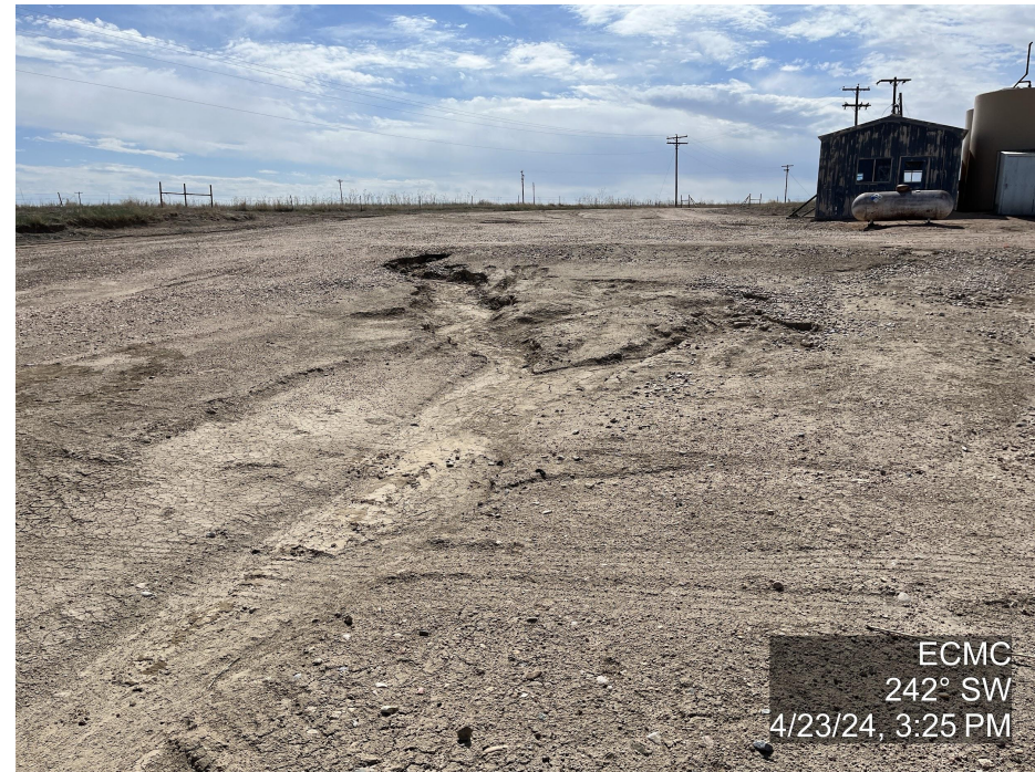
Photo 4. The photo was taken at the well location facing North. Refer to the comment for photo 2.