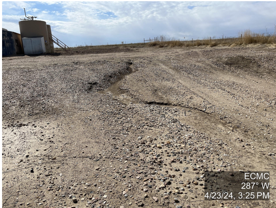
Photo 5. The photo was taken at the well location facing North. Refer to the comment for photo 2.