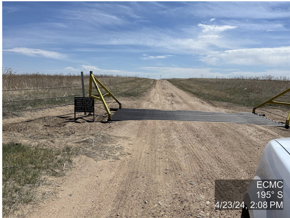
Photo 1. The photo was taken at the entrance to the well location facing South. The photo illustrates the operator sign at the entrance to the active locations.