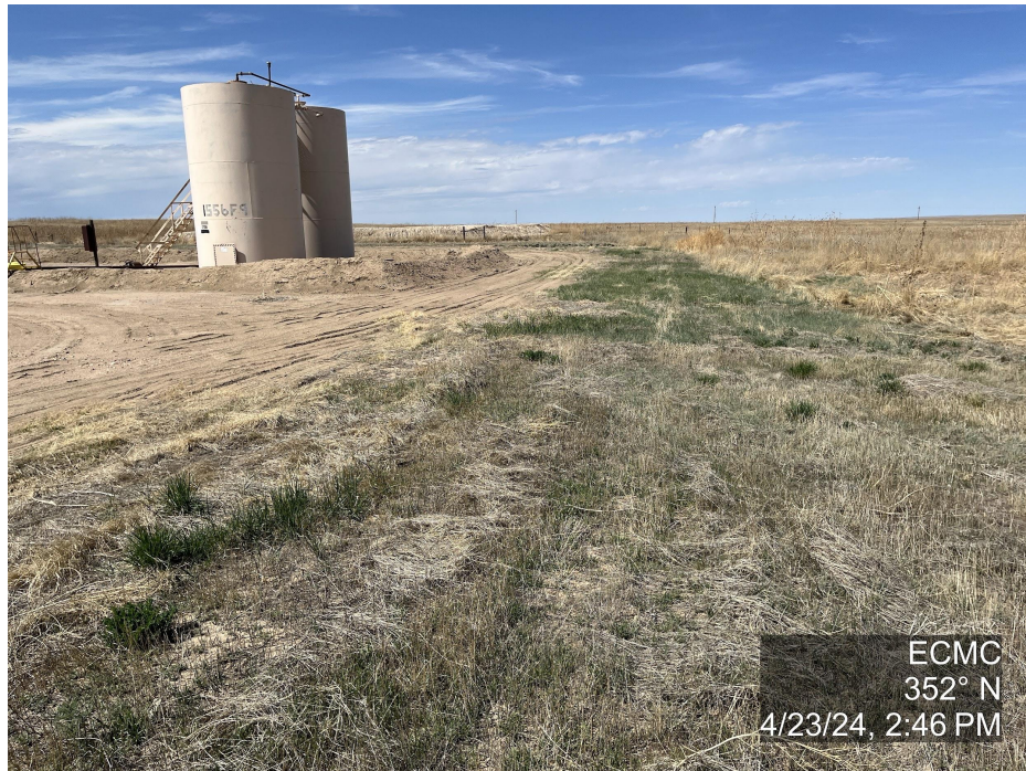
Photo 3. The photo was taken at the well location facing North. The photo illustrates the tank battery and the mowed interim.