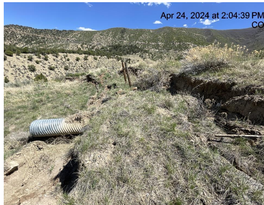
Photo # 4894 Culvert damaged/BMP needs maintenance & slope destabilized & sloughing