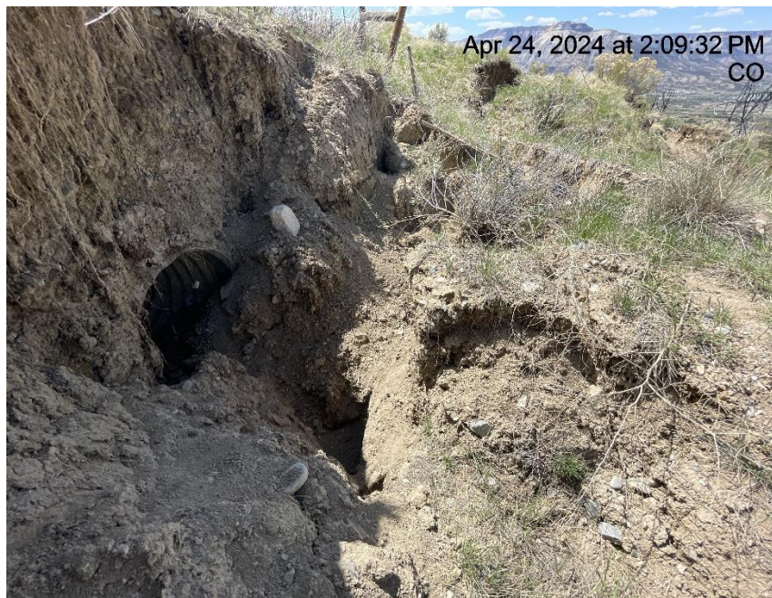
Photo # 4893 Culvert damaged/BMP needs maintenance & slope destabilized & sloughing