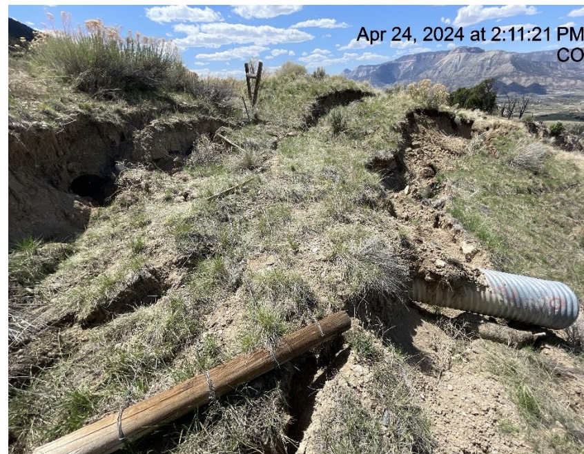
Photo # 4898 Culvert damaged/BMP needs maintenance & slope destabilized & sloughing