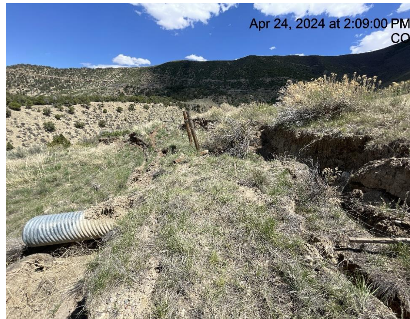
Photo # 4890 Culvert damaged/BMP needs maintenance & slope destabilized & sloughing