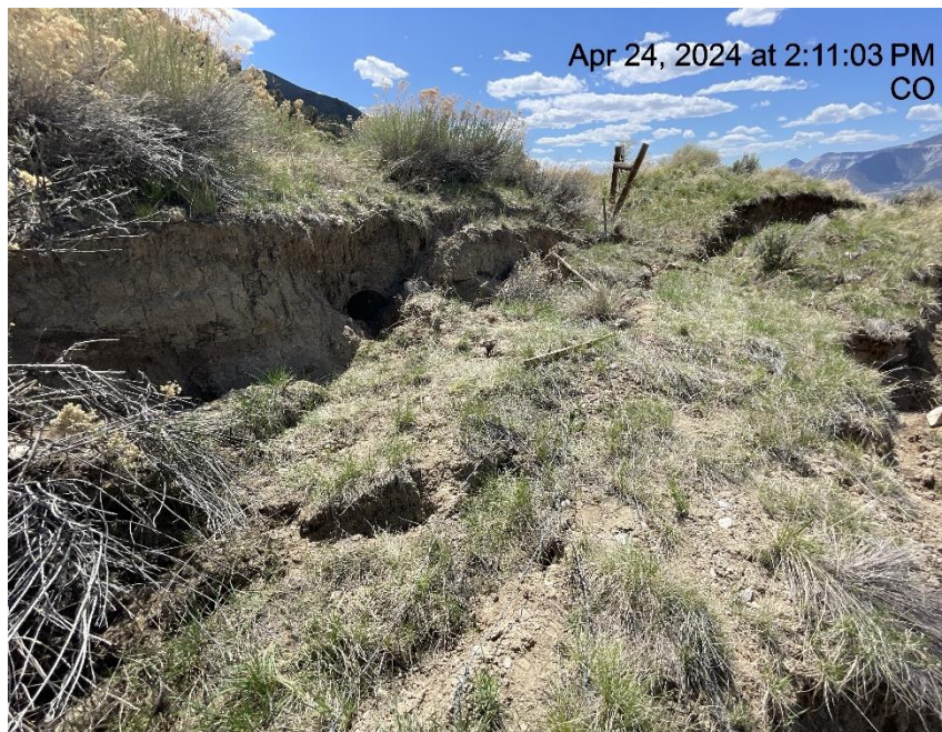
Photo # 4897 Culvert damaged/BMP needs maintenance & slope destabilized & sloughing