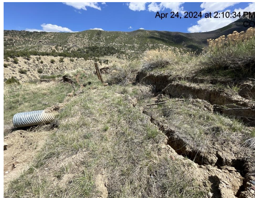
Photo # 4892 Culvert damaged/BMP needs maintenance & slope destabilized & sloughing