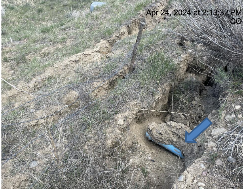
Photo # 4899 Exposed pipe in one of the areas where slope is destabilized & sloughing