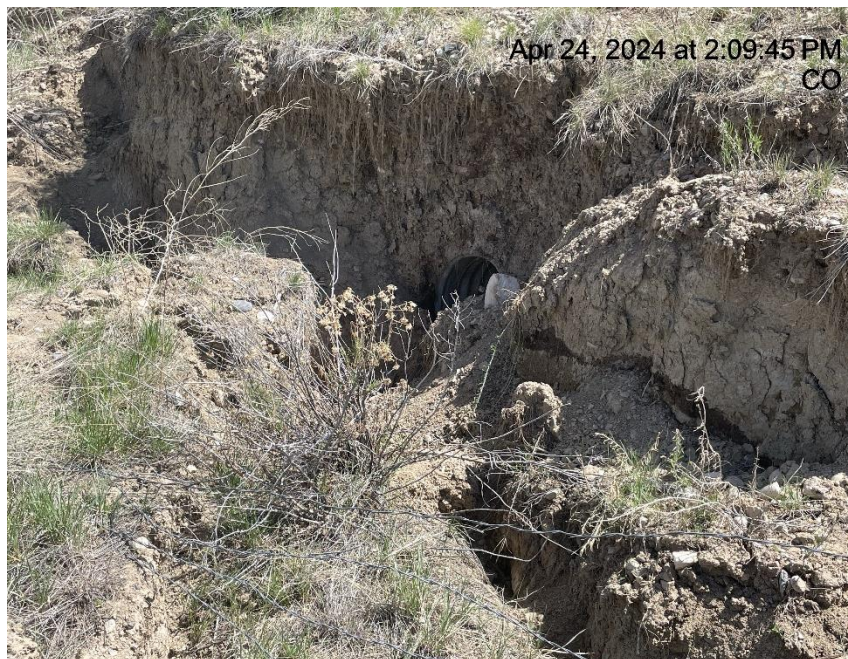
Photo # 4891 Culvert damaged/BMP needs maintenance & slope destabilized & sloughing