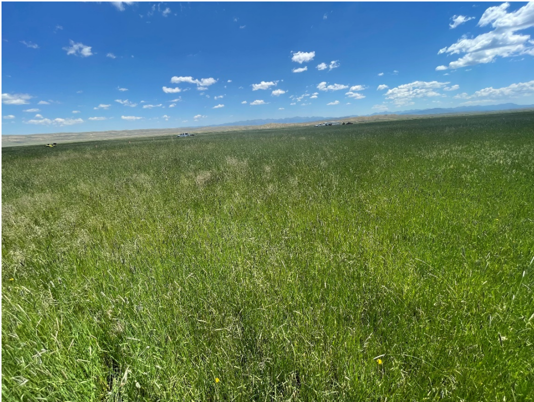
JANET 0780 S5 PAD NE1/4NE1/4 SEC 5, T7N, R80W LOOKING EAST July 11, 2022