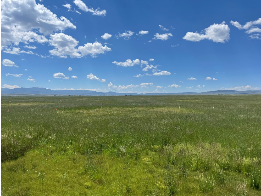
JANET 0780 S5 PAD NE1/4NE1/4 SEC 5, T7N, R80W LOOKING SOUTH July 11, 2022