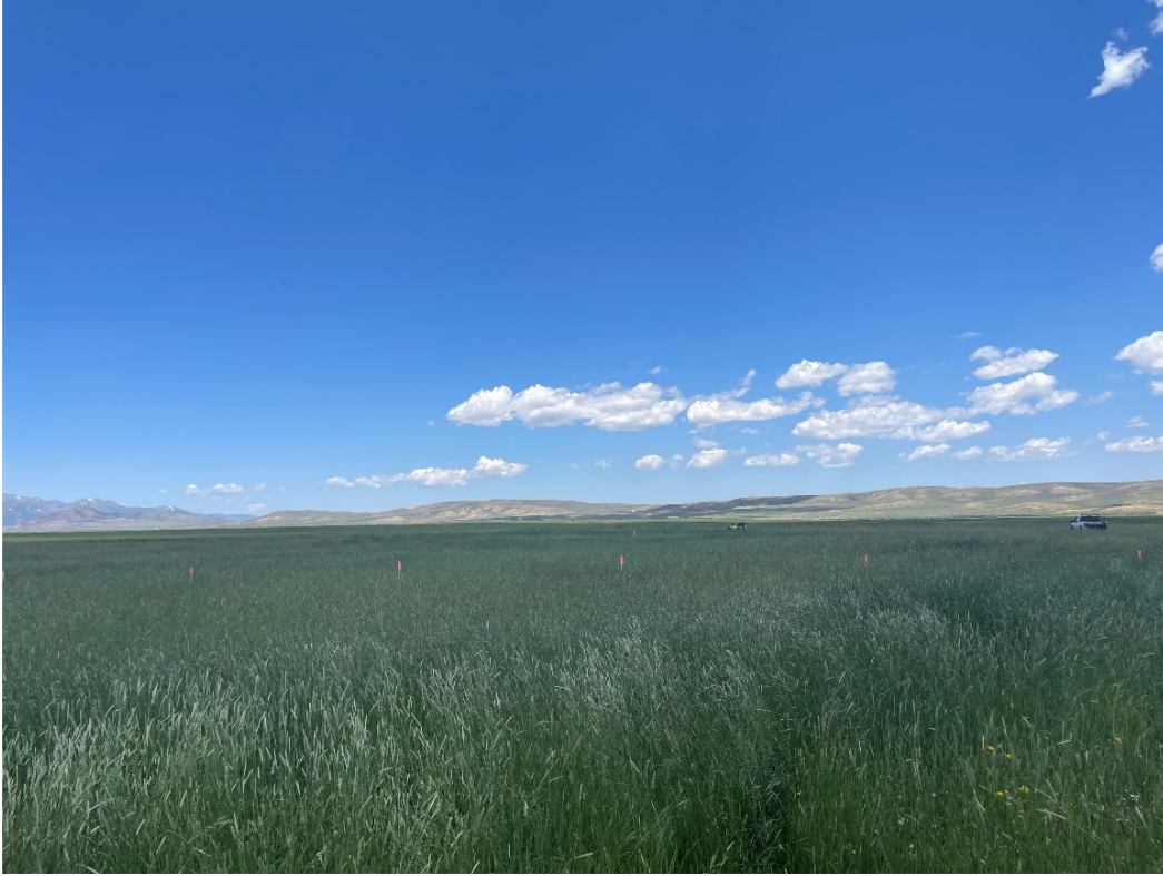
JANET 0780 S5 PAD NE1/4NE1/4 SEC 5, T7N, R80W LOOKING NORTH July 11, 2022