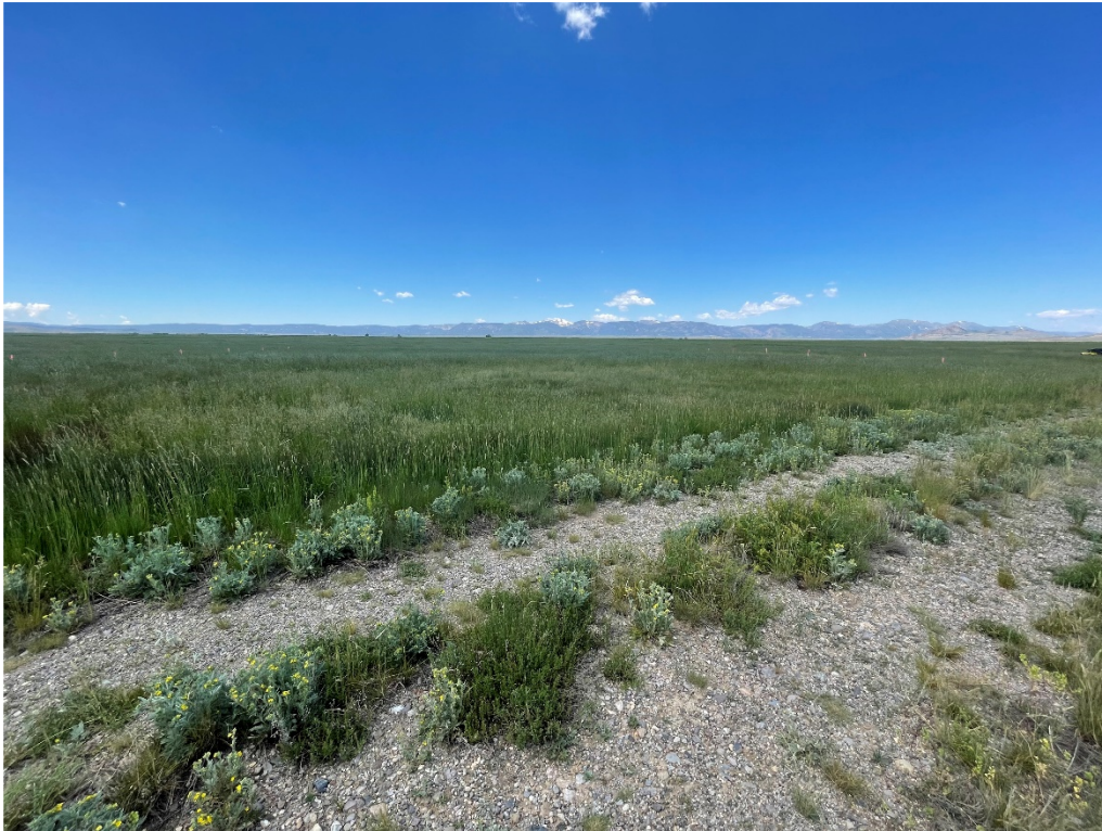
JANET 0780 S5 PAD NE1/4NE1/4 SEC 5, T7N, R80W LOOKING WEST July 11, 2022