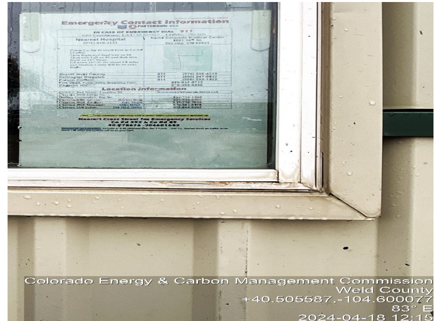
Photo #10 Braskaland A06-765 Wellsite Drilling | DG Safety Emergency Contacts