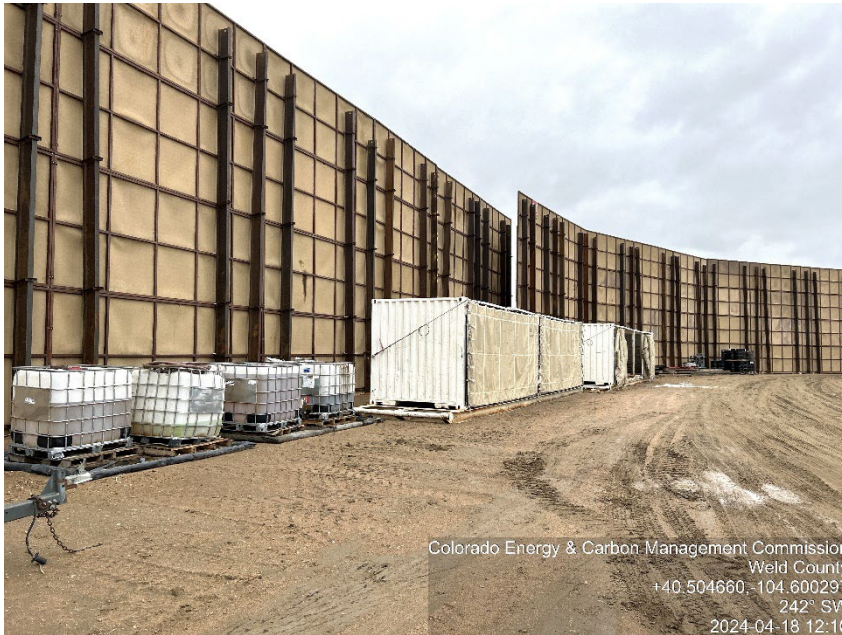
Colorado Energy & Carbon Management Commission Weld County +40.504660, -104.600297 242° SW 2024-04-18 12:10

Photo #5 Braskaland A06-765 Wellsite Drilling | DG Storage Area: Supplies Dry, Fluids