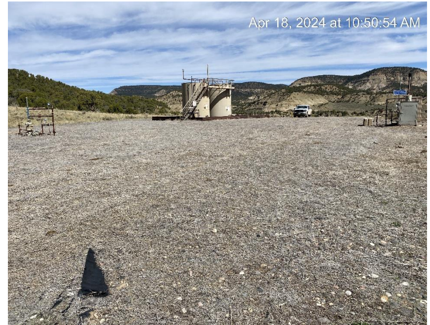
Location from Southeast corner