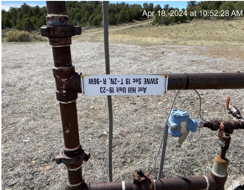
Well sign missing required information