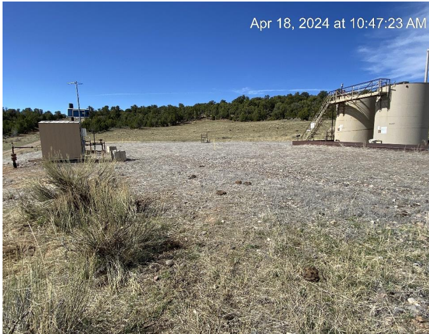
Location from Northeast corner