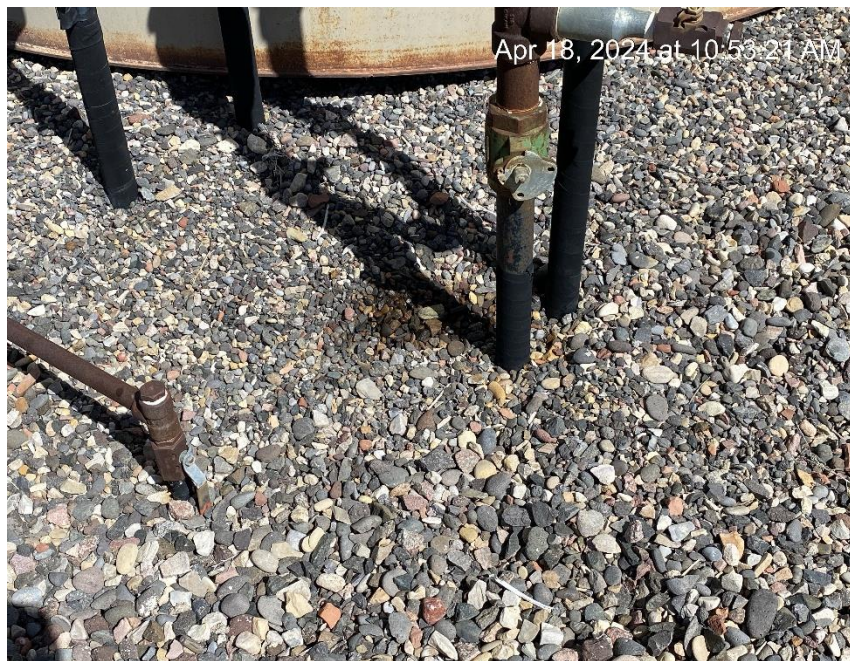
Staining from equipment leak