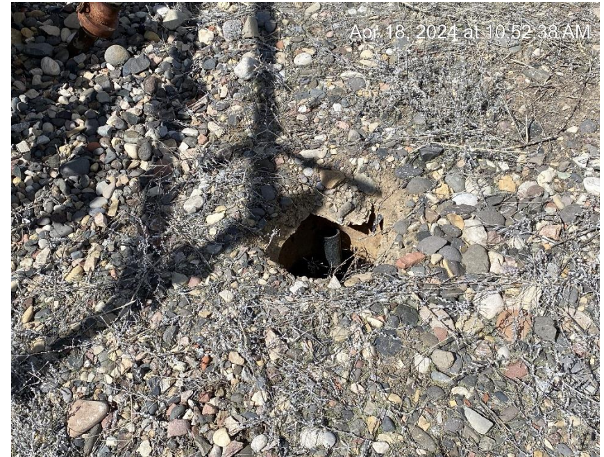
Open mouse hole