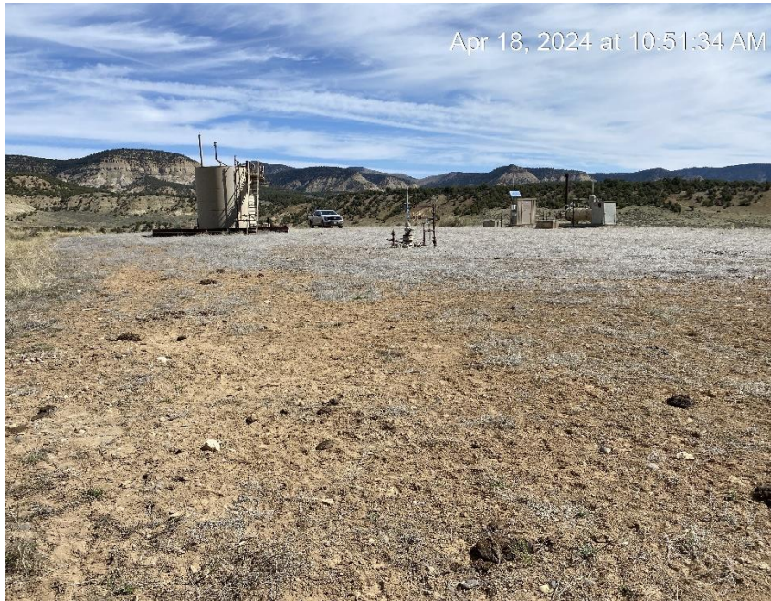
Location from Southwest corner