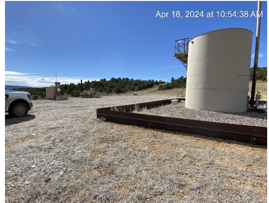
Location from Northwest corner