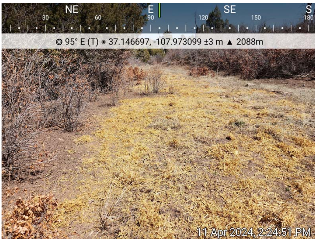
Photo 12: Argenta 34-10 #31-1 access road after seeding and mulching.