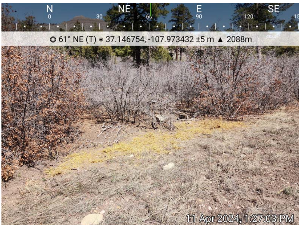
Photo 14: Argenta 34-10 #31-1 access road after seeding and mulching.