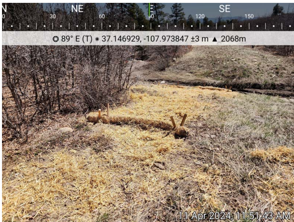
Photo 6: Argenta 34-10 #31-1 rilling removed and area has been seeded and mulched.