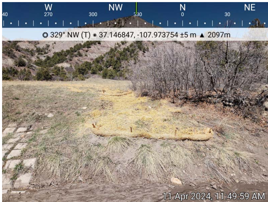
Photo 5: Argenta 34-10 #31-1 rilling removed and area has been seeded and mulched.