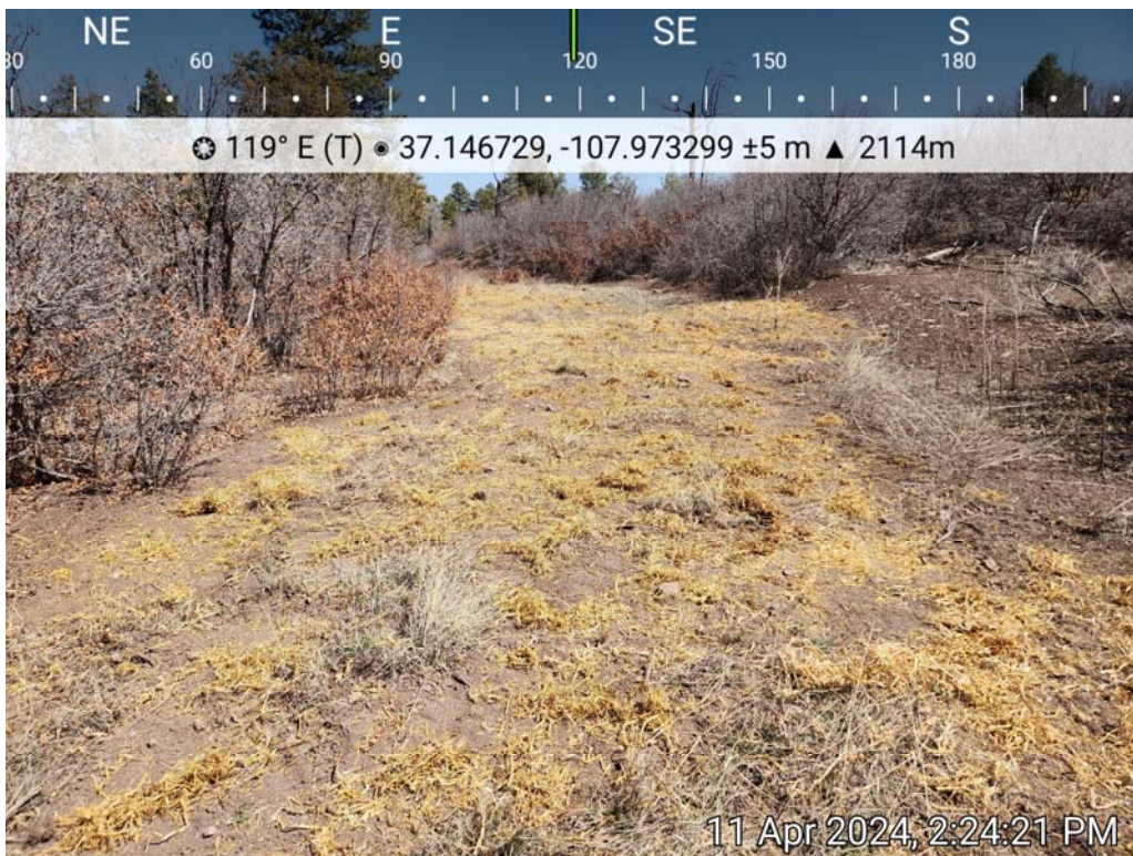
Photo 8: Argenta 34-10 #31-1 access road after seeding and mulching.