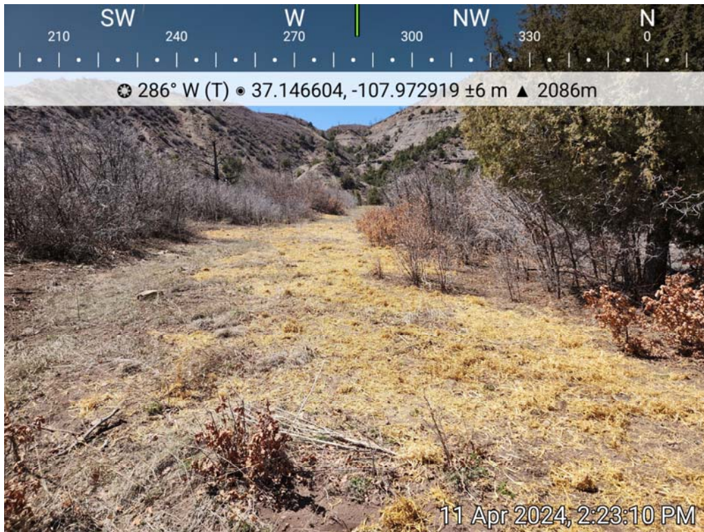
Photo 11: Argenta 34-10 #31-1 access road after seeding and mulching.