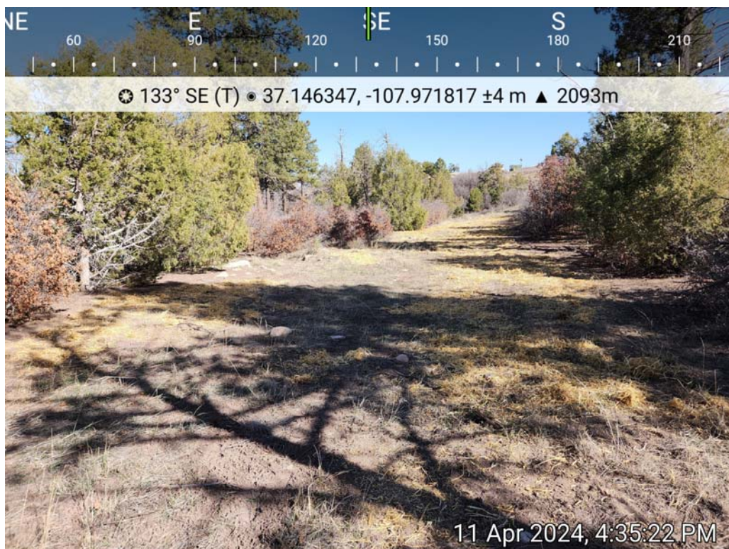
Photo 10: Argenta 34-10 #31-1 access road after seeding and mulching.