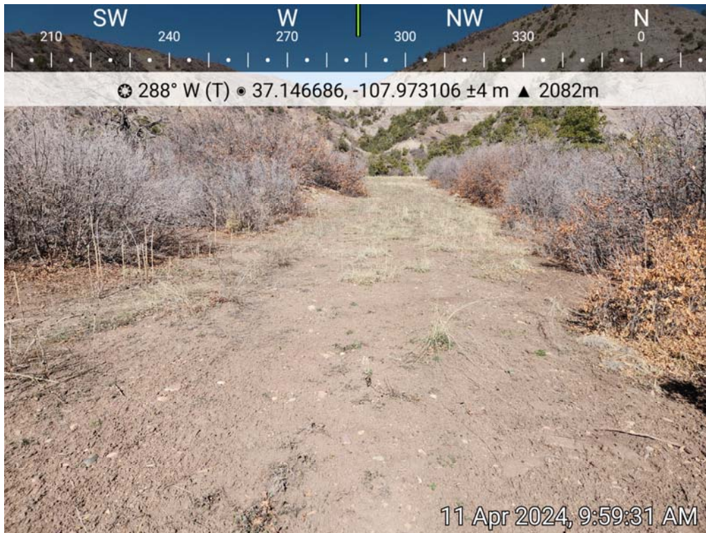
Photo 7: Argenta 34-10 #31-1 access road before seeding and mulching.