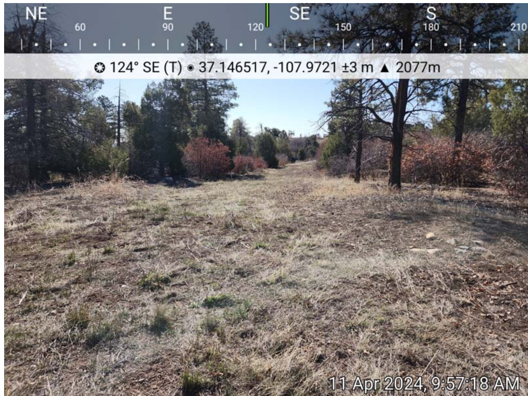
Photo 9: Argenta 34-10 #31-1 access road before seeding and mulching.