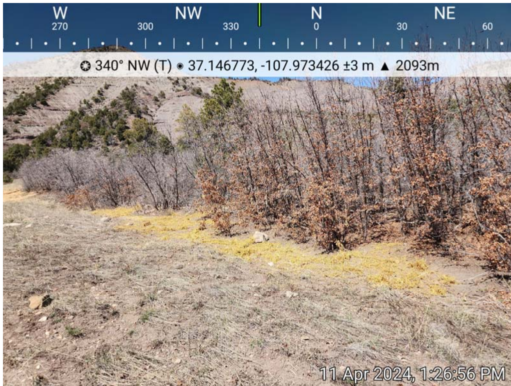
Photo 13: Argenta 34-10 #31-1 access road after seeding and mulching.