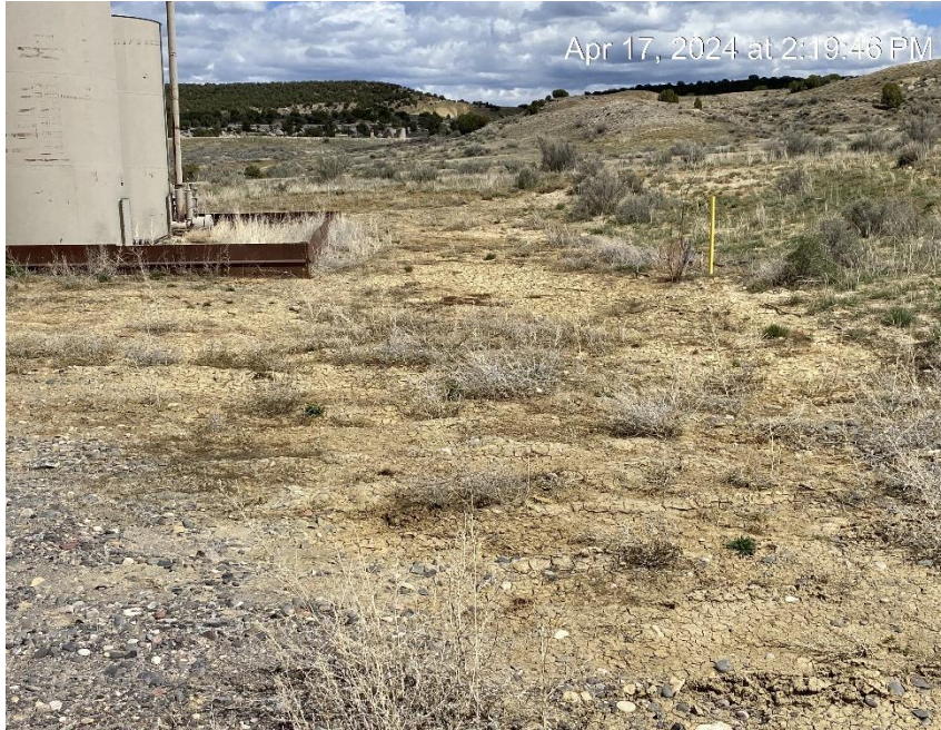
Sediment migration entering location