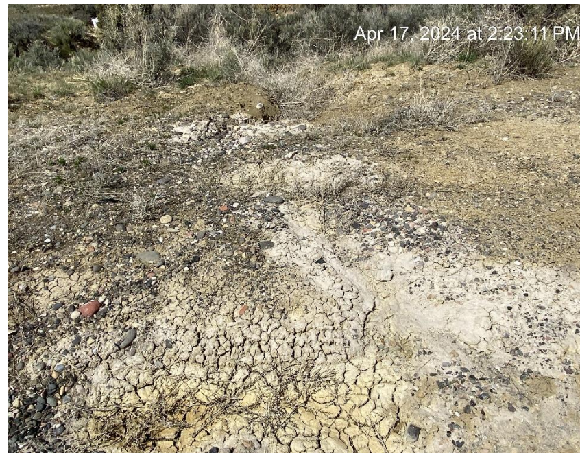
Erosion and sediment migration leaving location