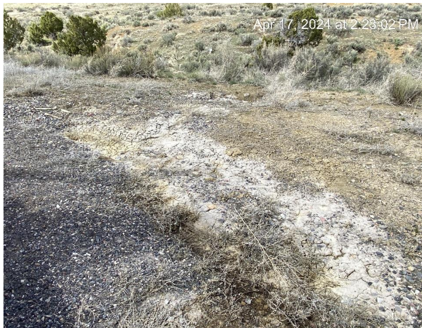
Stained soil in water channel leaving location