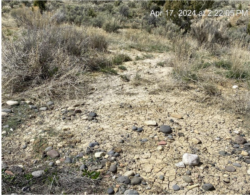
Erosion and sediment migration