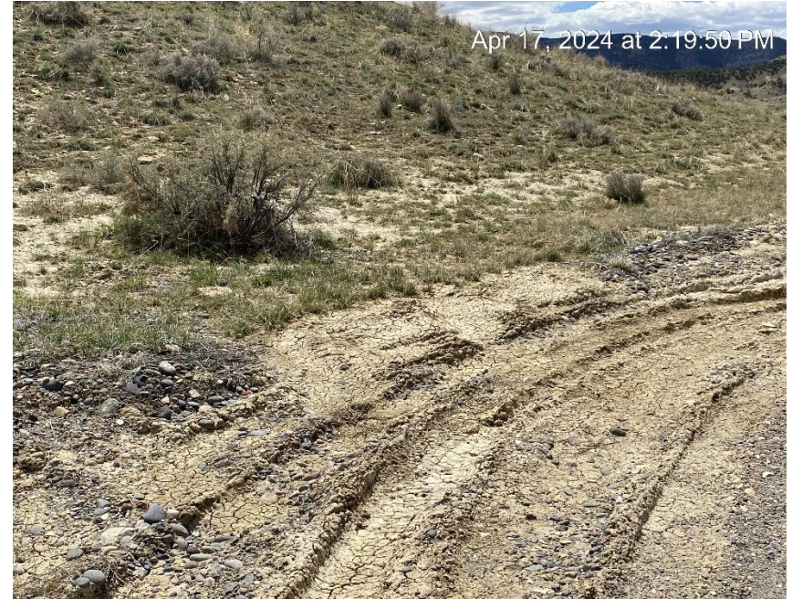
Sediment migration entering location