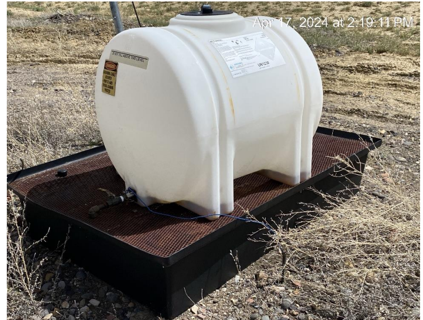
Unused equipment from previous inspection