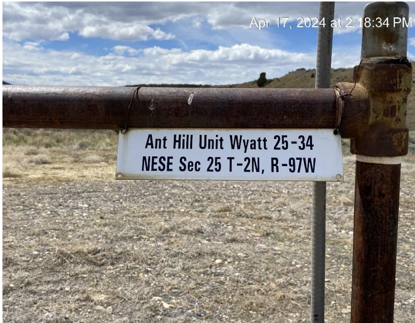
When replaced additional information will be required