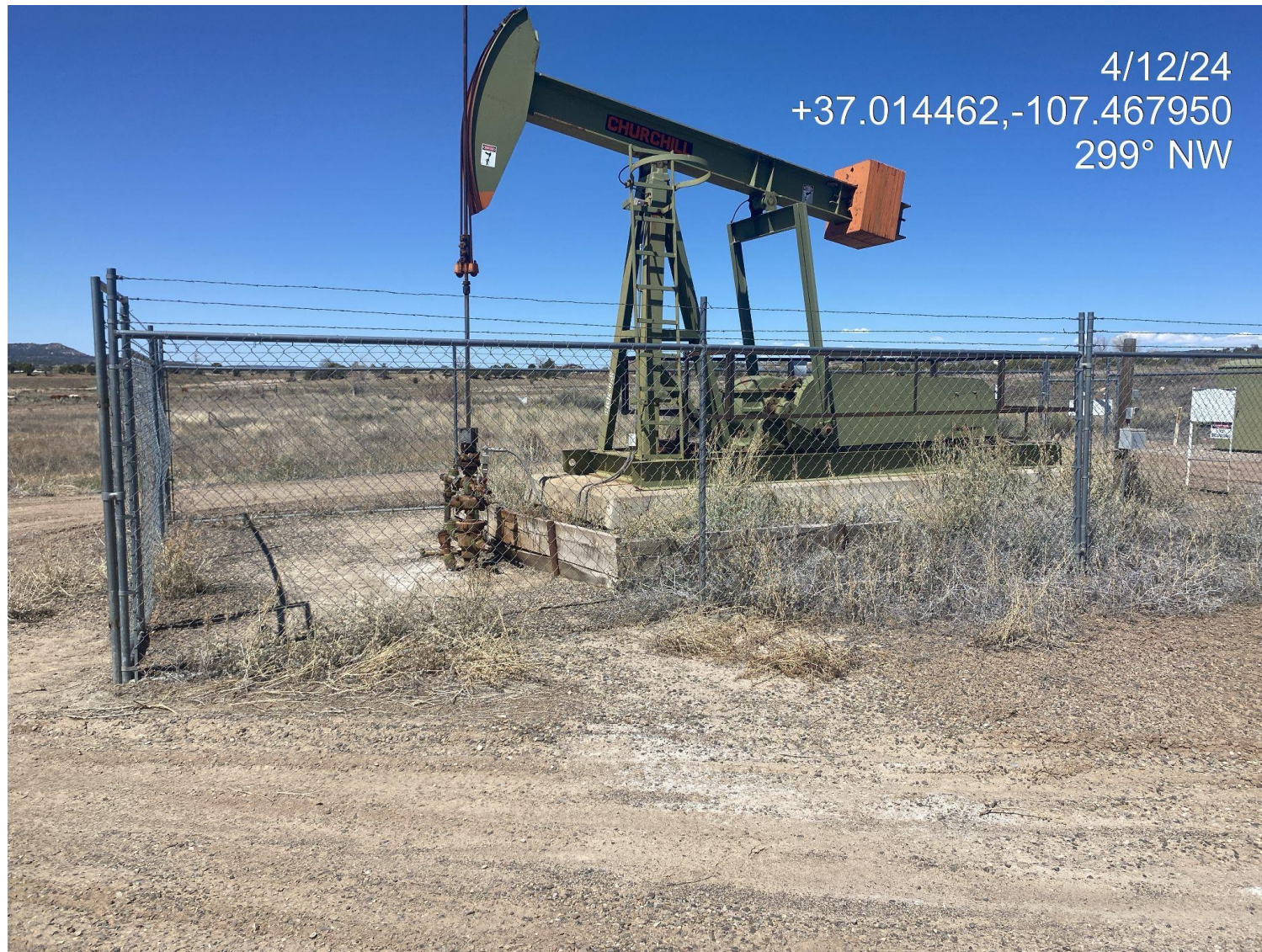
Photo 3. Weedy debris observed around pump jack.