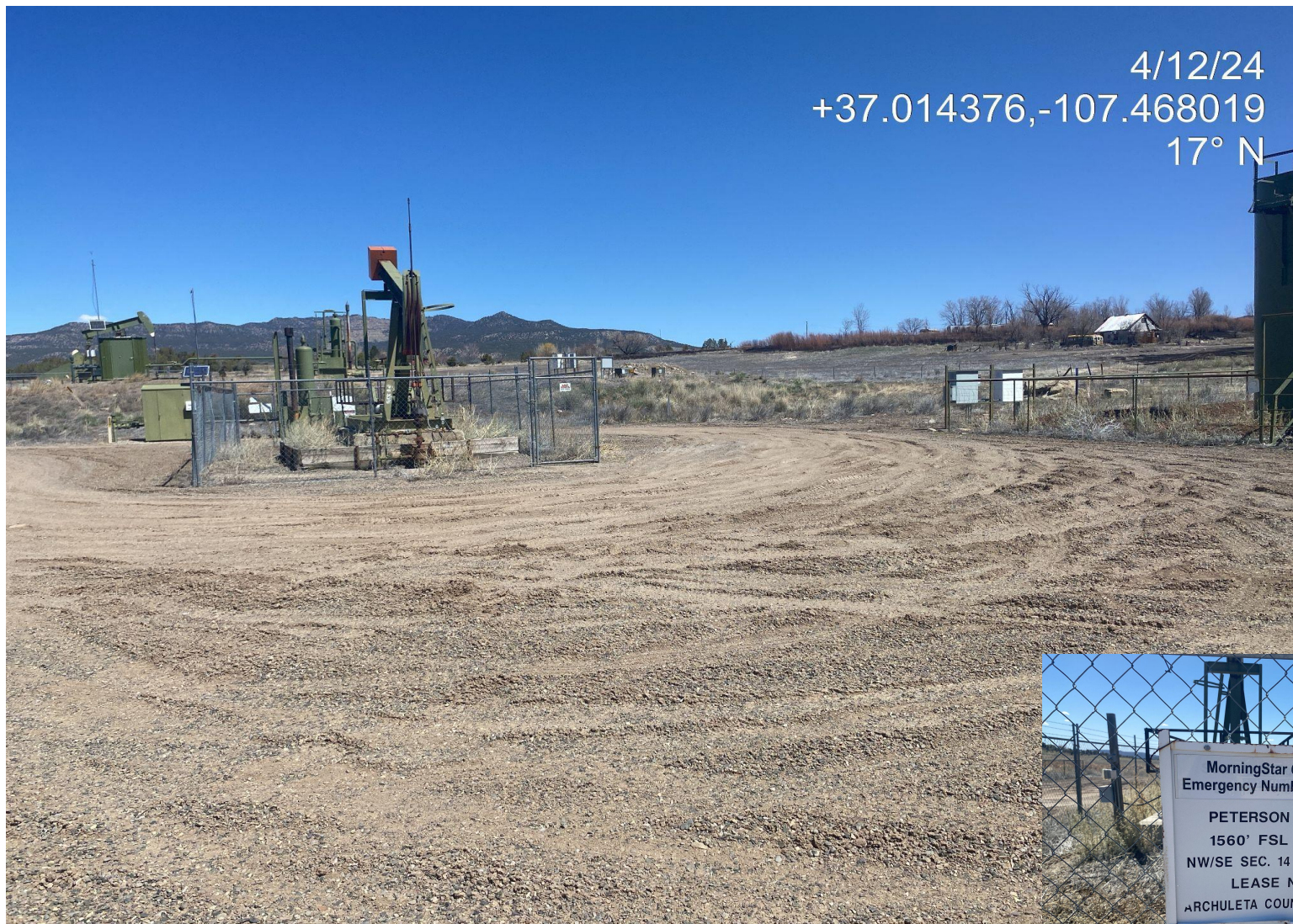
Photo 1. View of the well disturbance from the access point facing center.