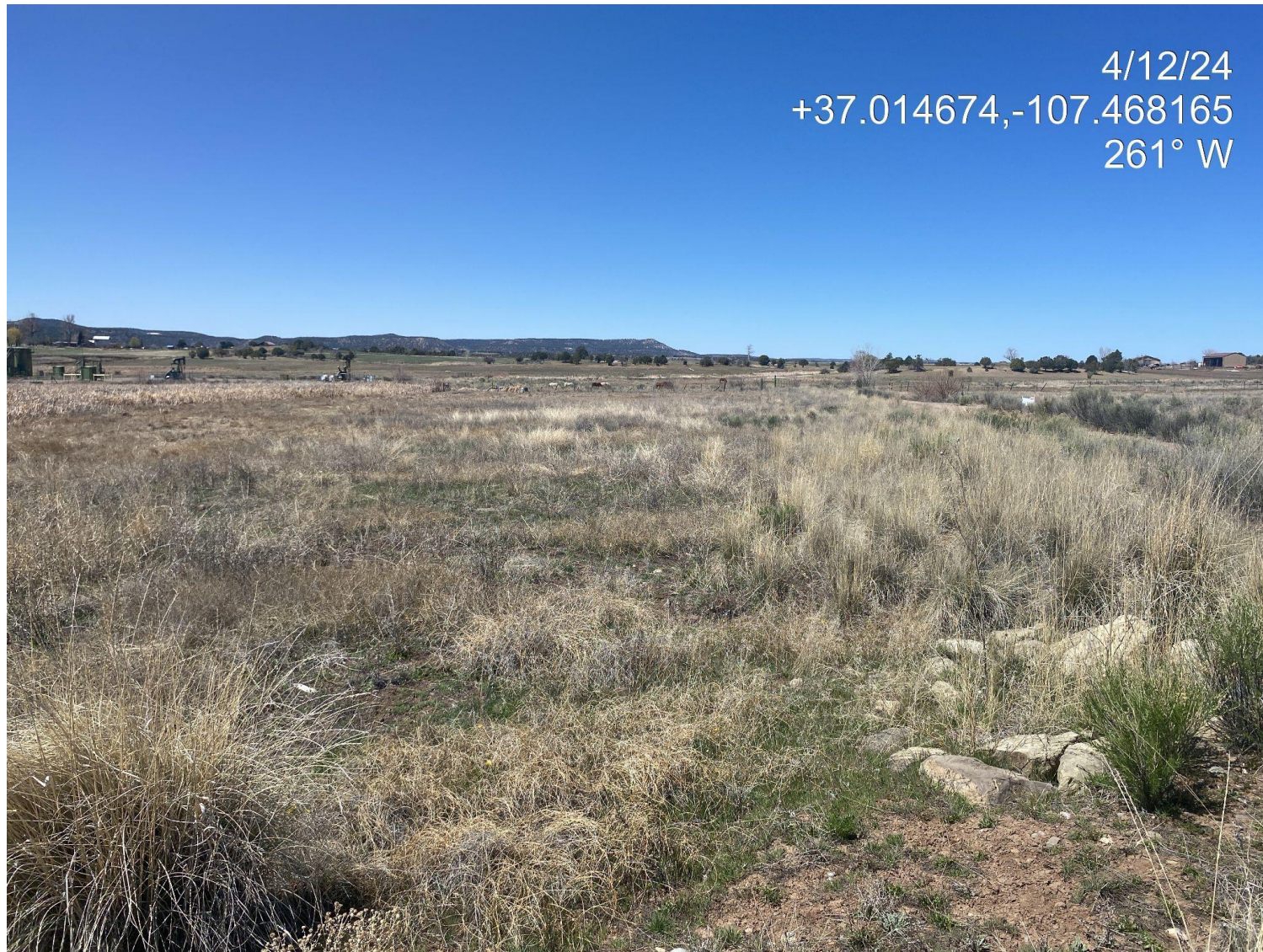
Photo 4. Reference area comprised of western wheatgrass and smooth brome.