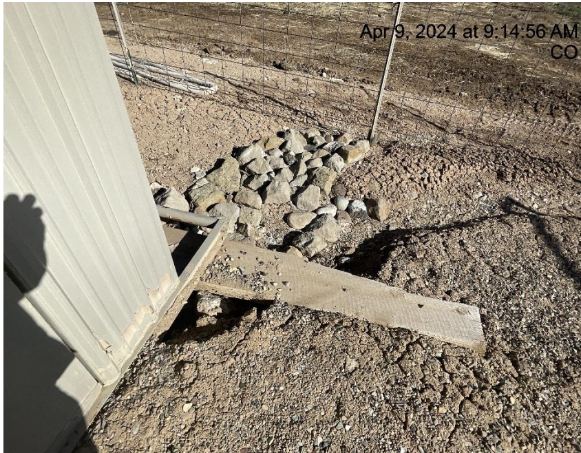
Photo # 3186 Rip Rap Run/BMP needs maintenance/stormwater eroding around BMP