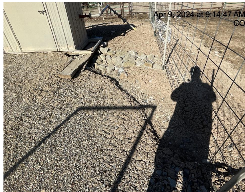
Photo # 3185 Rip Rap Run/BMP needs maintenance/stormwater eroding around BMP