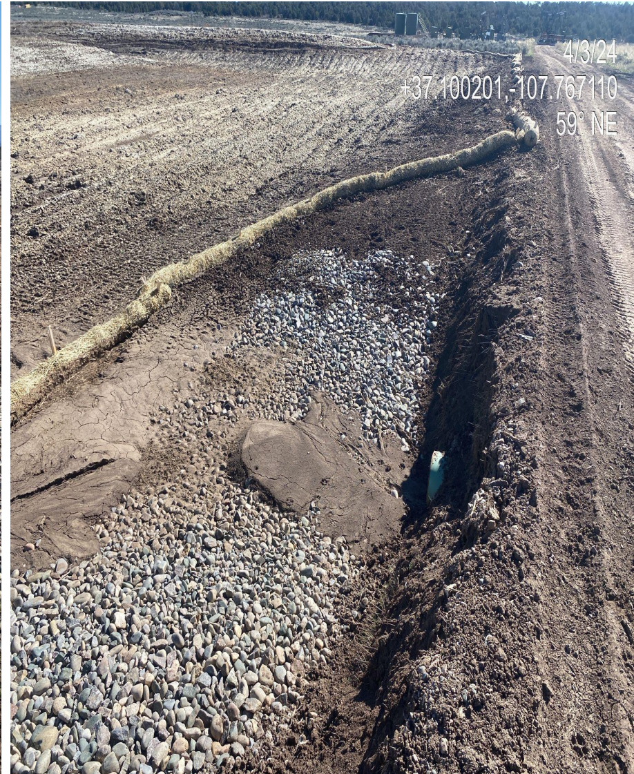
Photo 8. View of inflow and outflow of culvert built across access road that separates the southern and northern disturbances. Culvert has not been installed per good engineering practices and additional stabilization is needed.