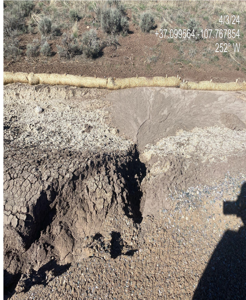
Photo 14. Gully erosion observed forming on the western edge of the southern tank pad disturbance. Maintenance is needed in this area.