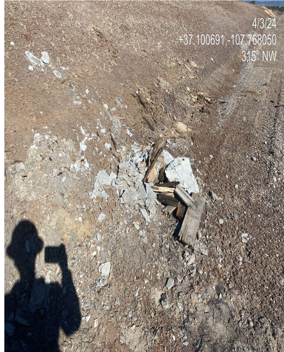
Photo 4. View of trash/debris observed in the southern and western edges of the well pad disturbance.