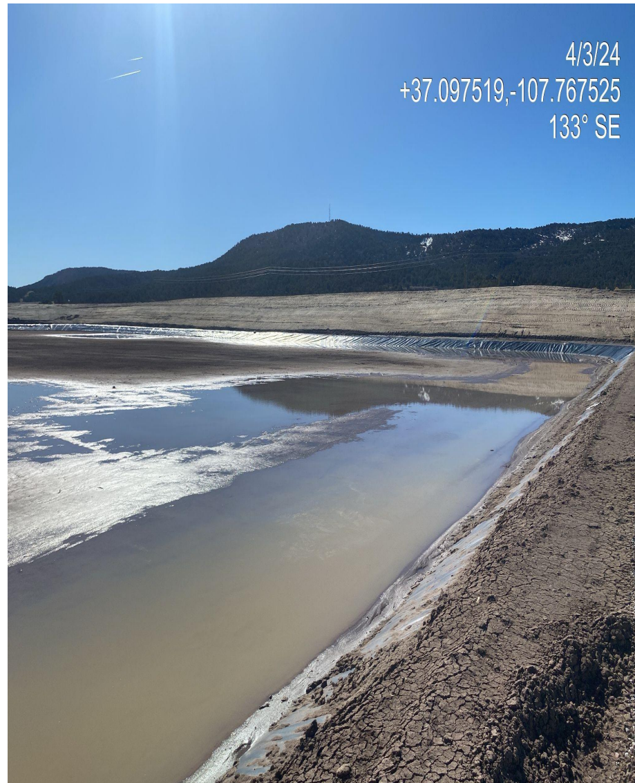
Photo 12. Storm water ponding appears evident on TUA pad. Pursuant to COA #10 a sump is planned for the northeast corner of the pad. Sump was not observed during inspection.