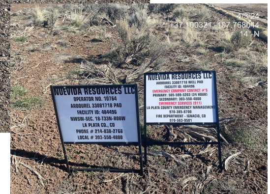
Photo 1. Overview of the northern well pad disturbance taken from the access point facing center.