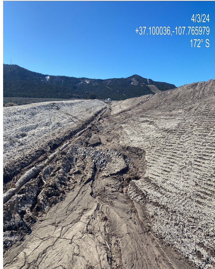
Photo 10. View of failing/inadequate stormwater BMPs in the northeast portion of the southern disturbance. Maintenance is needed in this area.