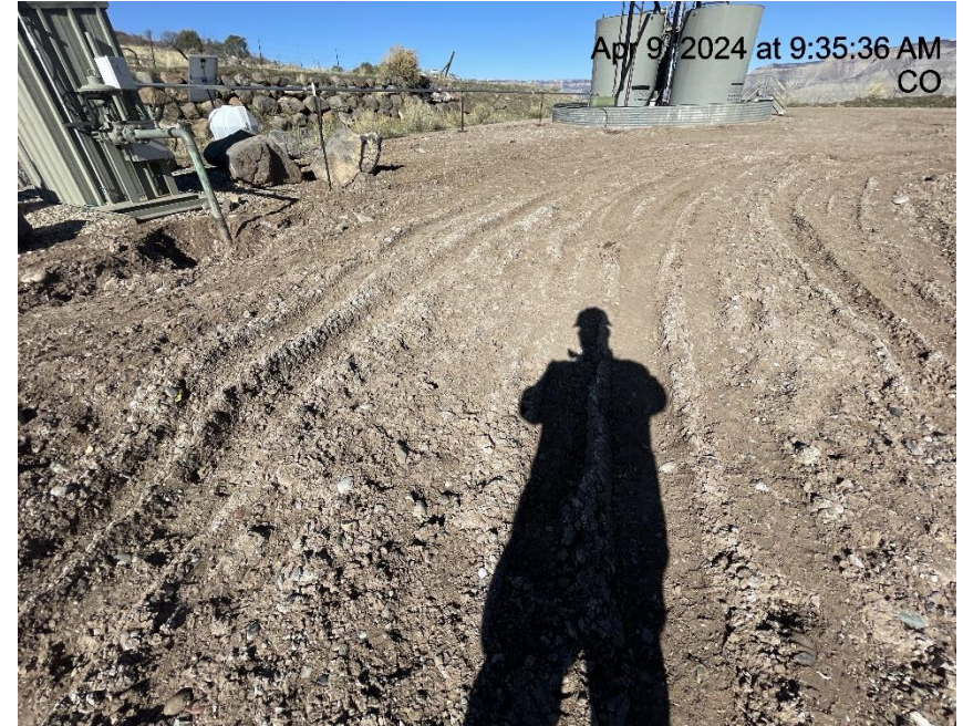
Photo # 3248 Lack of stabilization/compaction/insufficient tracking BMP's