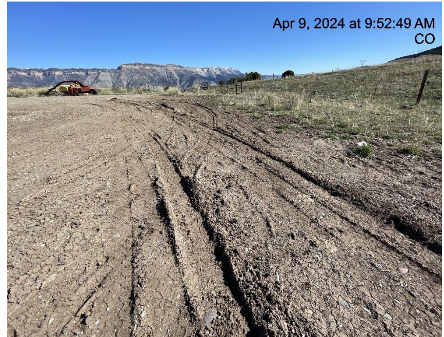
Photo # 3250 Lack of stabilization/compaction/insufficient tracking BMP's