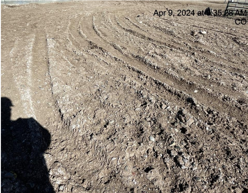
Photo # 3247 Lack of stabilization/compaction/insufficient tracking BMP's