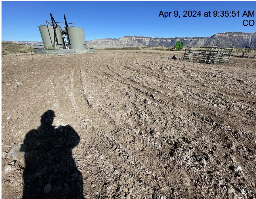
Photo # 3249 Lack of stabilization/compaction/insufficient tracking BMP's