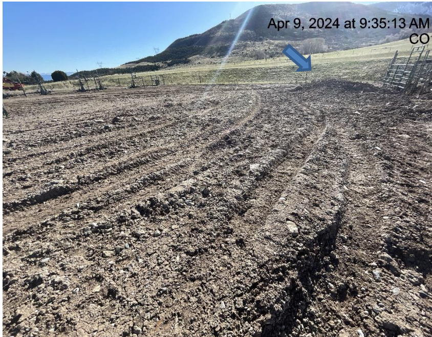
Photo # 3245 Lack of stabilization/compaction/insufficient tracking BMP's & soils stockpile with no BMP's in the background