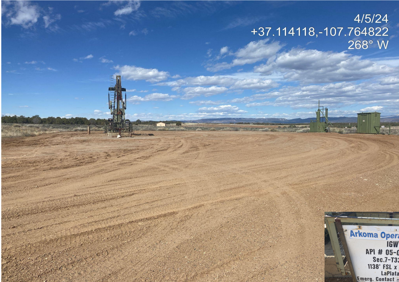
Photo 1. Overview of the well pad disturbance the access point facing center.