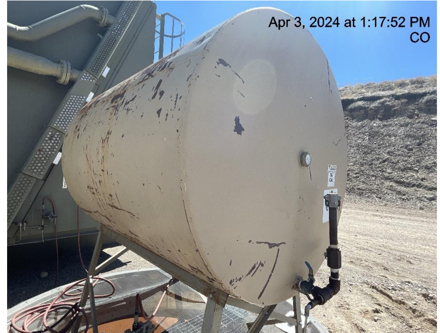
Photo # 2629 Tank missing required information & some information is illegible