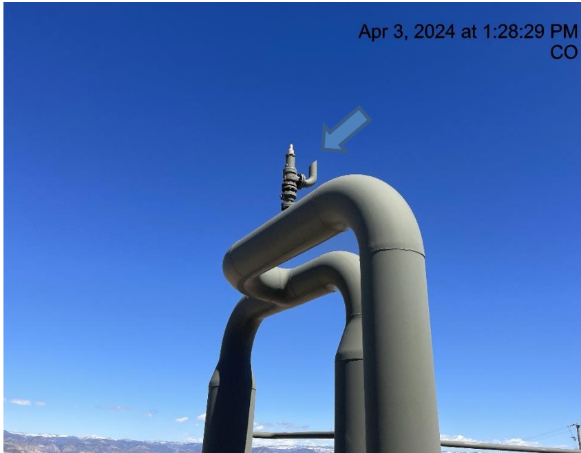
Photo # 2656 PRV vent line does not comply with CECMC pressure safety device rules