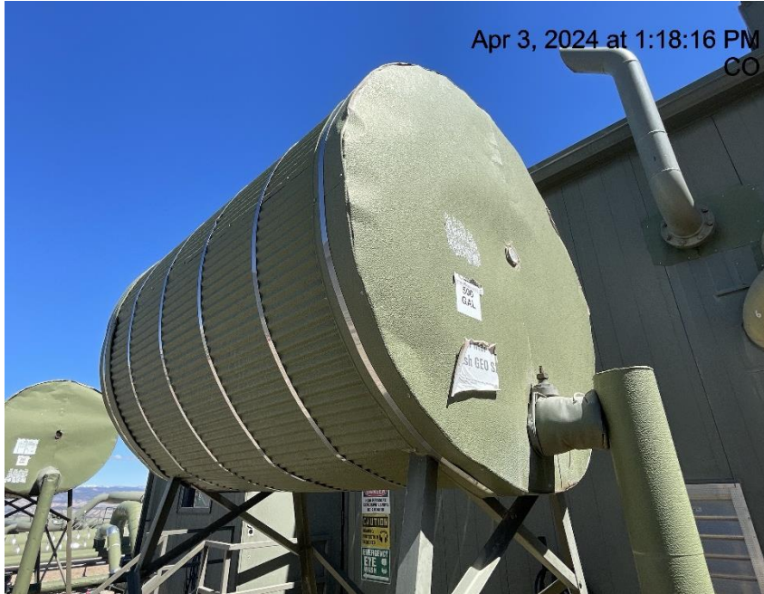
Photo # 2632 Tank missing required information & some information is illegible