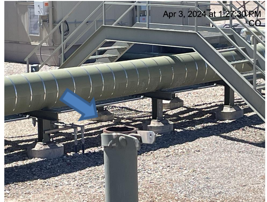
Photo # 2655 PRV vent line does not comply with CECMC pressure safety device rules