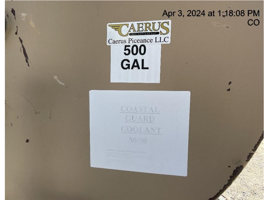
Photo # 2631 Tank missing required information & some information is illegible