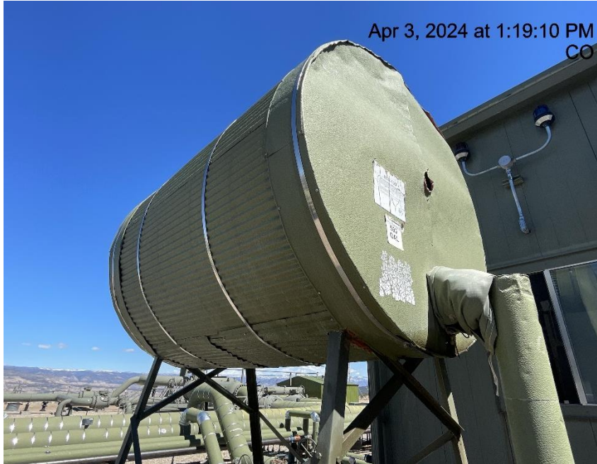
Photo # 2634 Tank missing required information & some information is illegible