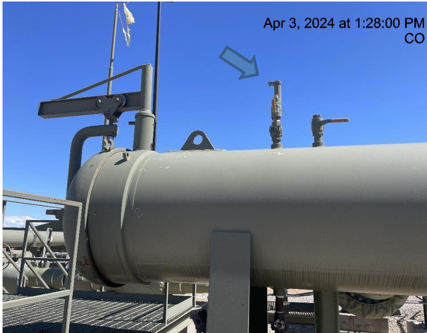
Photo # 2654 PRV vent line does not comply with CECMC pressure safety device rules