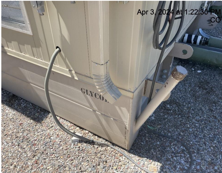
Photo # 2642 Storage tank on compressor skid lacks required labeling