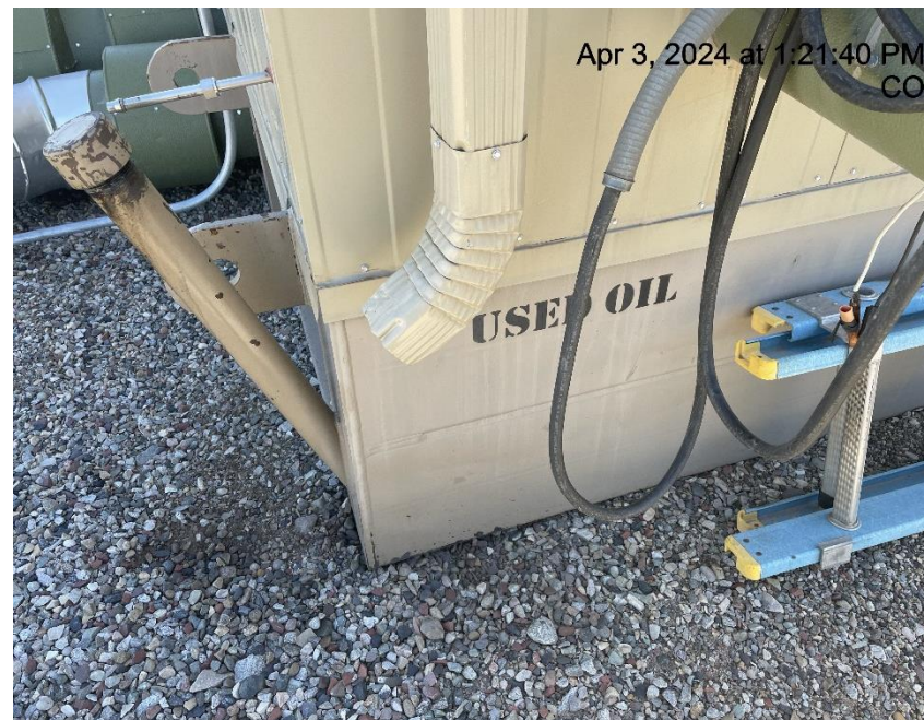
Photo # 2641 Storage tank on compressor skid lacks required labeling