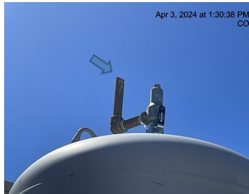
Photo # 2659 PRV vent line does not comply with CECMC pressure safety device rules