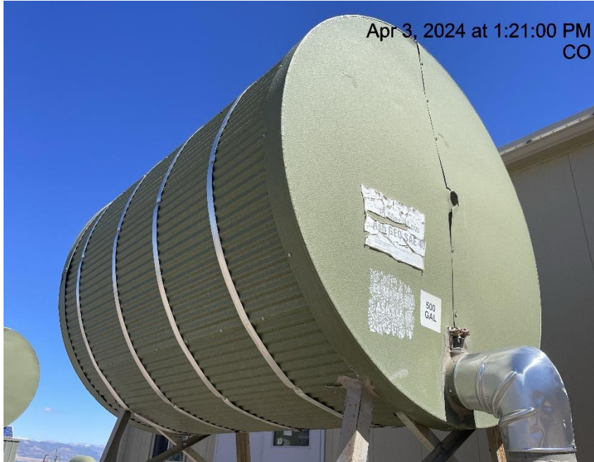
Photo # 2636 Tank missing required information & some information is illegible