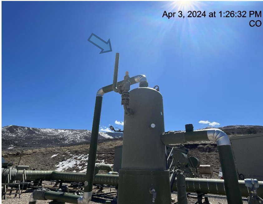
Photo # 2652 PRV vent line does not comply with CECMC pressure safety device rules