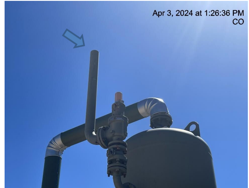
Photo # 2653 PRV vent line does not comply with CECMC pressure safety device rules