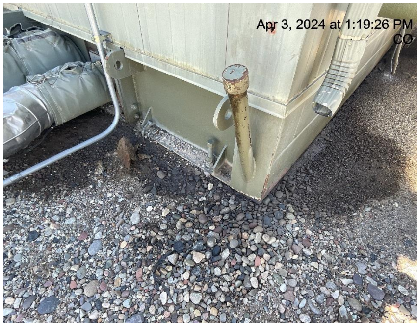
Photo # 2640 Storage tank on compressor skid lacks required labeling