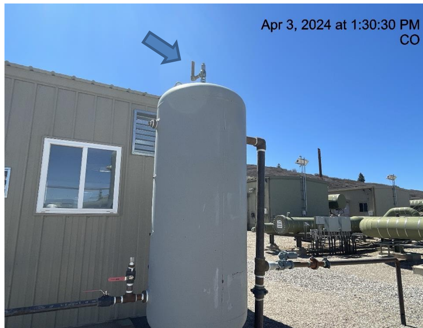
Photo # 2658 PRV vent line does not comply with CECMC pressure safety device rules