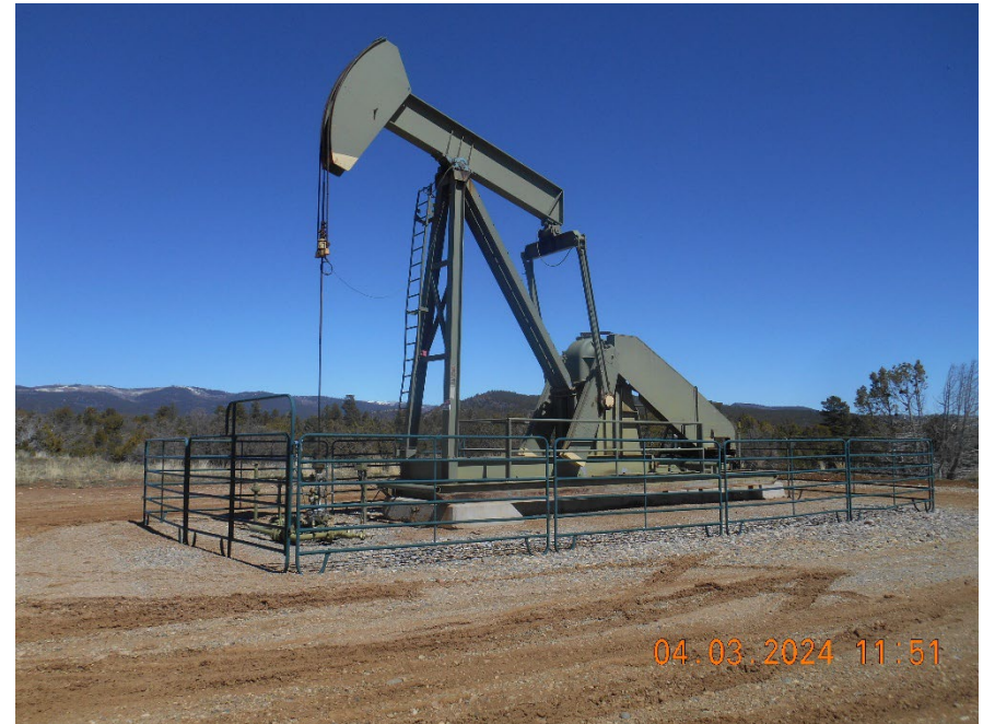
Wellhead with pump jack STATE #36-5 API #:05-067-08400