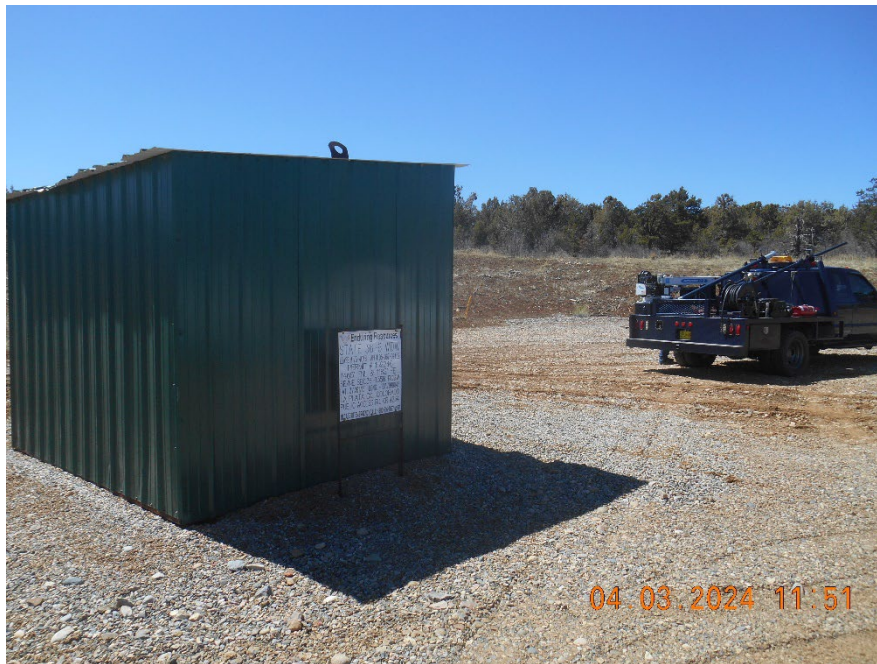
Injection wellhead during MIT STATE #36-6 API #:05-067-09452

Inspection Date:4/3/2024 Inspection Doc#: 693807028