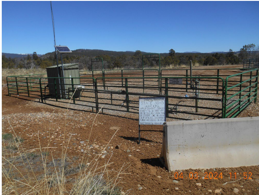
Location entrance with sign Gas meter and flowline fencing. Separator and tank battery removed

Inspection Date:4/3/2024 Inspection Doc#: 693807028