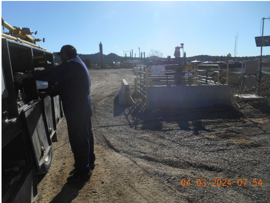
Injection wellhead during MIT