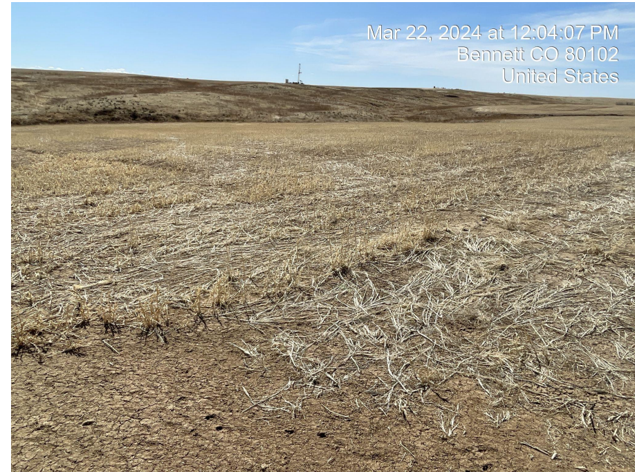
Photo 8. Photo taken facing southwest of harvested wheat field off site.