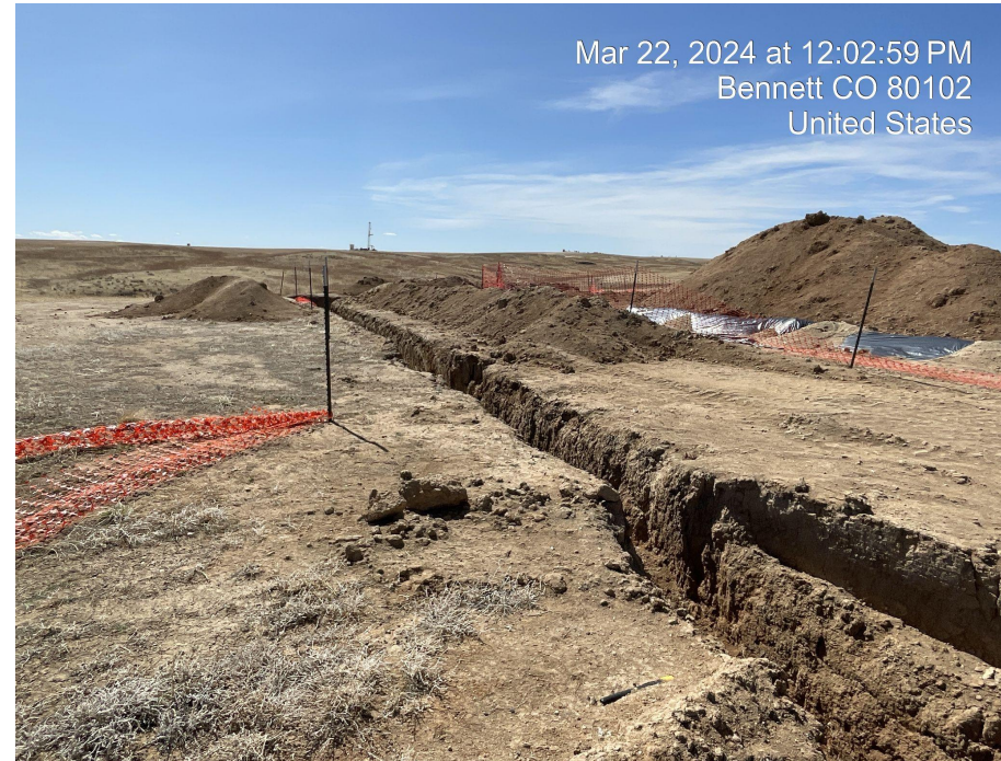
Photo 4. Photo taken facing west of excavation from flowline removal onsite, lacking exclusionary fencing.