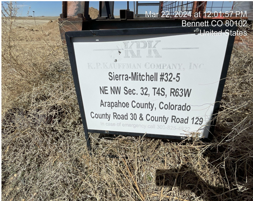
Photo 1. Photo taken facing north of location sign