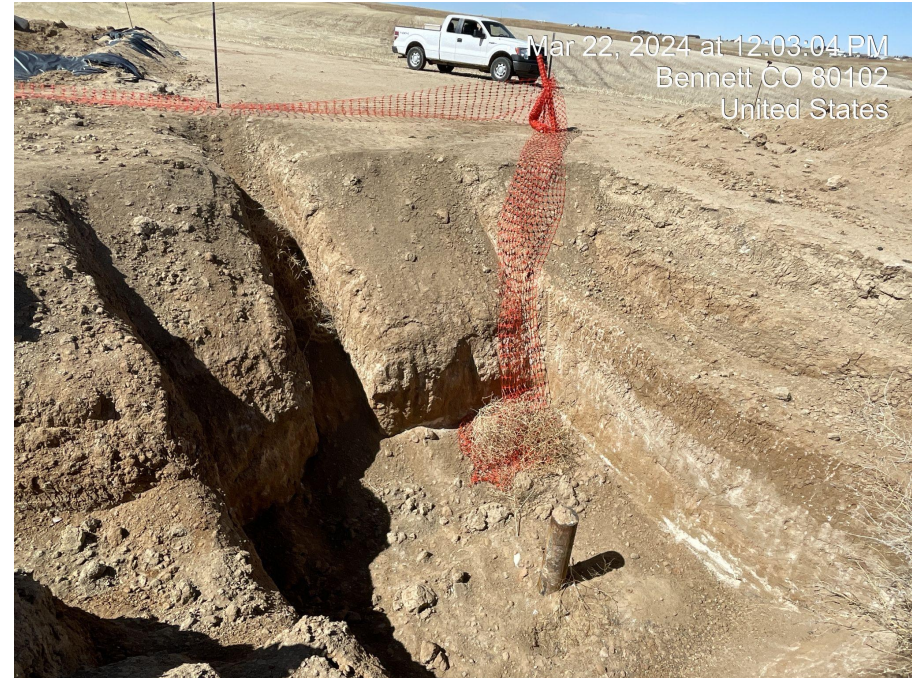
Photo 6. Photo taken facing northwest of open excavation and cut and capped well, lacking proper exclusionary fencing.