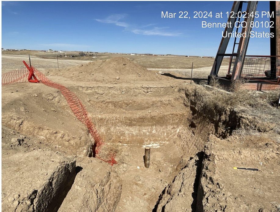
Photo 3. Photo taken facing north of open excavation and cut and capped well, lacking exclusionary fencing.