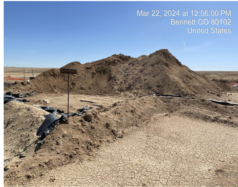
Photo 12. Photo taken facing southeast of contaminated soil stockpile on site.