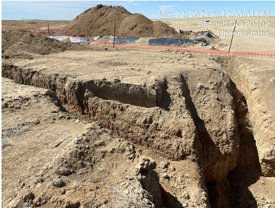
Photo 5. Photo taken facing north of open excavation, lacking exclusionary fencing.