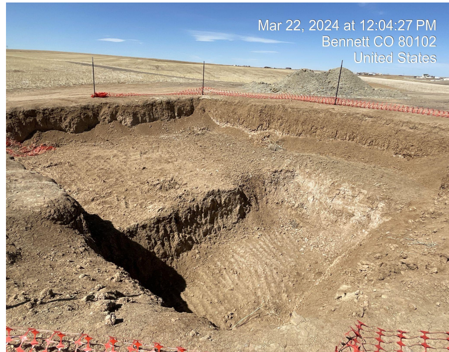
Photo 9. Photo taken facing southeast of harvested wheat field off site.