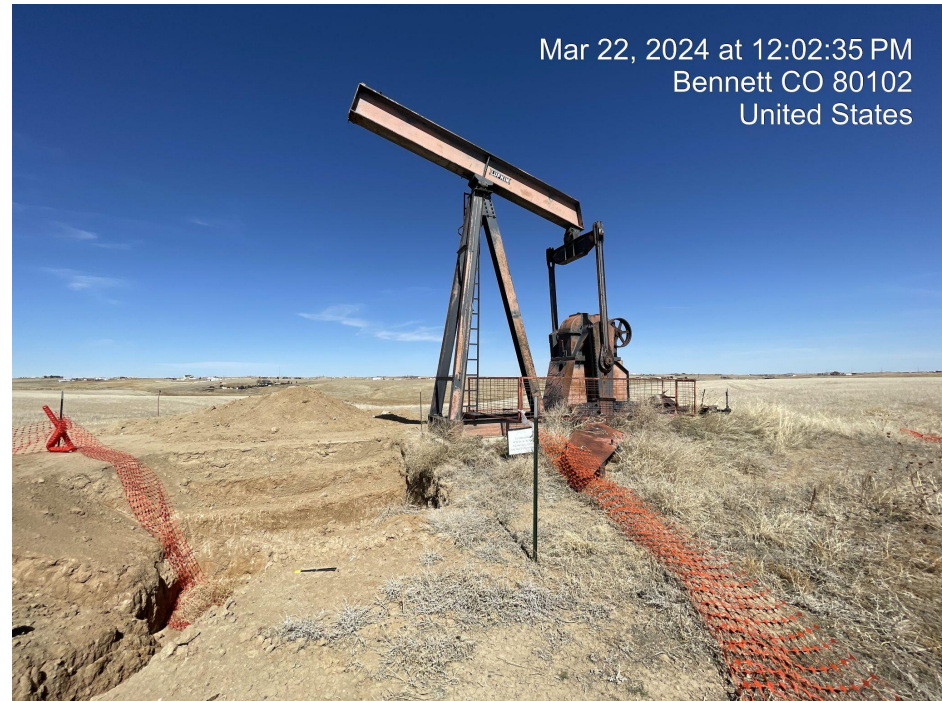
Photo 2. Photo taken facing north of weeds (kochia & russian thistle) around wellhead/pumpjack and on site.