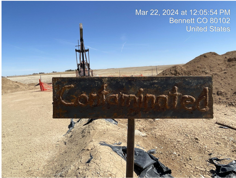
Photo 11. Photo taken facing east of contaminated sign posted on stockpile of soil on site.