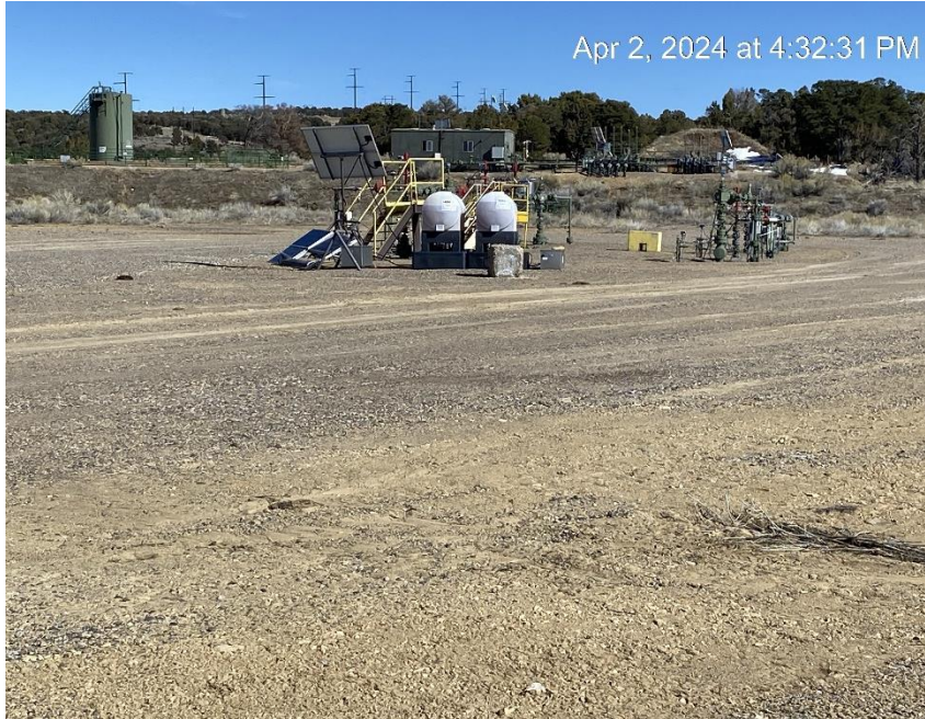
Well pad from Northwest corner