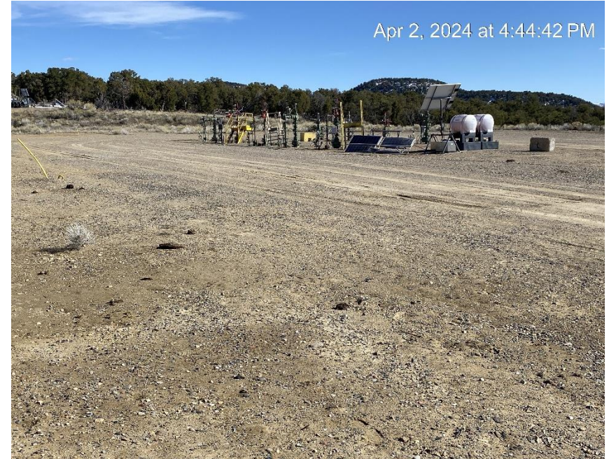
Well pad from Northeast corner