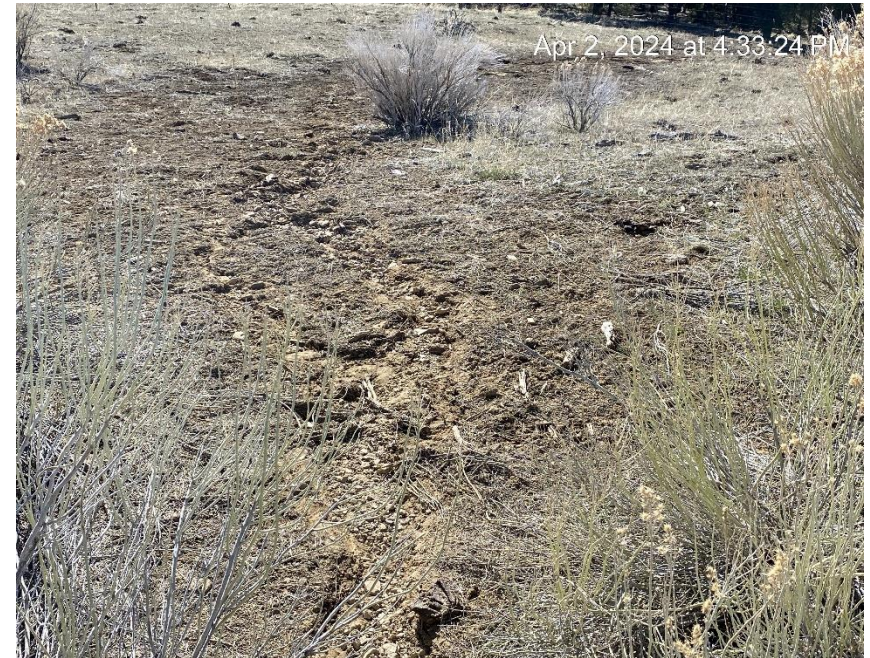
Erosion and sediment migration