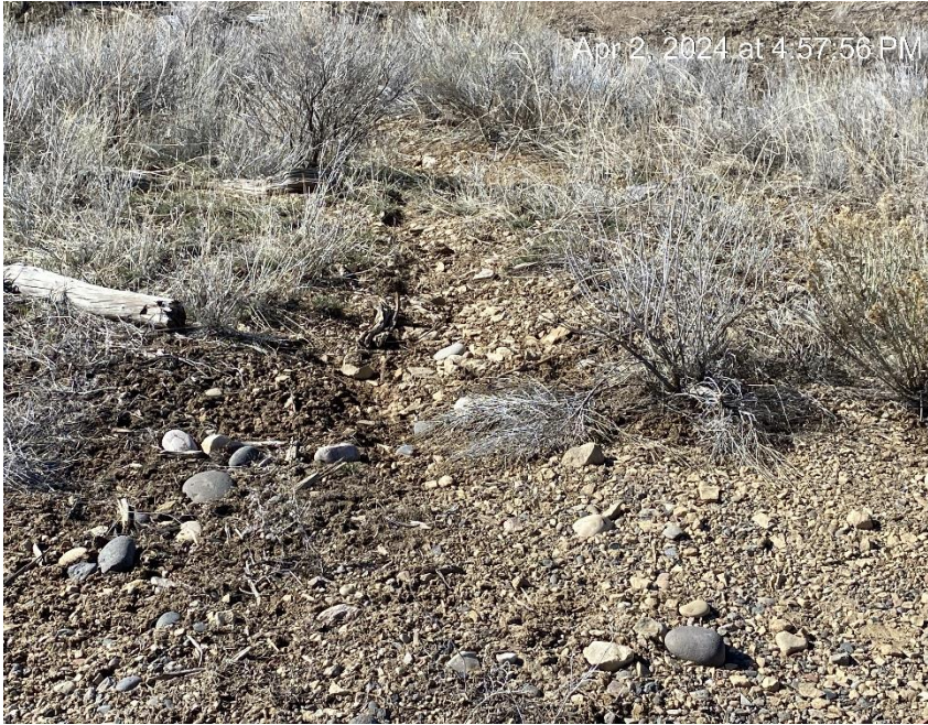
Erosion and sediment migration