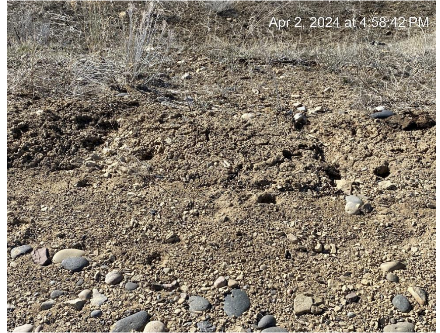
Erosion and sediment migration