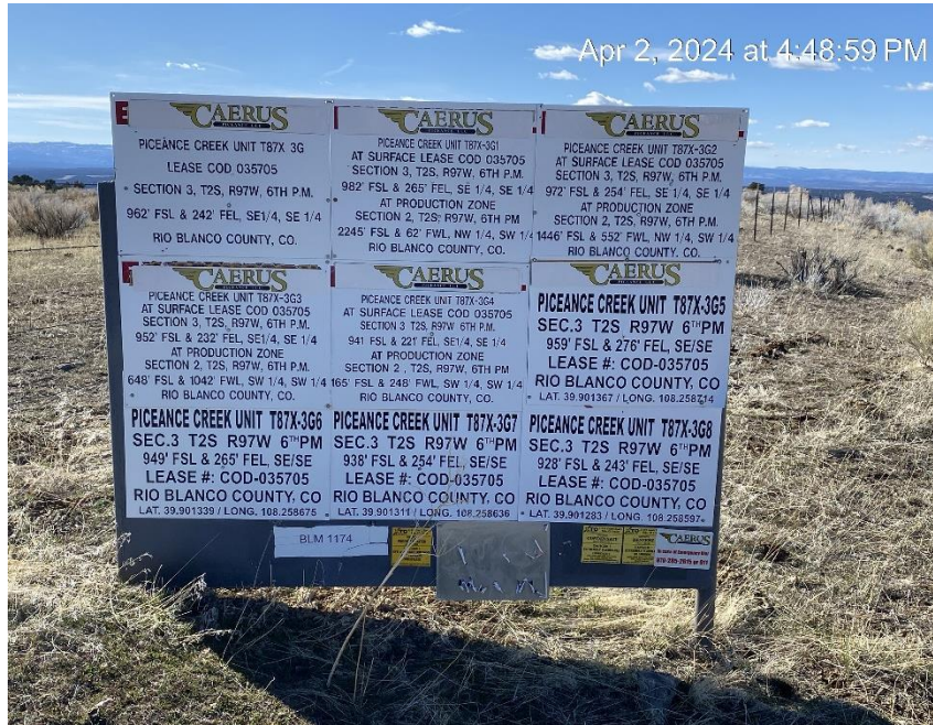
When replaced additional information is required