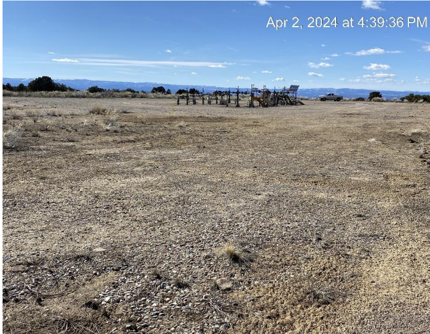
Well pad from Southeast corner