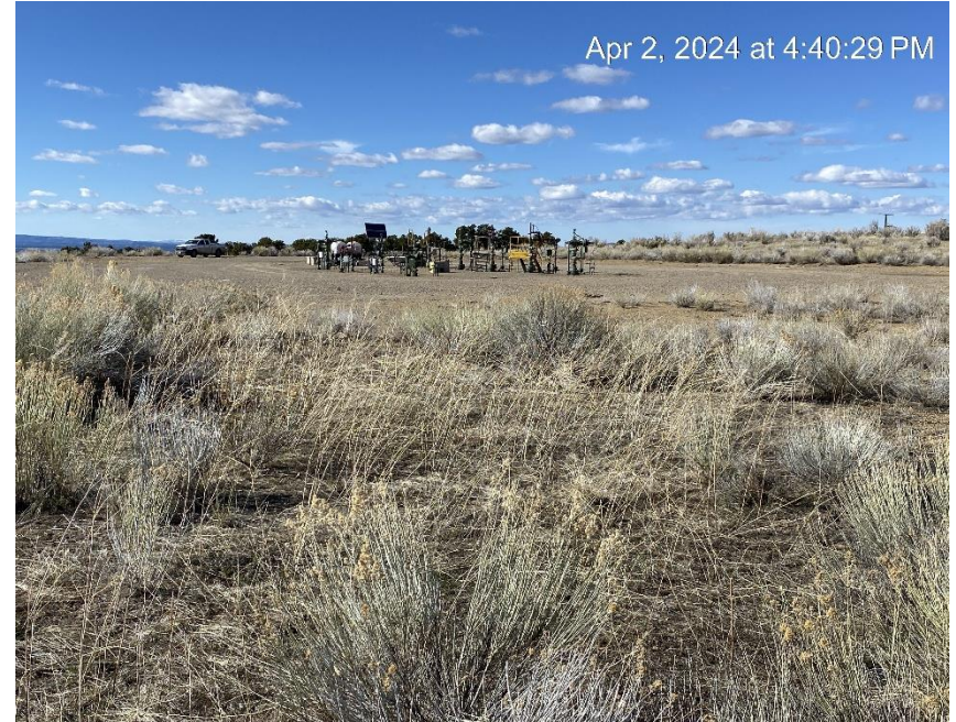
Well pad from Southwest corner