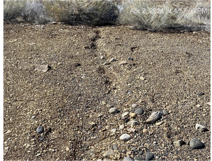
Erosion and sediment migration