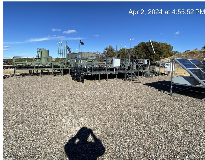
Production facility from Northwest corner