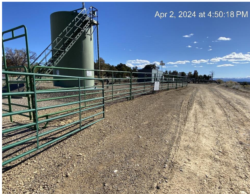
Production facility from Northeast corner