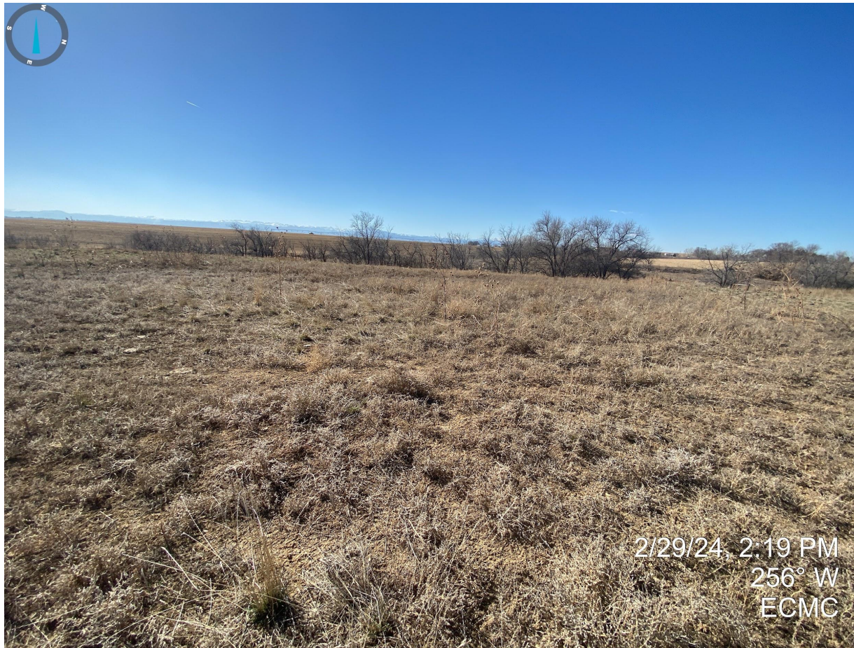
Photo 7. The reclaimed area is not reflective of the adjacent reference area (Photo 8). Some desirable species were observed, however, the majority of the reclaimed area is undesirable vegetation (e.g. kochia).