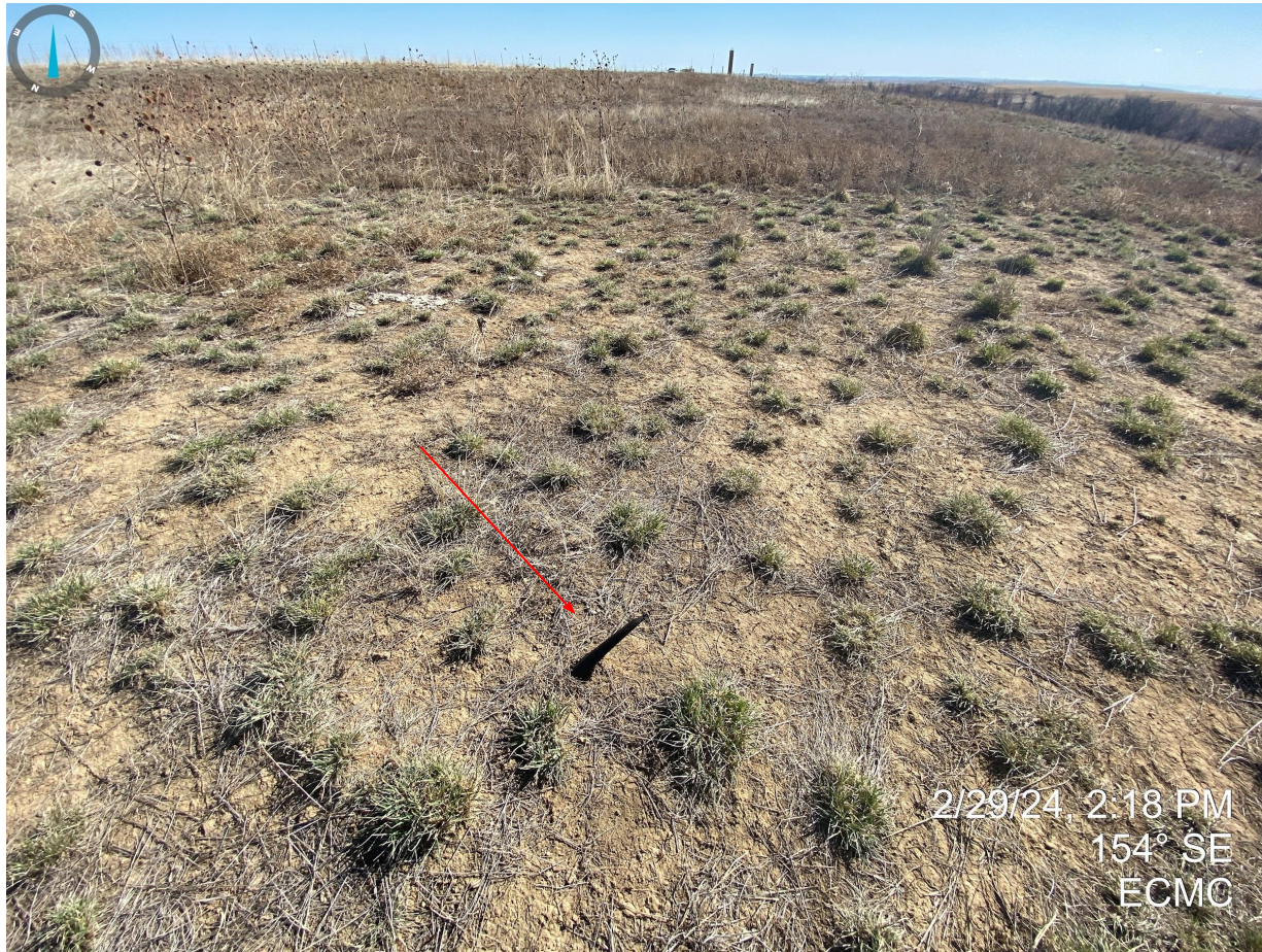
Photo 3. Plastic piping (debris) observed on the northern end of the location.