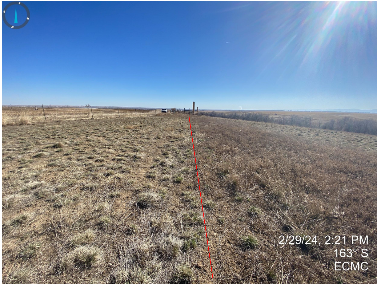
Photo 5. Taken along the access road, facing south. The reclaimed access road (right of red line) is not reflective of the adjacent reference area (left of red line).