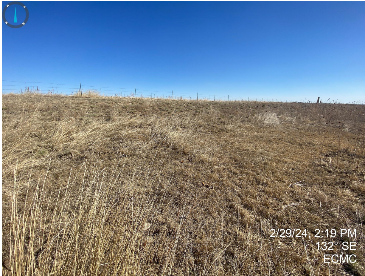
Photo 8. Reference area photo taken northeast of the former well location.