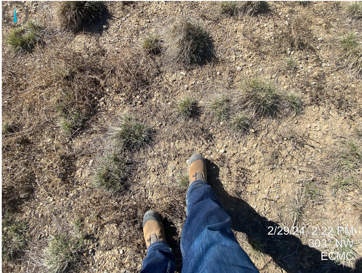
Photo 6. Close up of road base material that was observed on the location and access road.