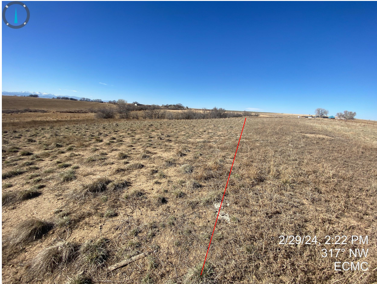
Photo 4. Taken along the access road, facing northwest. The reclaimed access road (right of red line) is not reflective of the adjacent reference area (left of red line).