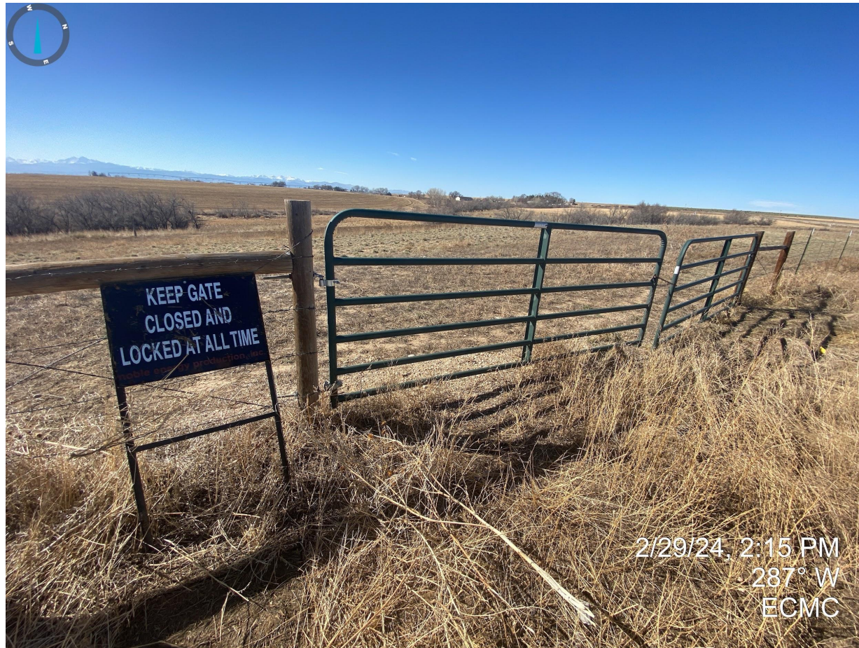
Photo 1. Location signage will need to be removed.