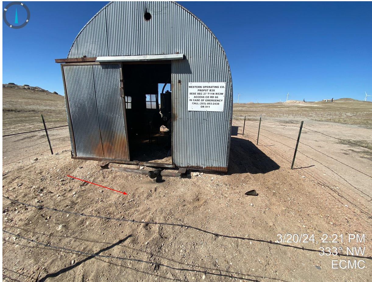
Photo 11. Stained soils appear to have been removed at pumpjack exhaust.