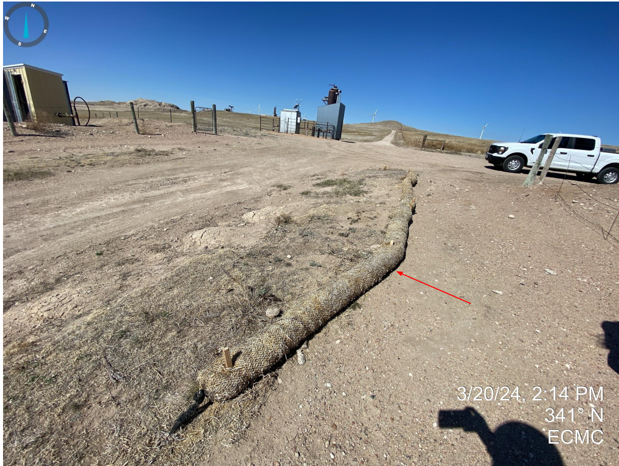
Photo 3. Straw wattle BMP does not appear to be properly installed via good engineering practices (e.g. trenched and backfilled).