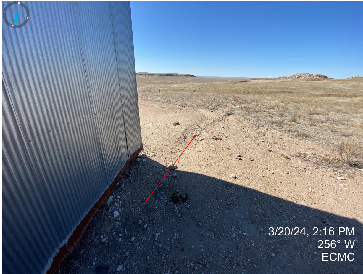
Photo 6. Erosion degradation occurring north of the meter shed. No visible stormwater control measures observed.