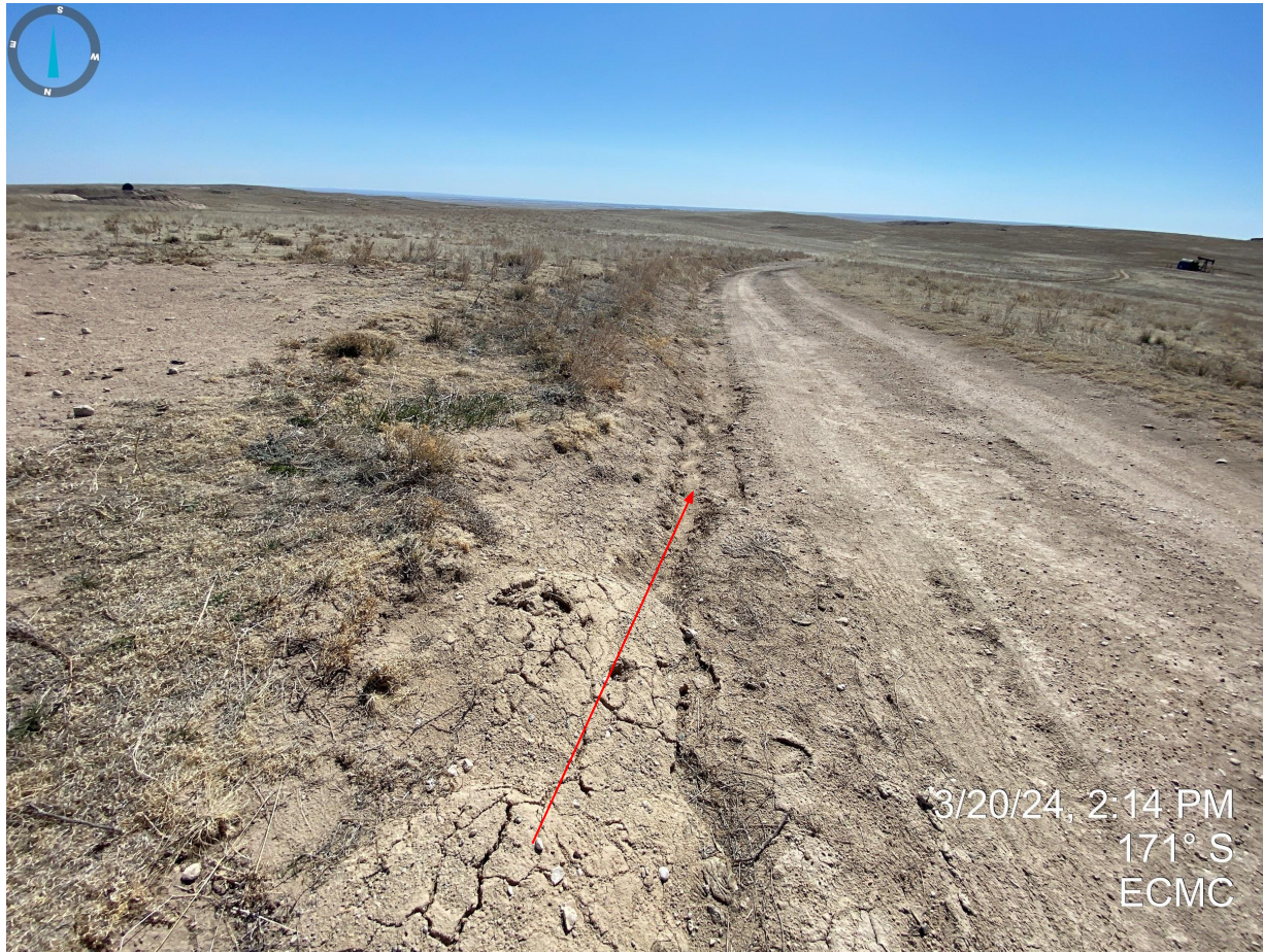
Photo 4. Erosion degradation occurring alongside the access road leading to well API 075-06964.