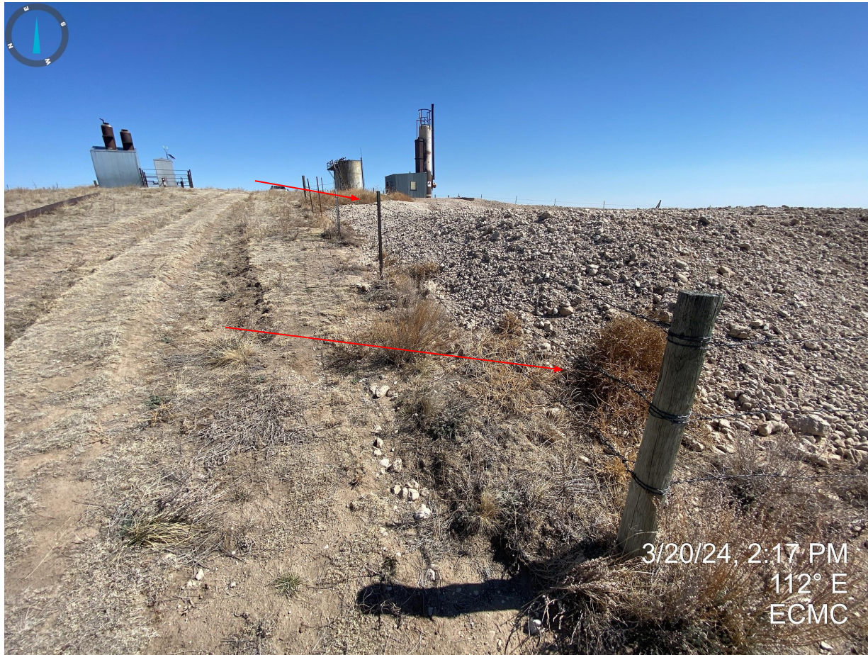
Photo 8. Weed debris accumulations within the pit do not appear to have been removed since documented on previous inspections.