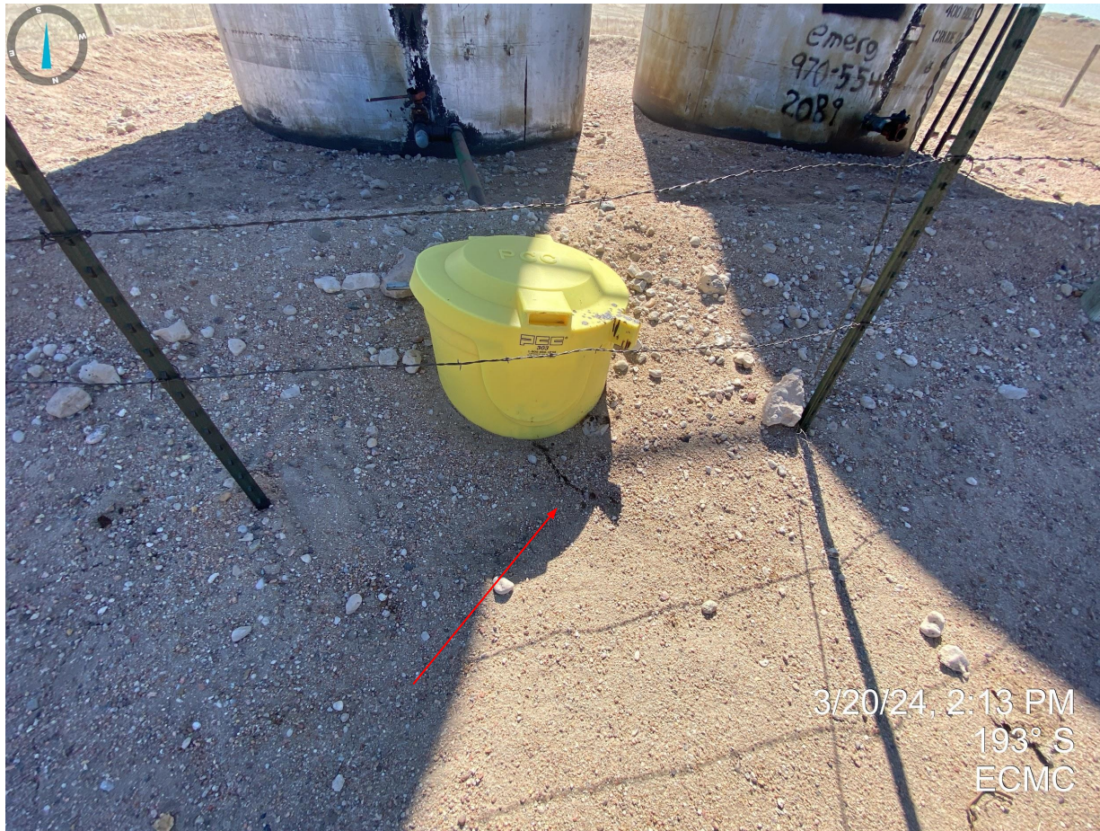
Photo 1. Stained soil observed at tank battery loadout line.