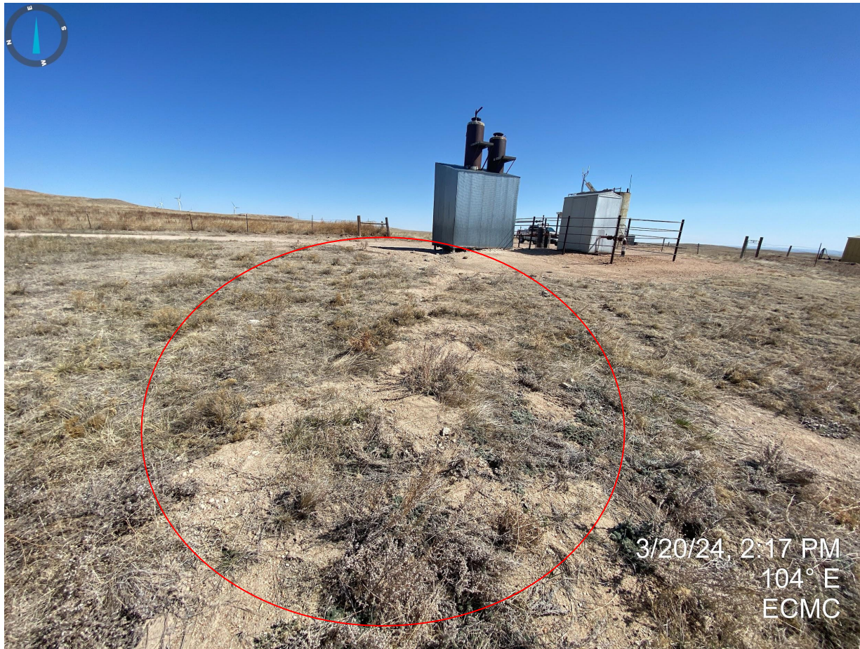
Photo 7. Evidence of sediment deposition occurring north of the meter shed.