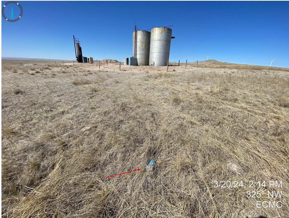
Photo 2. Trash observed southeast of tank battery.