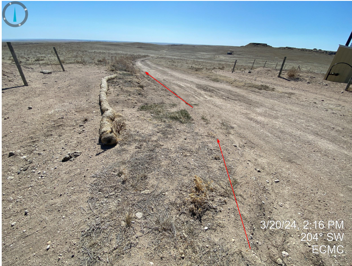
Photo 5. Taken west of the tank battery; see comments in Photos 3 & 4 for additional.