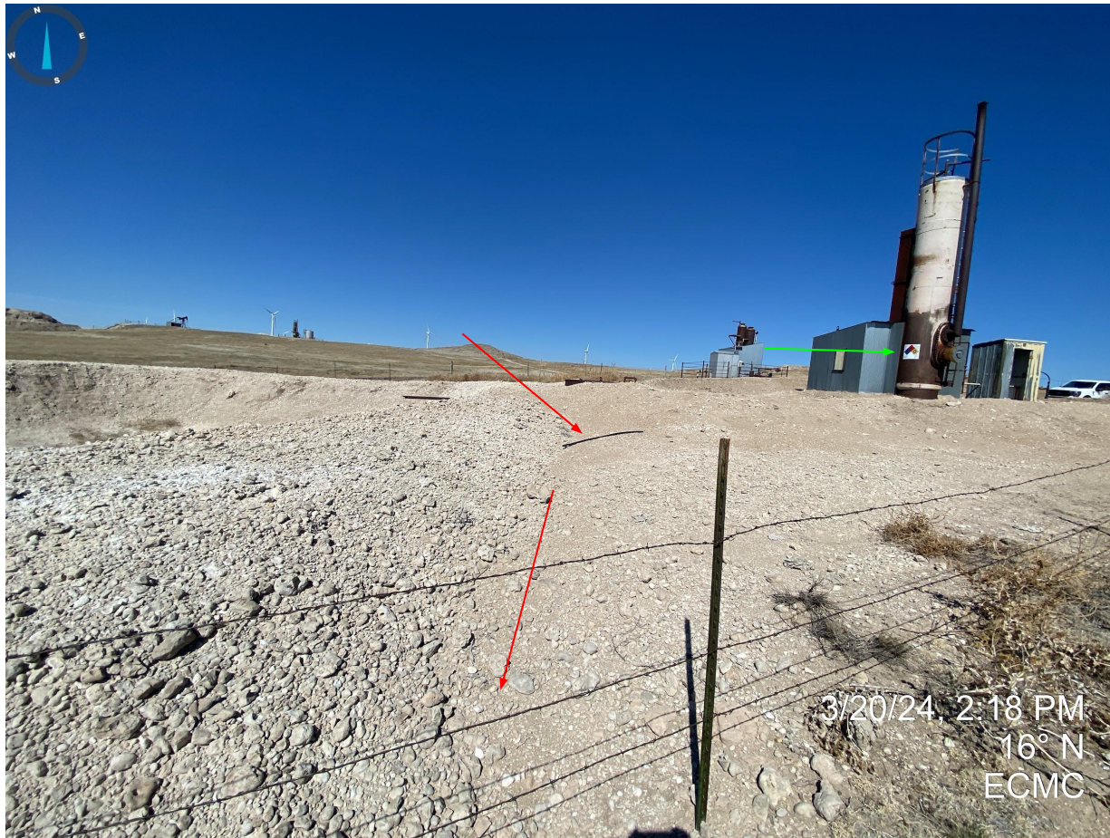
Photo 10. Debris (plastic piping) and erosion degradation within the pit area, illustrated by red arrows. Also pictured (green arrow) NFPA placard installed at vertical separator.