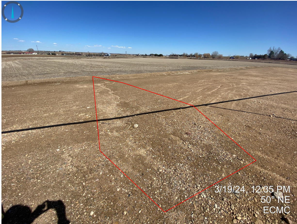
Photo 3. Erosion degradation (e.g. riling) occurring on the north side of the tank battery.