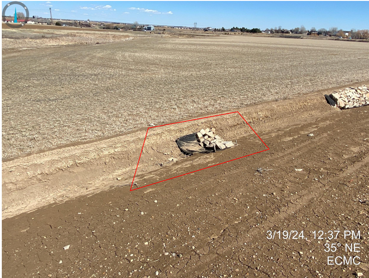
Photo 7. Stormwater control measure/BMPs requires maintenance as stormwater is beginning to undercut the velocity check/structure.