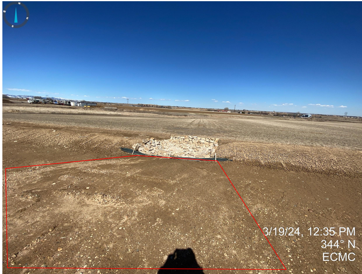
Photo 4. Erosion degradation (e.g. riling) occurring near one of the northern sediment traps. Sediment trap appears to have been recently replaced or had repairs.