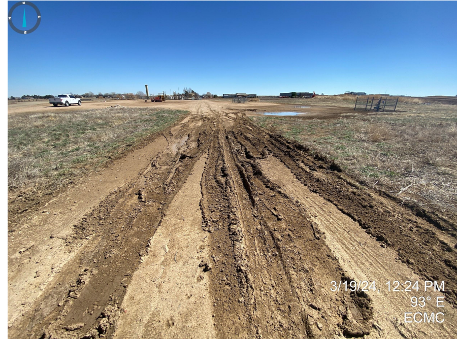
Photos 1 & 2. Taken near the location entrance and access road intersection. Access road requires maintenance as it is beginning to rut which can contribute to vehicle track out.