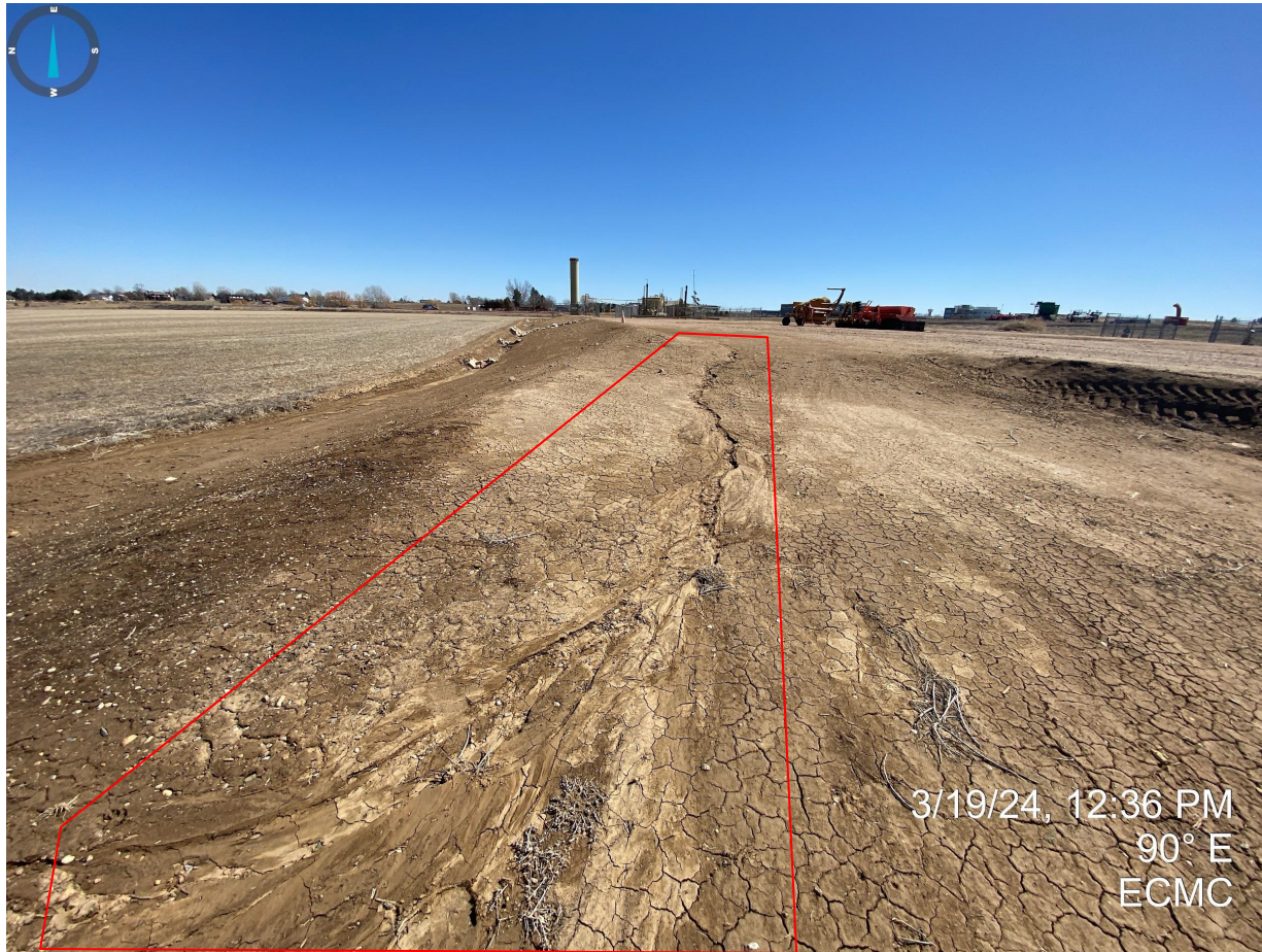
Photo 6. Continued from Photo 5, facing east.