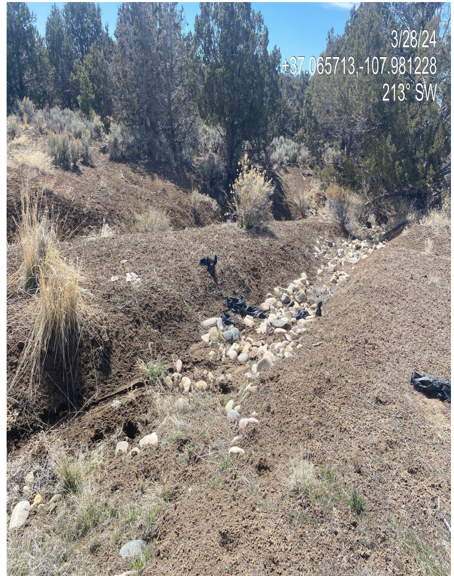
Photo 4. View of gully erosion observed forming in the southwest corner of the disturbance. Current stormwater BMPs are not adequate.