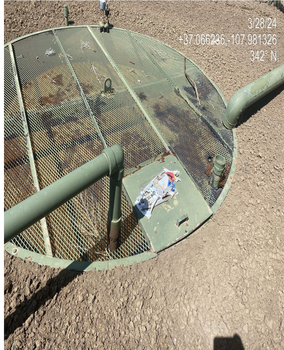
Photo 5. Produced water signs on location are deteriorating and illegible.