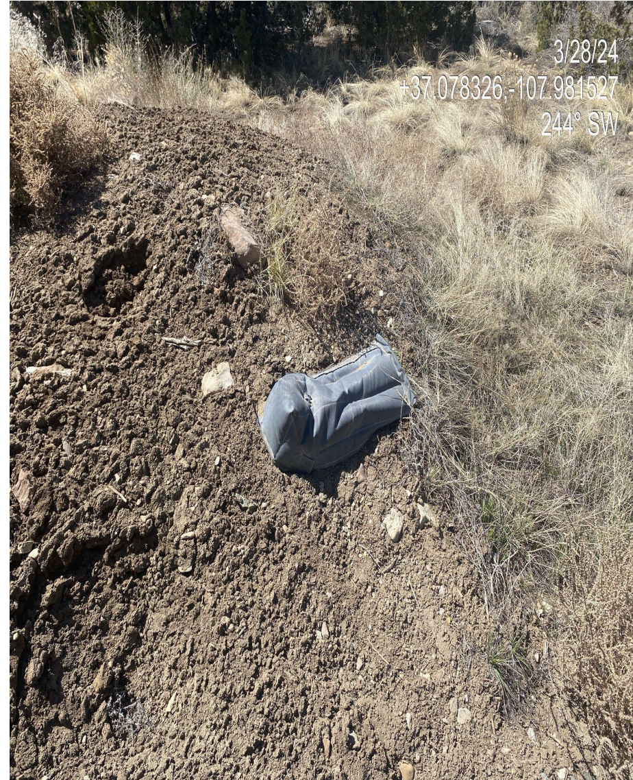
Photo 3. Trash observed in the western interim reclamation area.