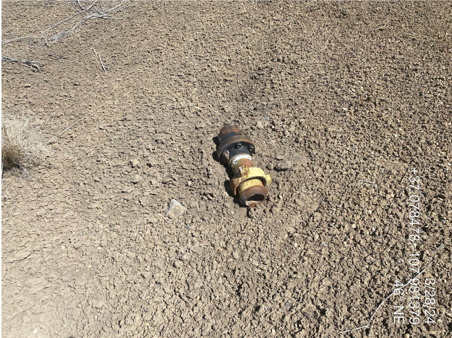
Photo 4. Unused oil and gas fitting equipment observed on location.