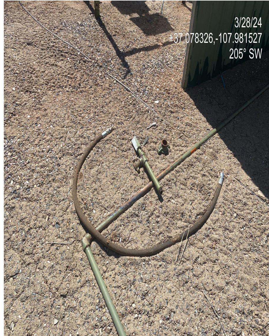
Photo 5. Additional unused oil and gas equipment observed on location.