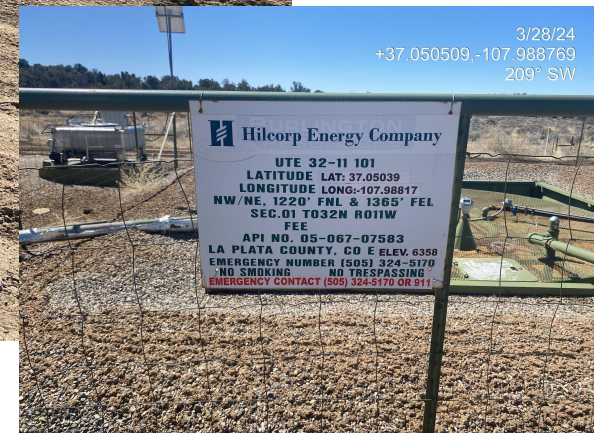
Photo 1. Overview of the disturbance taken from the access point facing center.