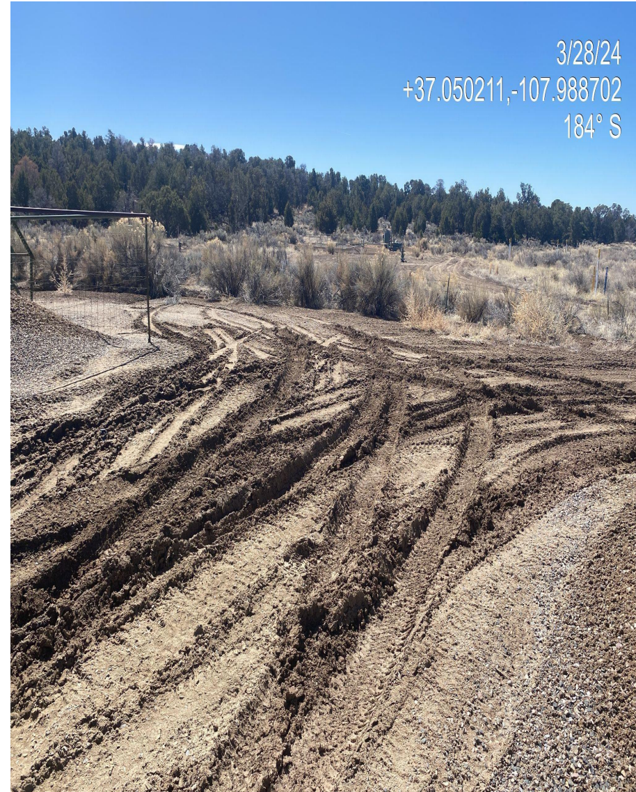
Photo 3. Rutting observed in the southern portion of the disturbance. Additional stabilization is needed to minimize stormwater and site degradation.