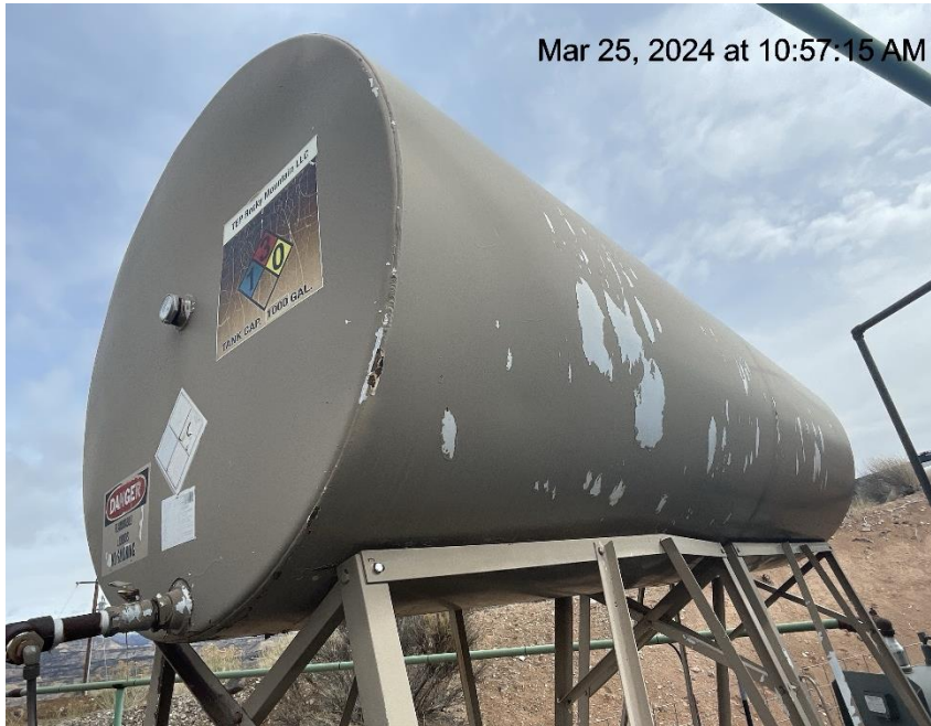
Photo # 1195 Methanol tank label weathered/damaged & some required information illegible.