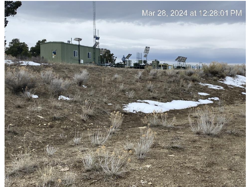
Production facility from Southwest corner of well pad