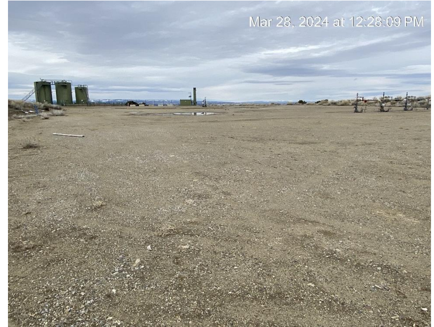
Well pad from Southwest corner