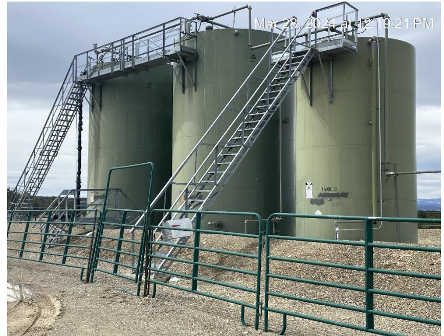
No sign at tank battery