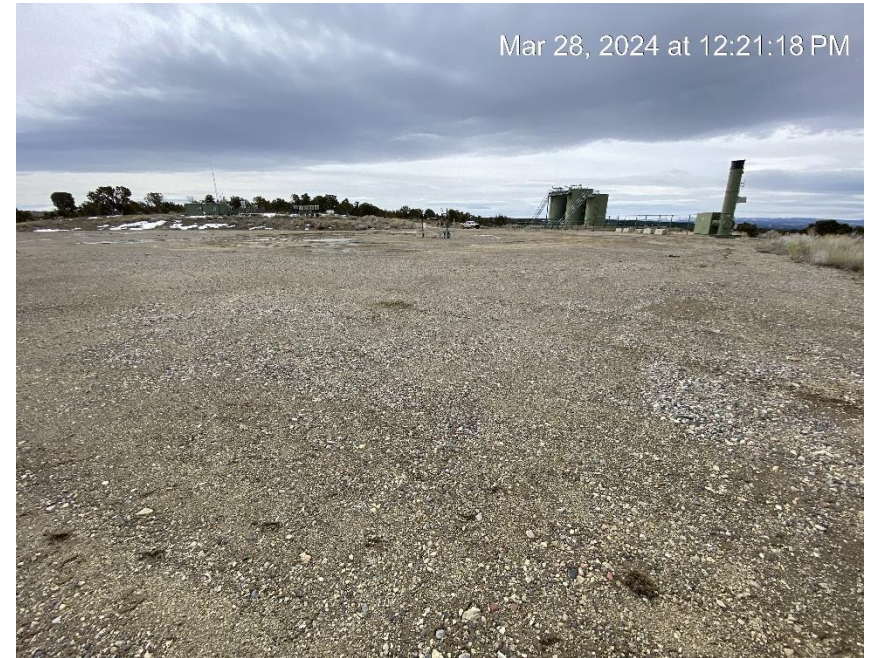
Well pad from Northeast corner