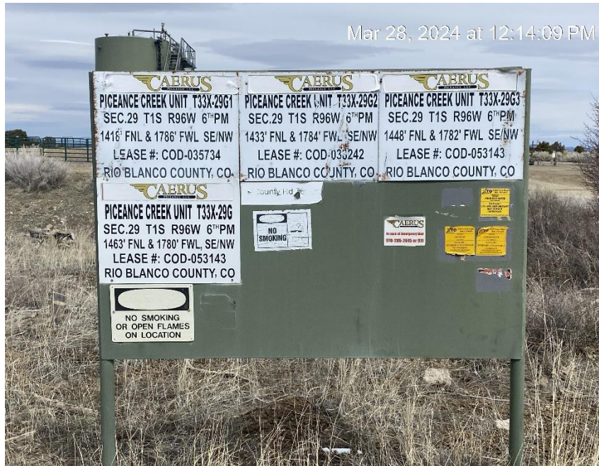
When replaced additional information is required