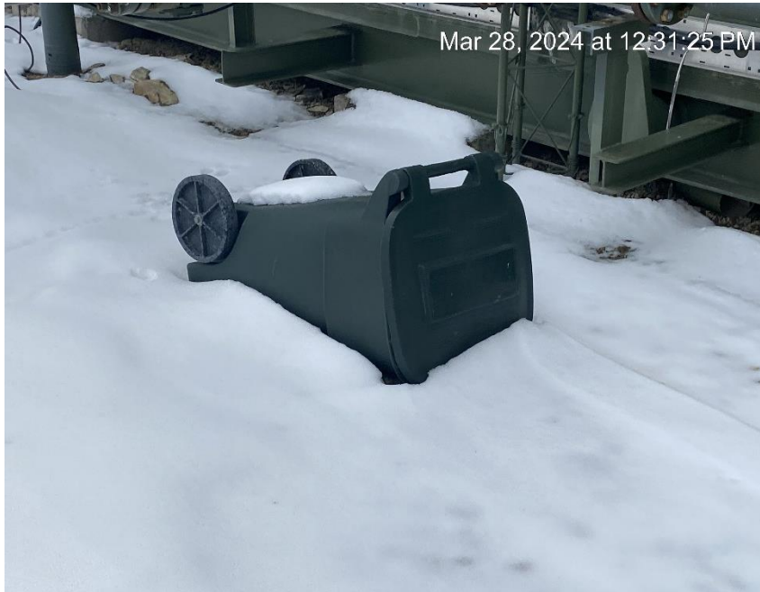
Debris. Bear proof if used as a trash container or place inside