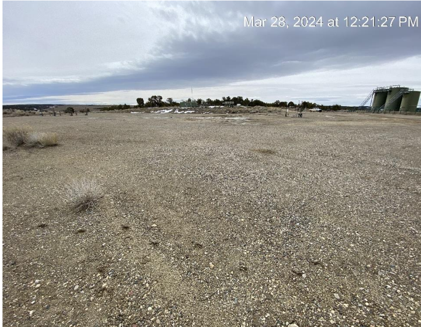
Well pad from Southeast corner