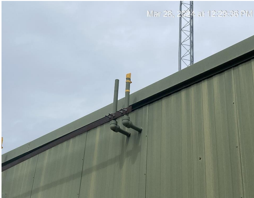
Separator relief riser missing rain protection