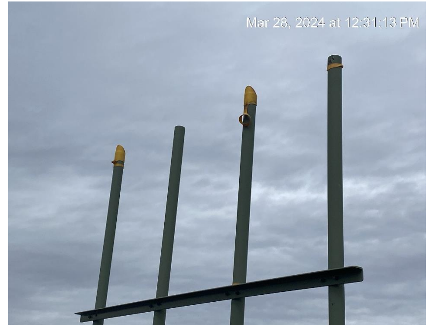
Manifold relief risers missing rain protection