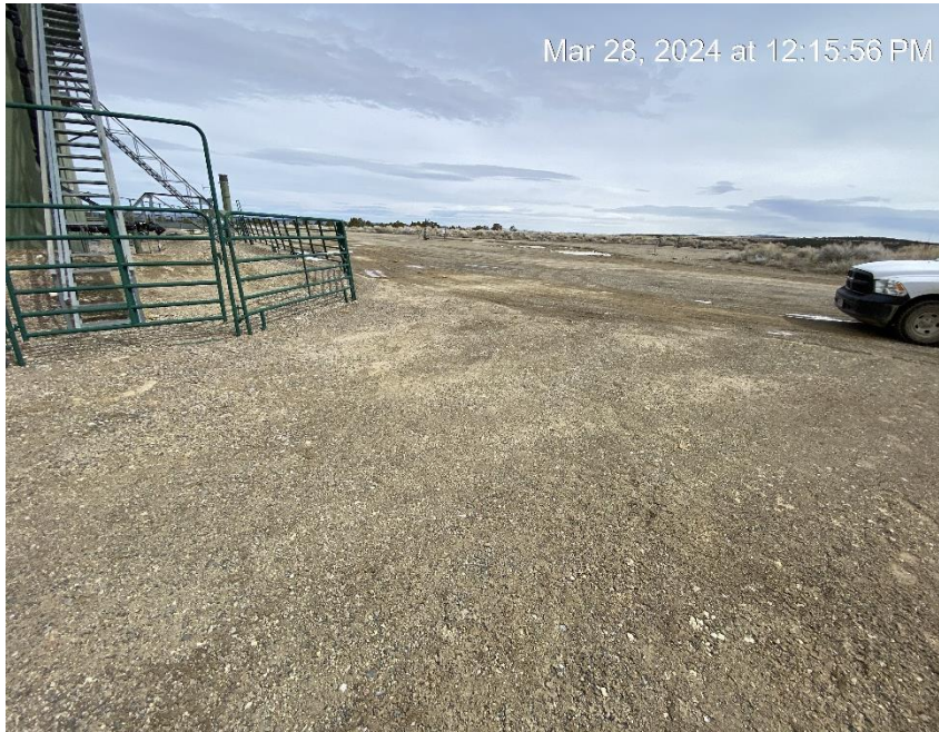
Well pad from Northwest corner