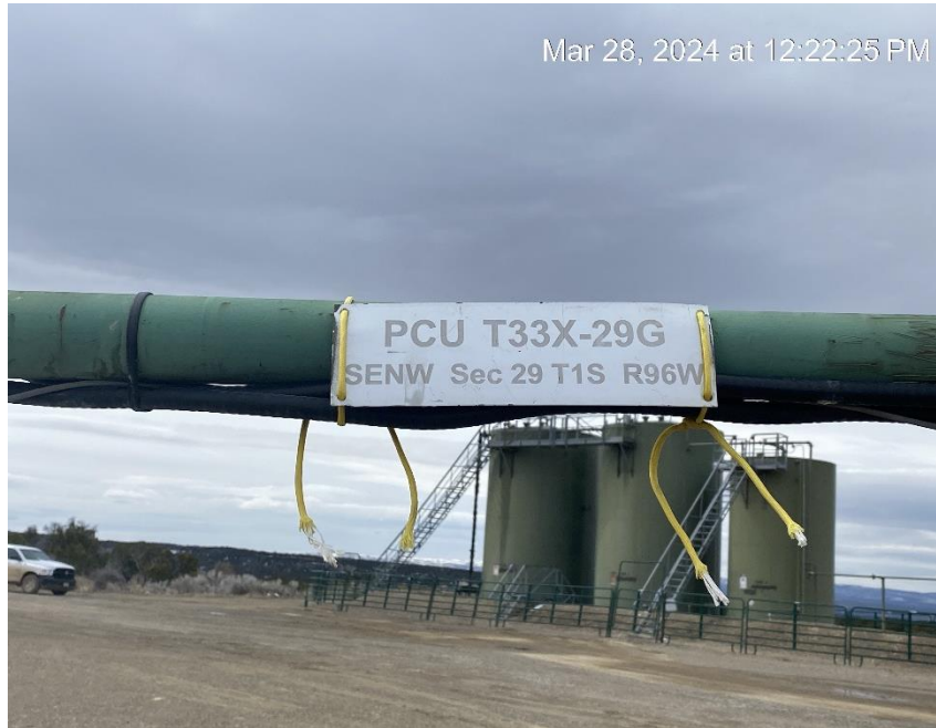
When replaced additional information is required