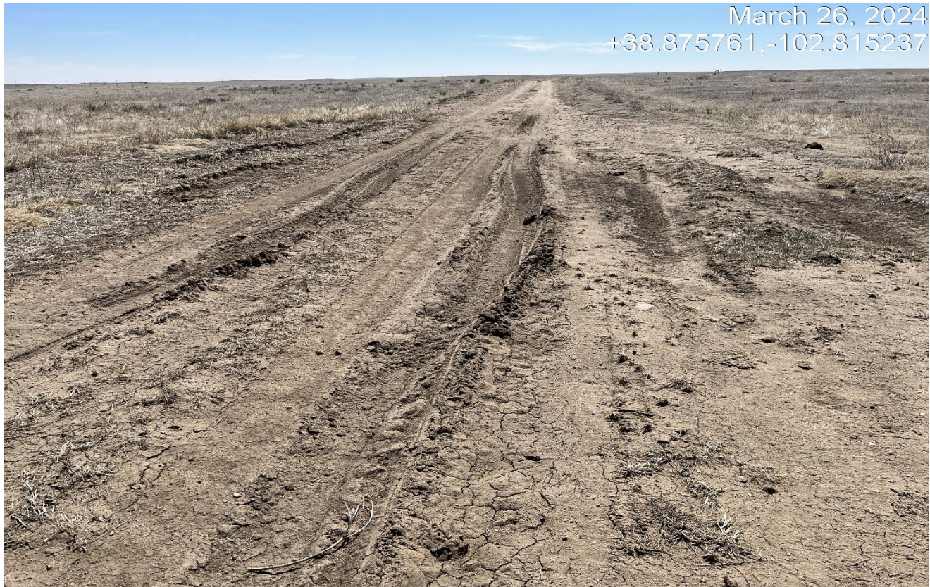
Photo 1. Facing east along the access road. Vehicles are causing unnecessary disturbance driving outside of the access road due to stormwater pooling on the road. The access road must be maintained and shall not drive outside of the access road boundary.