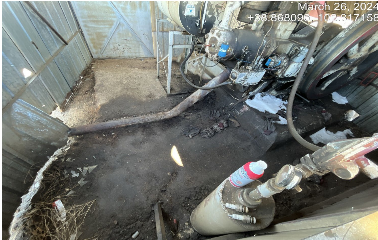
Photo 5. View of inside the shed shows oil saturated soils from the leaking engine.