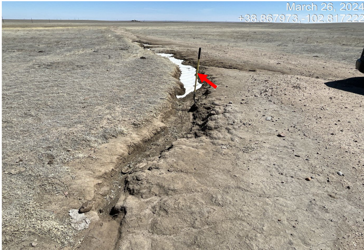
Photo 8. Facing east at the erosion channel occurring along the access road. The red arrow points to a 4.5 ft. shovel for scale.