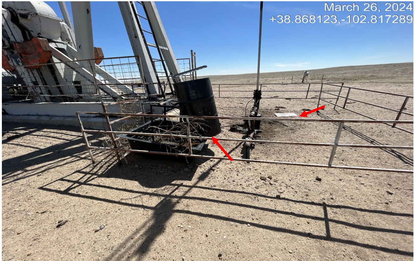
Photo 6. Facing toward the wellhead. The well sign is laying on the ground. The barrel is not properly set in the containment.