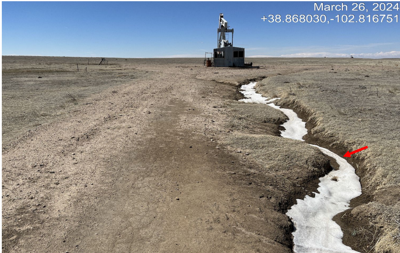
Photo 3. Facing west along the road toward the wellsite. There is an erosion channel coming from the wellsite along the road that will need to be repaired and stabilized.