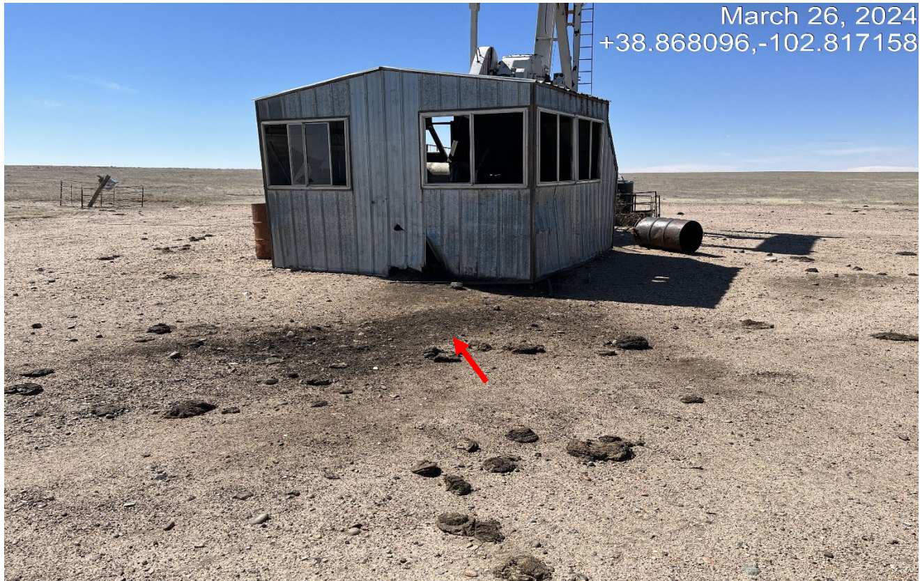
Photo 4. There is stained soils from a leak occurring from the pumpjack engine.