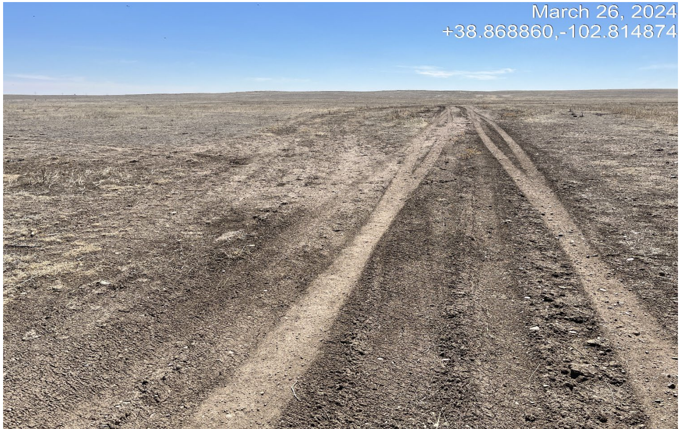
Photo 2. Facing east along the access road. Vehicles are causing unnecessary disturbance driving outside of the access road due to stormwater pooling on the road. The access road must be maintained and shall not drive outside of the access road boundary.