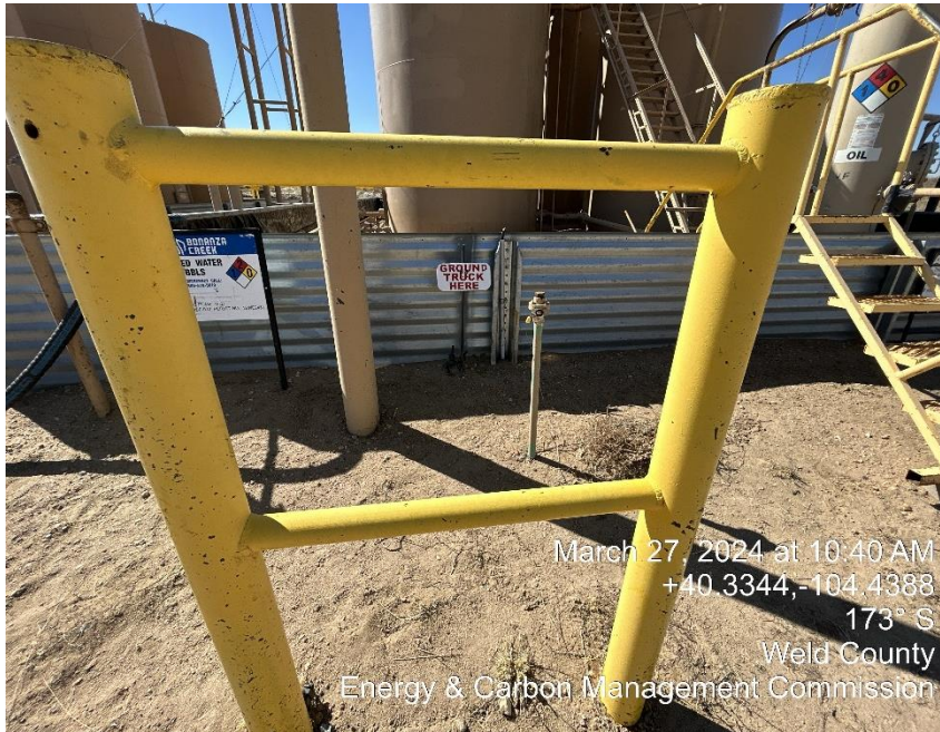
Missing OOSLAT Tag