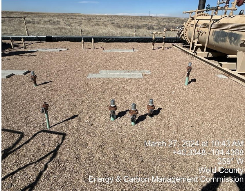
Missing OOSLAT Tags