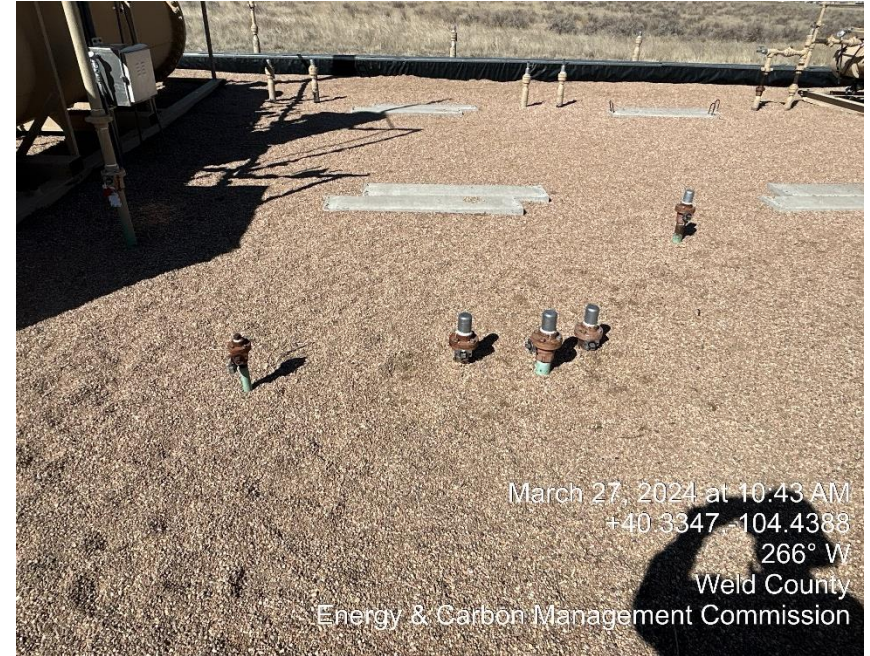
Missing OOSLAT Tags