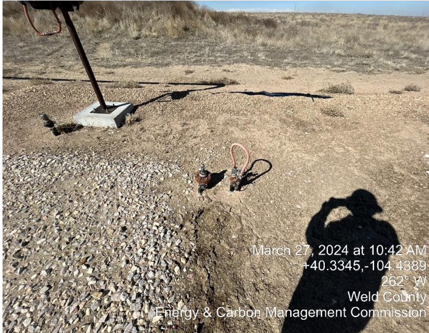
Missing OOSLAT Tag