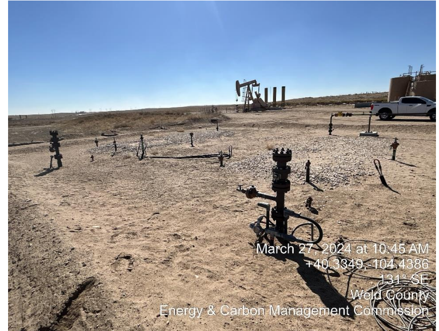
Missing OOSLAT Tags