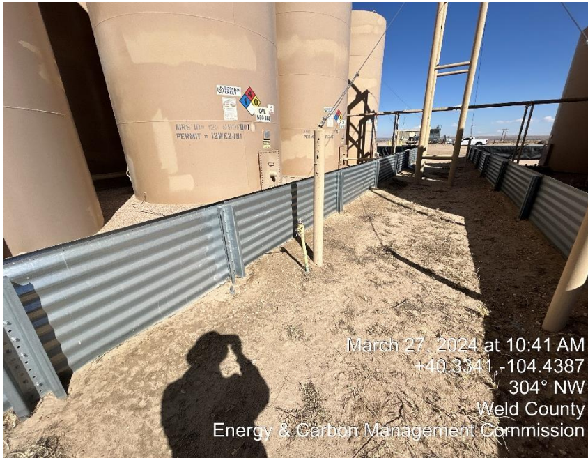
Missing OOSLAT Tag