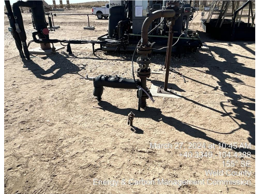
Missing OOSLAT Tag