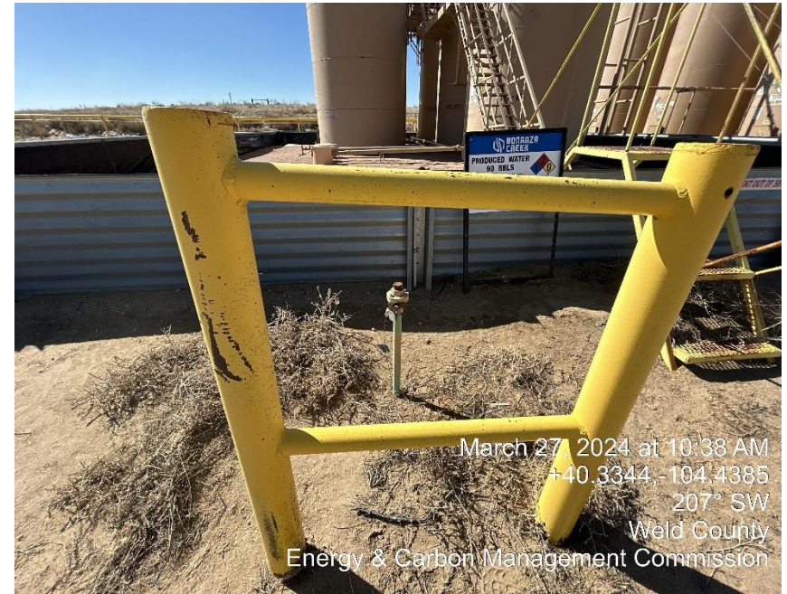
Missing OOSLAT Tag