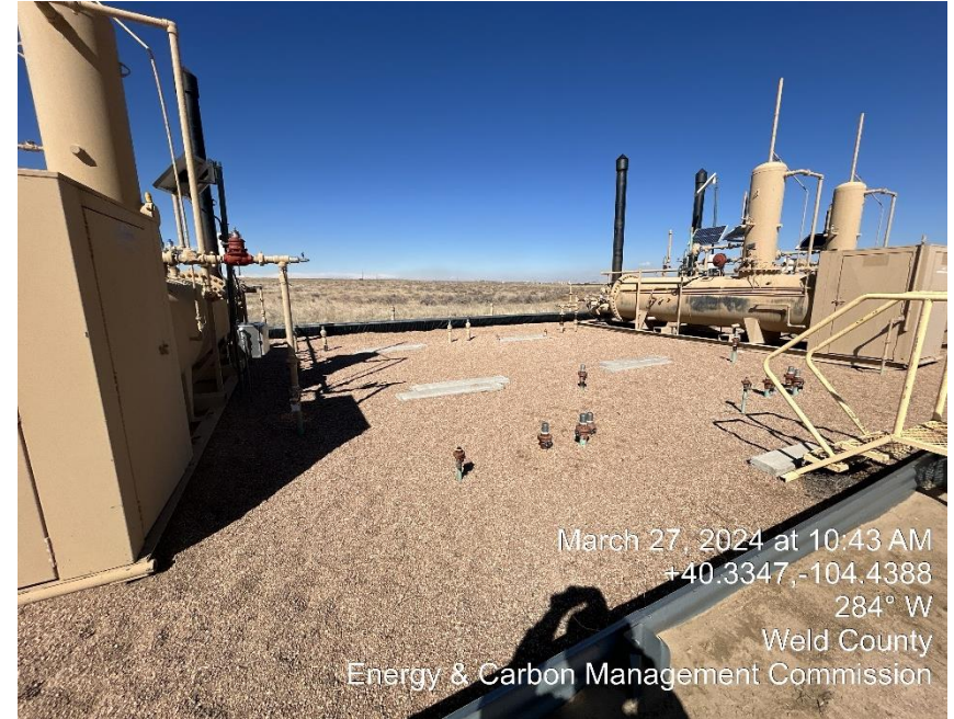
Missing OOSLAT Tags