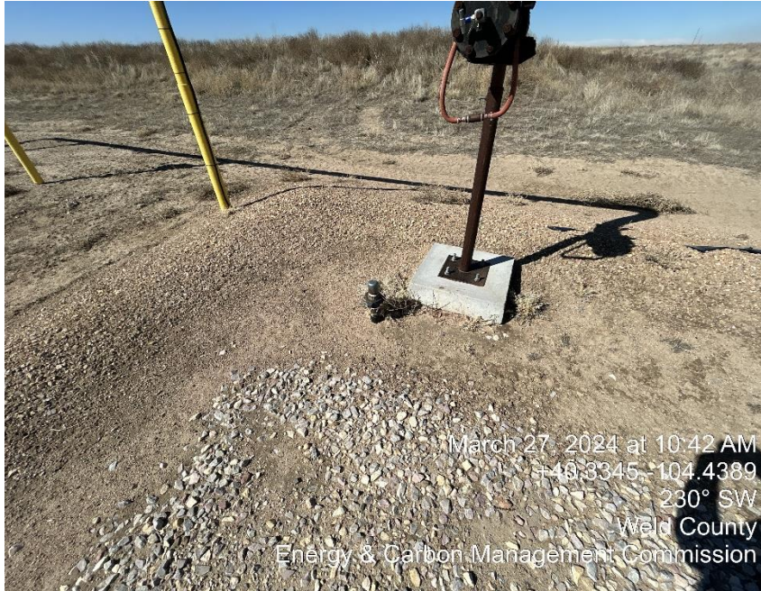
Missing OOSLAT Tag