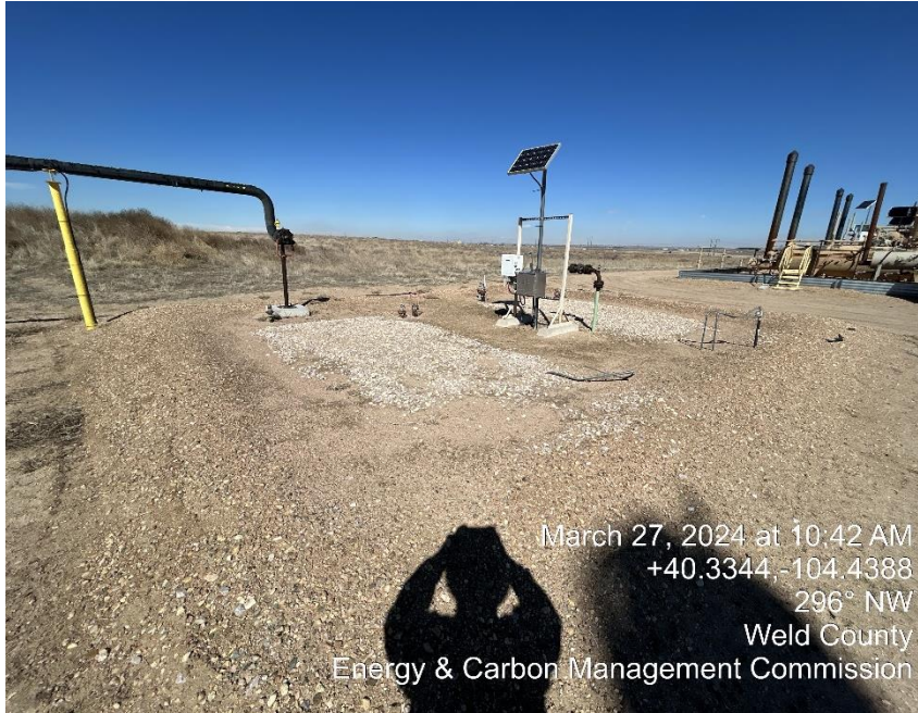
Missing OOSLAT Tags