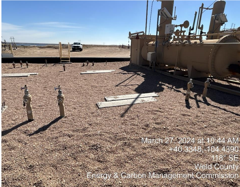
Missing OOSLAT Tags