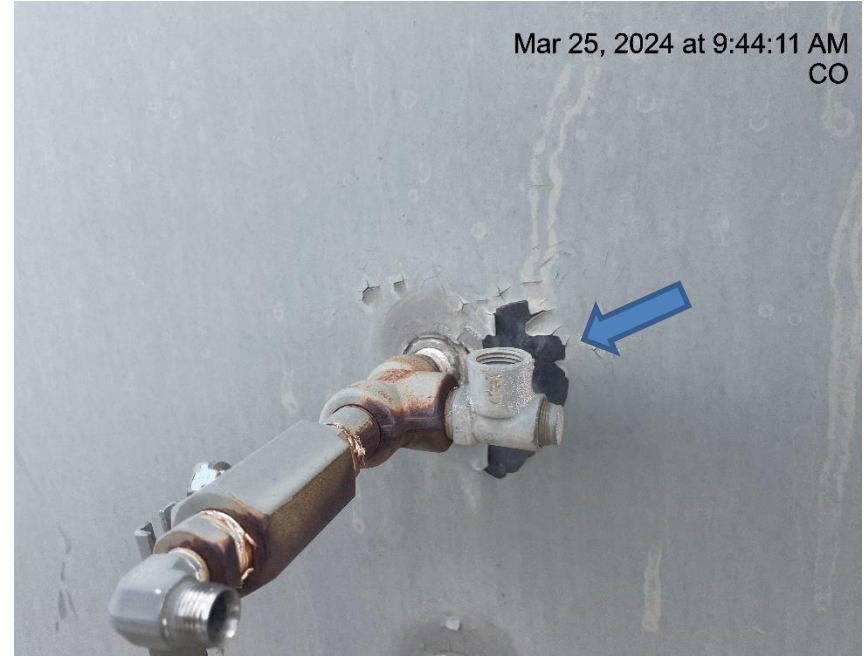
Photo # 1086 PRV does not comply with CECMC pressure safety device rules