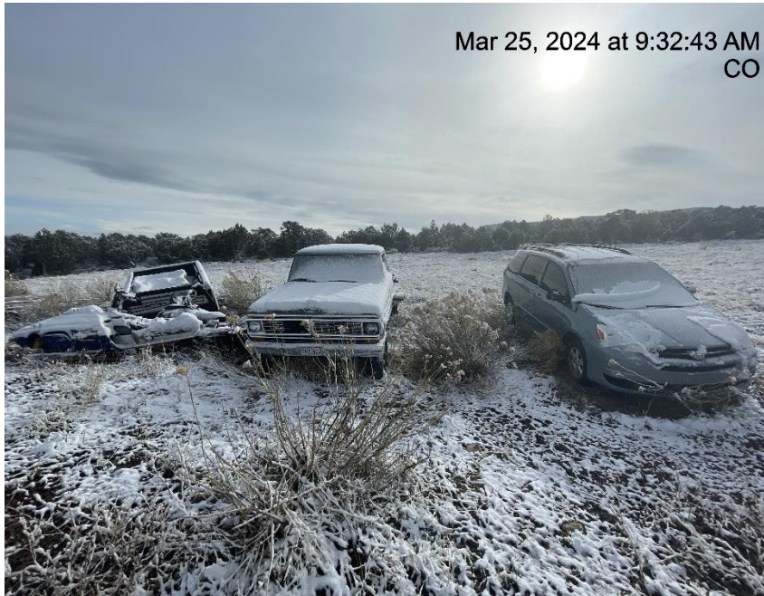
Photo # 1089 Stored vehicles in the interim area & partially in ditch/BMP