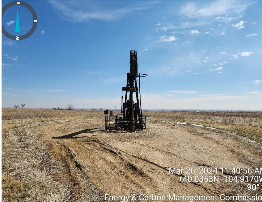
Photo 1 well head and equipment