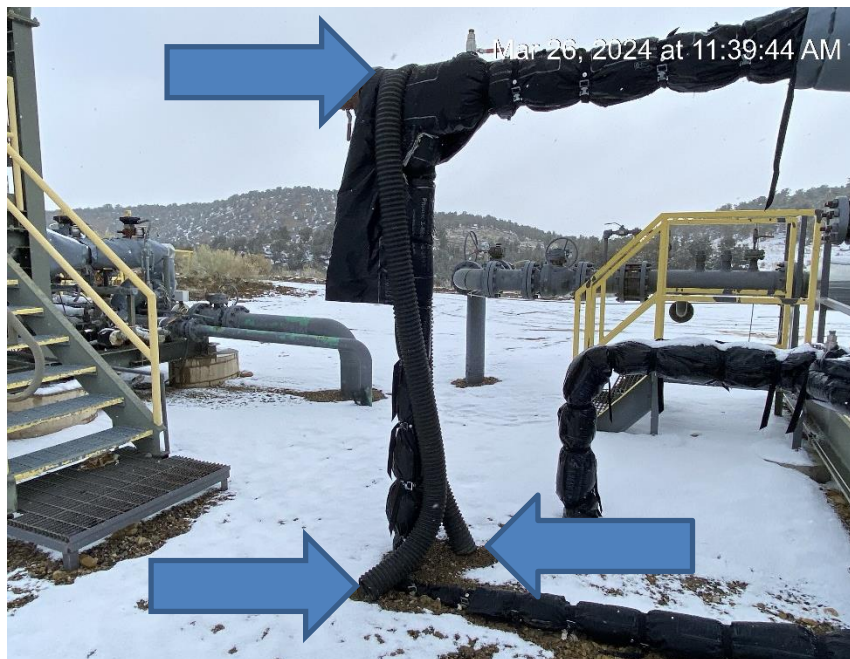
Debris. Hose hanging over flowline.