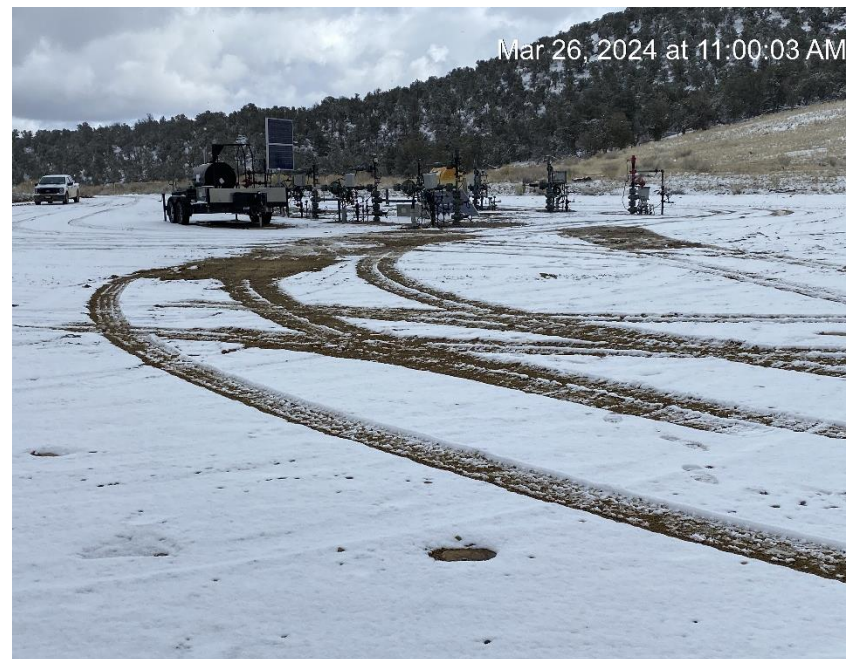
Well pad from Southwest corner