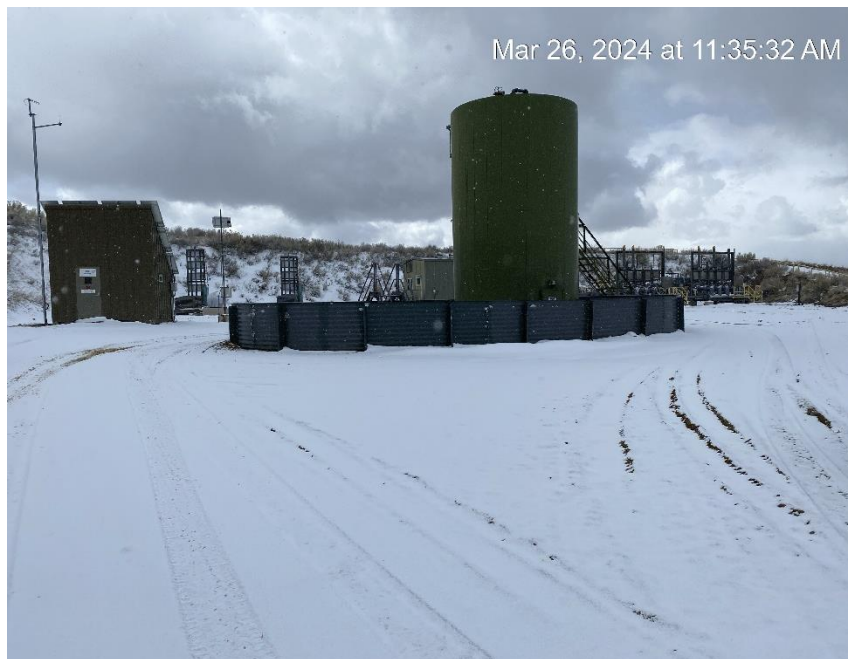
Production facility from Northeast corner