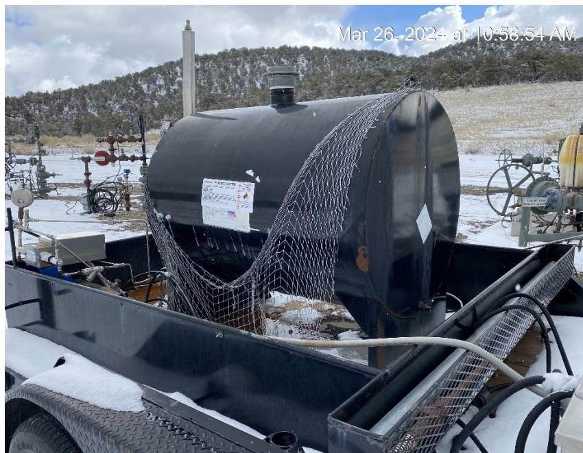
Inadequate wildlife protection