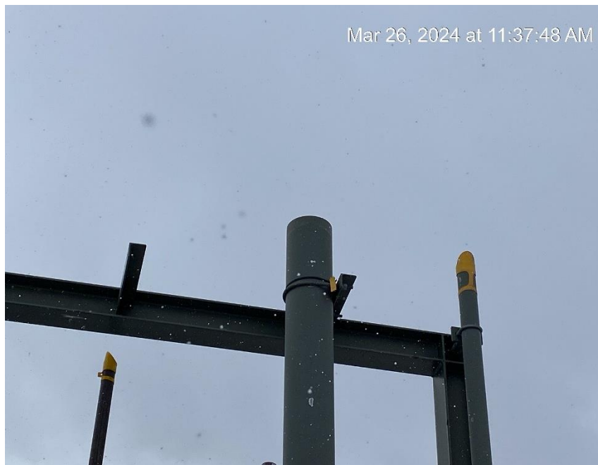
No rain protection