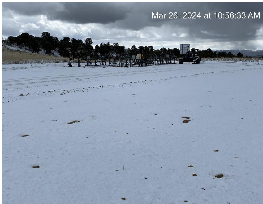
Well pad from Northwest corner