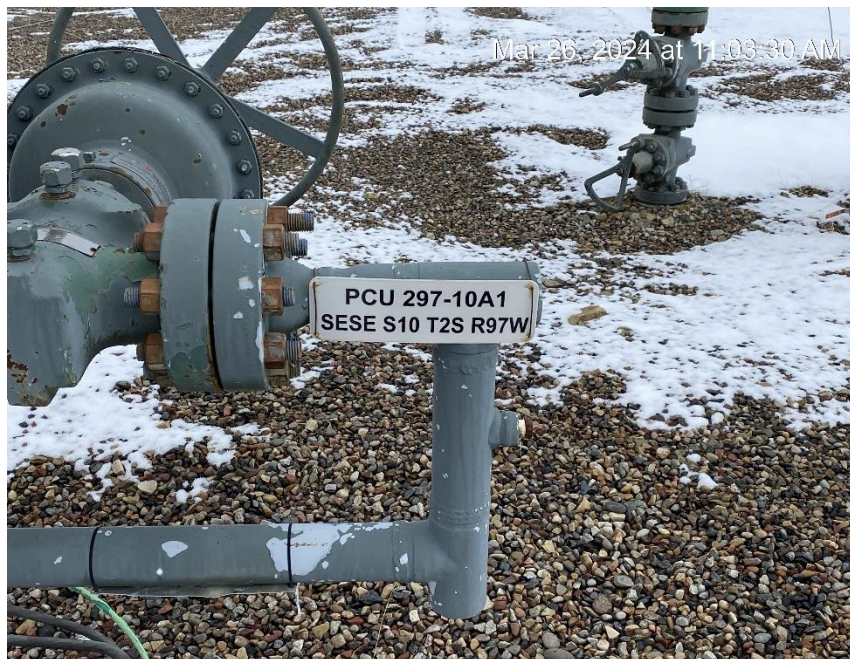
When replaced additional information is required