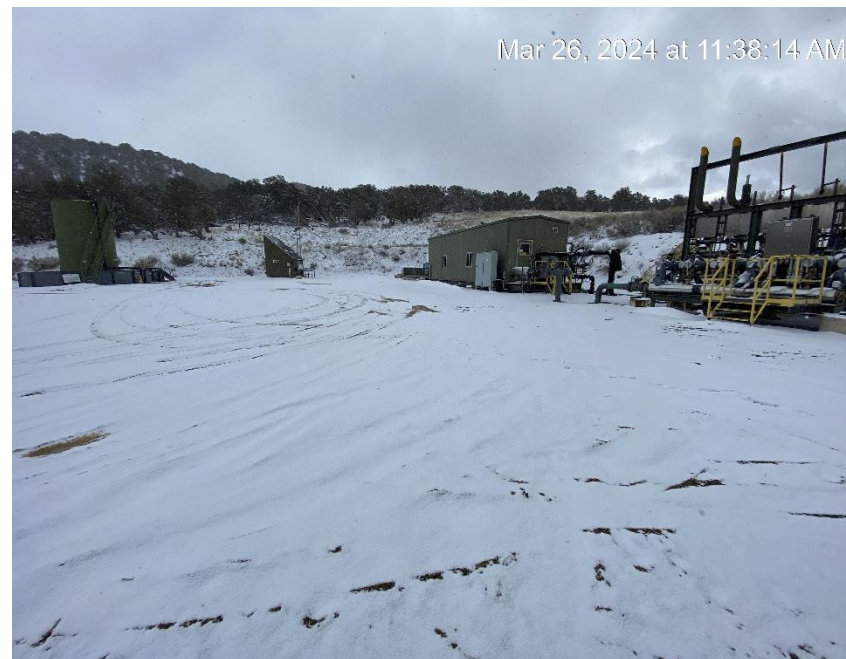
Production facility from Northwest corner