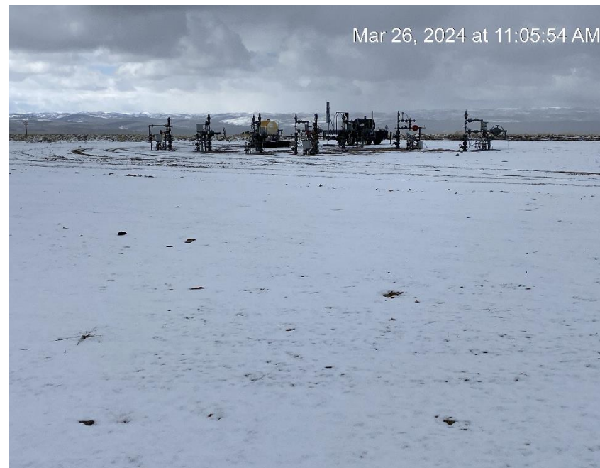
Well pad from Northeast corner