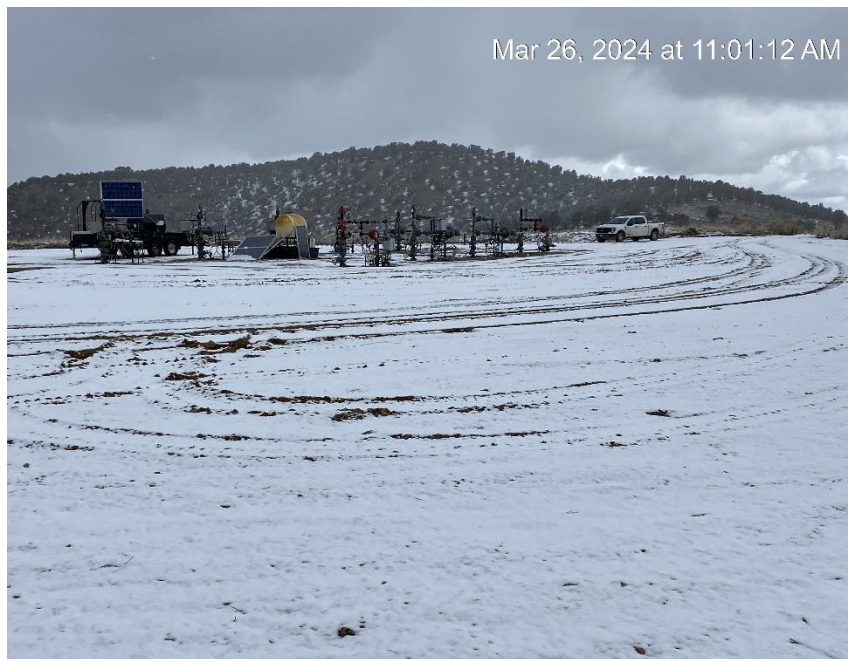
Well pad from Southeast corner