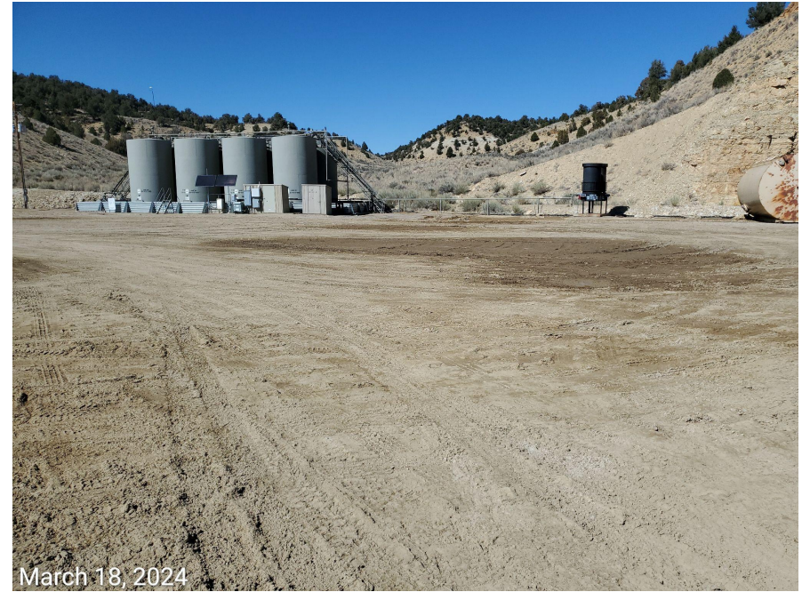
Photo 1: Photos 1-2 taken from the south end of the Location. Photos provide an overview of the Location from west, northwest, northeast to east.