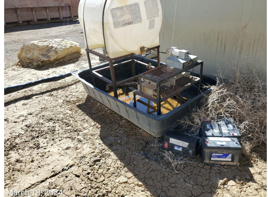
Photo 9: Photo left taken from the 9/6/2023 inspection; photos shows unused tank and batteries improperly stored next to the separator equipment. Photo right dated 3/18/2024 and shows tank and batteries remain improperly stored on the Location.