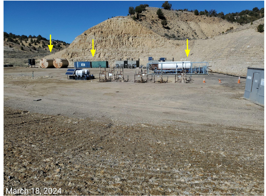
Photo 3: Photos taken from the southeast end of the Location, facing northwest and north. Photos provide an overview of the Location. Photo also shows Location of unused risers associated with Abandoned wells remain on the Location (Yellow circle), as well as unused equipment being stored onsite (arrows).