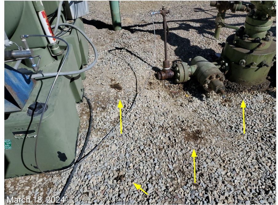
Photo 8: Photos show stained soils at the B-19N-N3 well (API 103-10836)