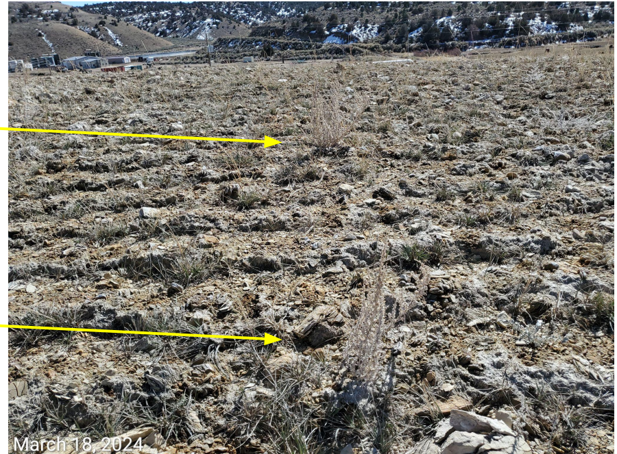
Photo 17: Photo left taken from the 9/6/2023 inspection; photo right shows Noxious weeds (Halogeton) observed during the 9/6/2023 inspection remain, and appear to have matured during the 2023 growing season. Unable to find evidence that weed management activities had been performed on the Location prior to maturation, flowering and seed dispersal; Halogeton evident throughout the entire interim area. Additional and ongoing weed management efforts required.