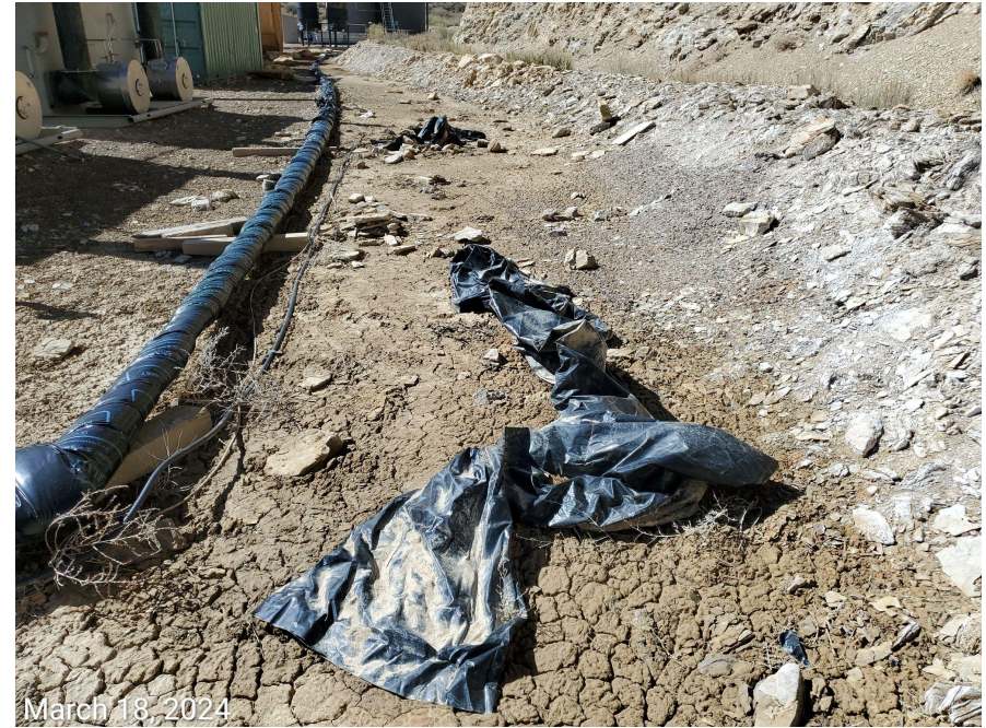
Photo 10: Photos examples of additional trash/debris observed behind the separator equipment.