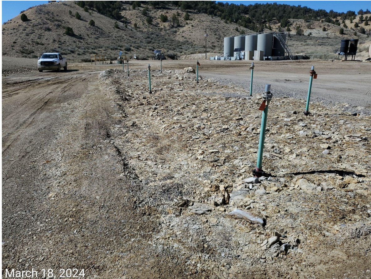
Photo 4: Photo shows riser equipment. Riser equipment is associated with Abandoned, undrilled wells, are unused, not necessary for production, and require removal.