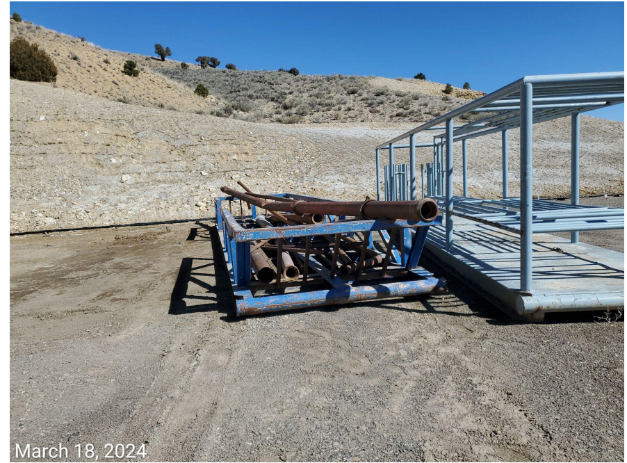
Photo 11: Photos 11-13 examples showing various equipment not necessary for production being stored on the Location.