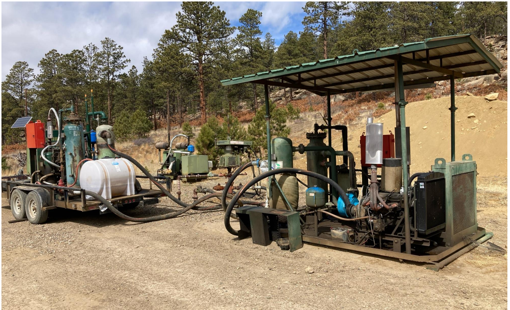
PHOTO 3: UNUSED EQUIPMENT (SKID MOUNTED COMPRESSOR IS NOT IN USE). REMOVE UNUSED EQUIPMENT PER RULE 606. CA DATE 4-26-24.