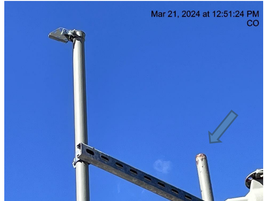
Photo # 983 PRV vent line lacks cap/does not comply with CECMC pressure safety device rules