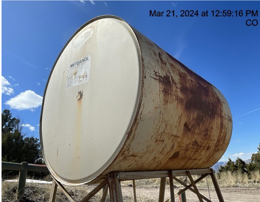
Photo # 987 Methanol tank improperly labeled/lacks required information