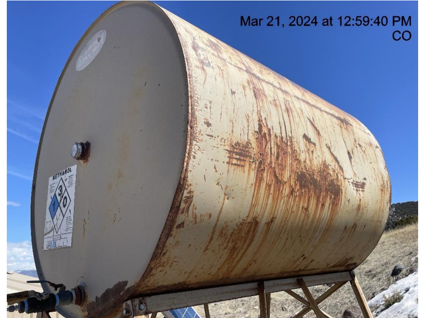
Photo # 988 Methanol tank improperly labeled/lacks required information