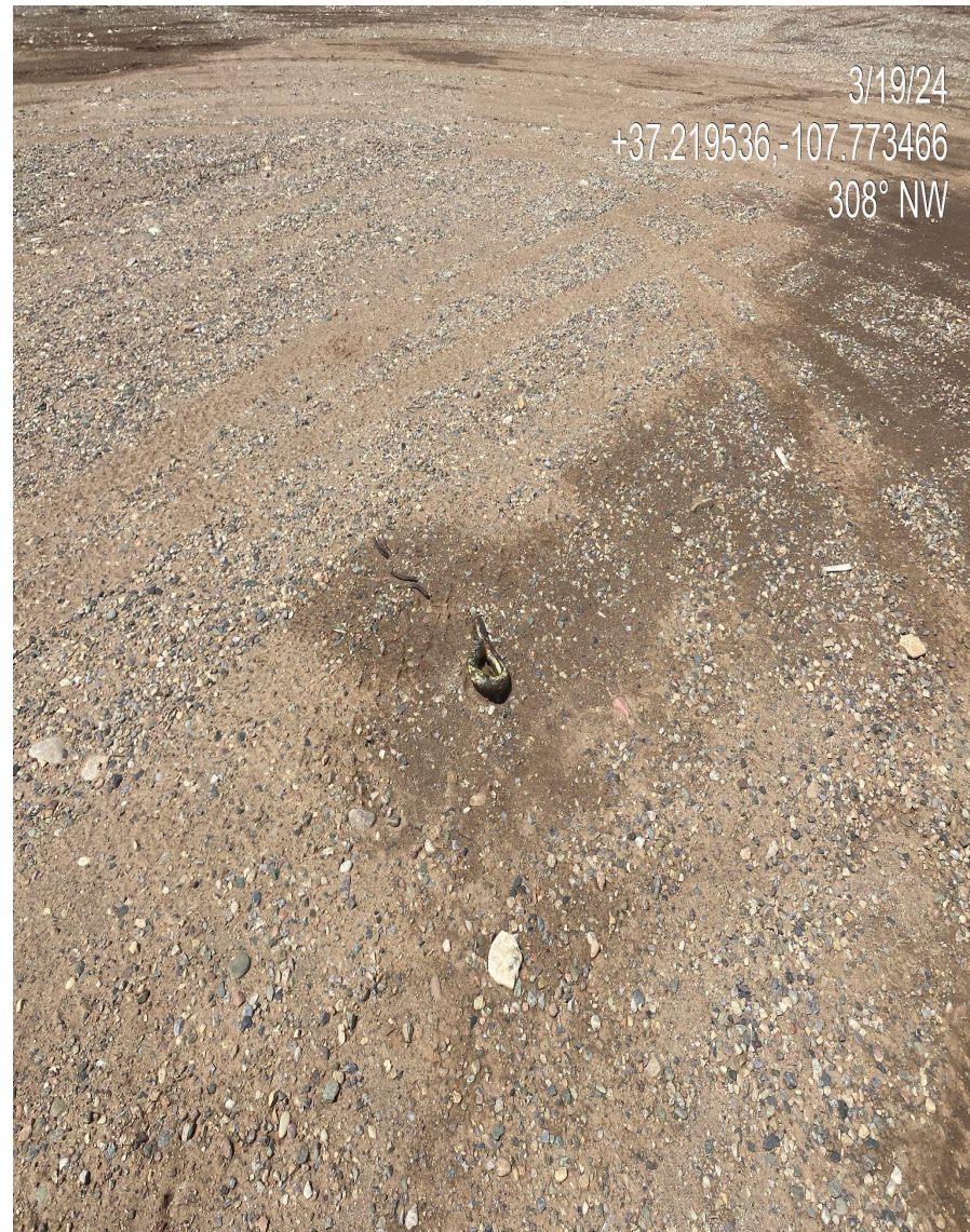
Photo 4. 2 unmarked guy line anchors observed on location.