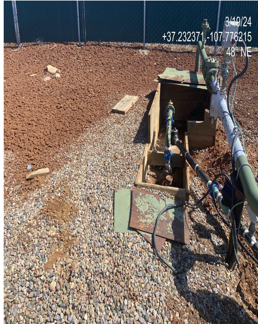
Photo 4. View of unused piping and panels observed on location.