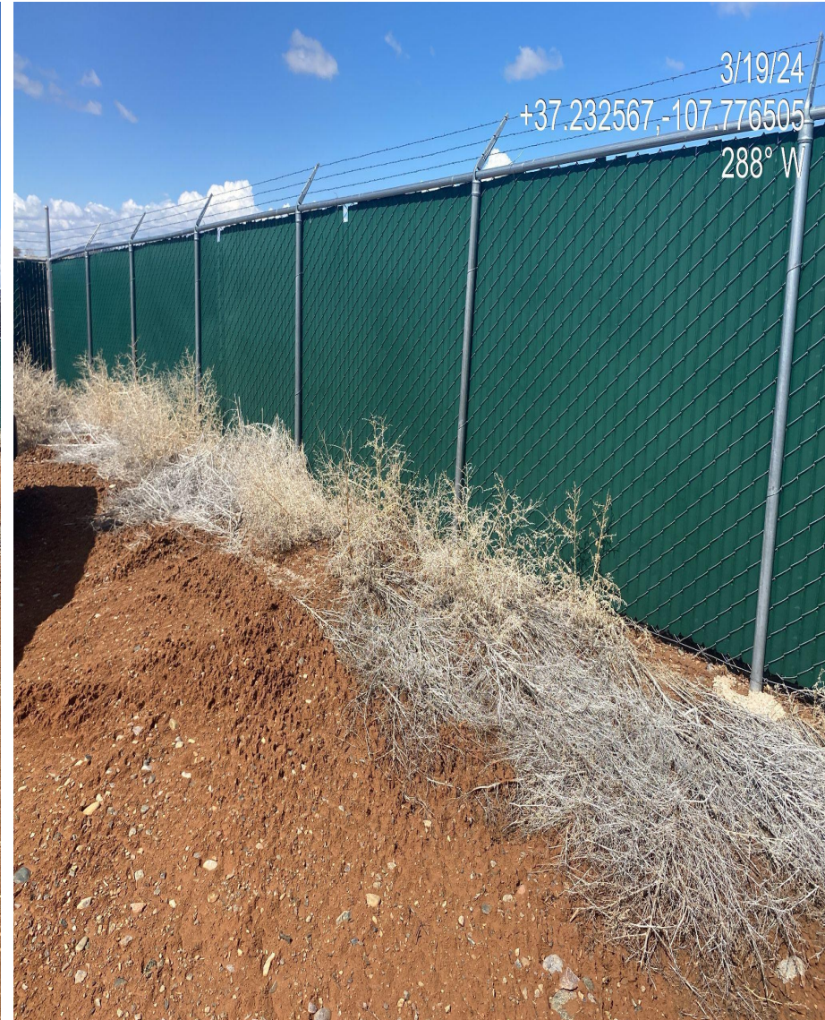
Photo 3. View of weedy kochia debris piling up along the western and northern fence line.