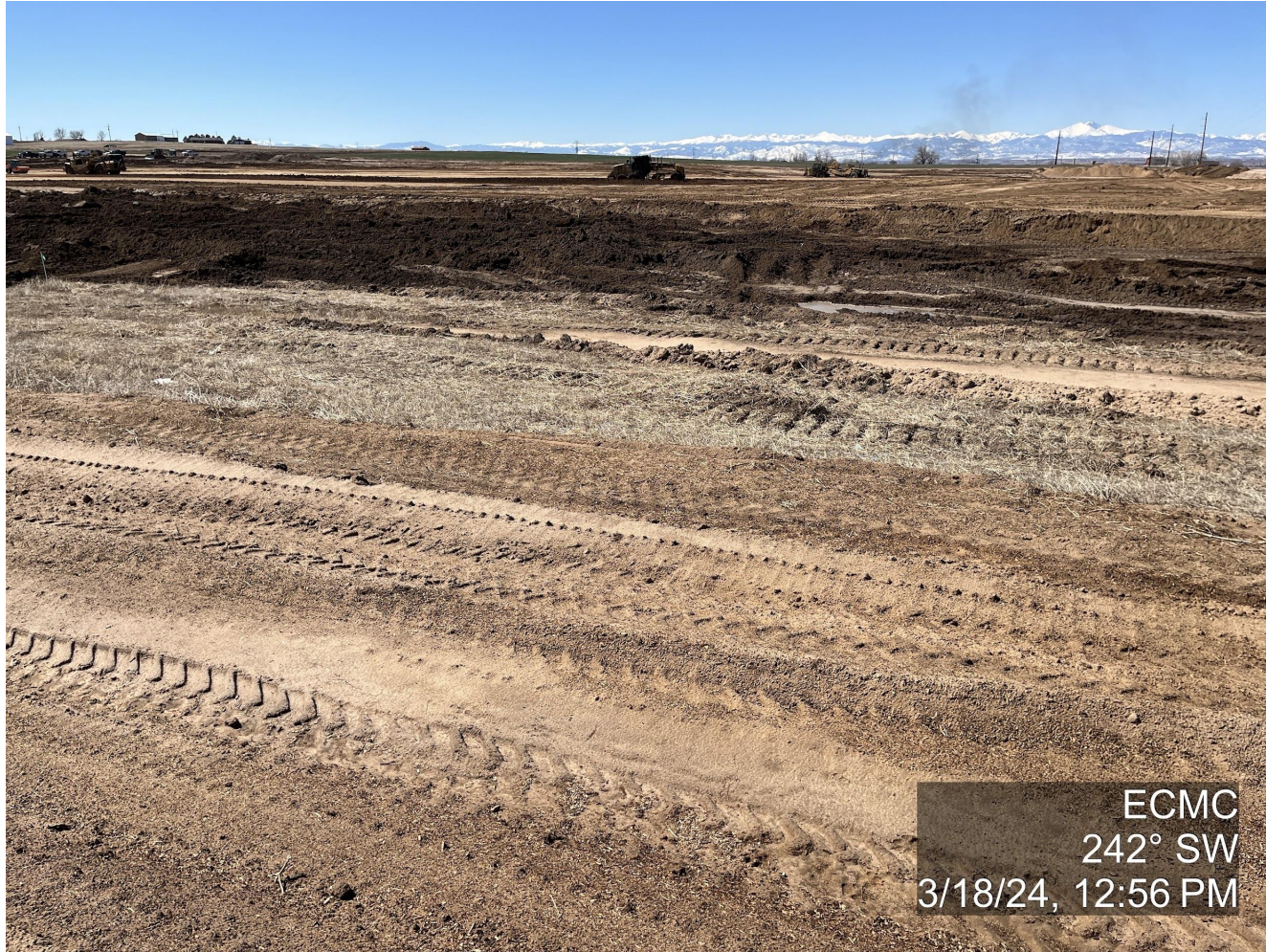
Photo 1. The photo was taken at the well location facing Southwest. The photo illustrates the disturbance area of the original plugged and abandoned well is now within the boundaries of the currently in construction Well Location ID 484682.