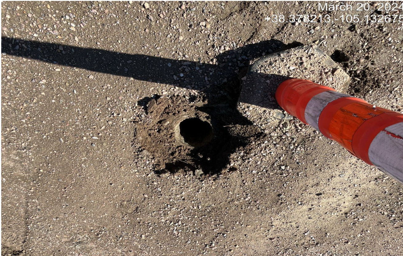
Photo 3. There is a well casing and deep wellbore which the safety cone is covering the well but is not secure. A proper steel cap should be placed and secured on the open wellbore.