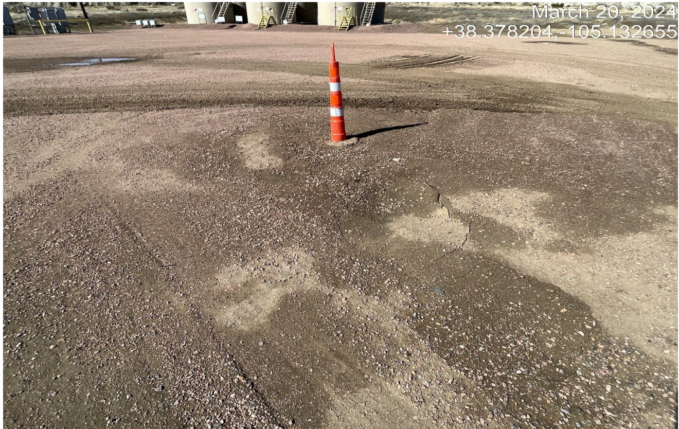
Photo 2. Facing back east at the location. There is a plastic bucket covering an open wellbore at red arrow.