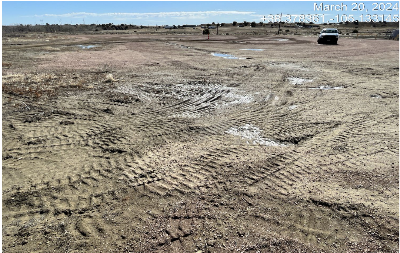
Photo 4. Facing east at the northwest side of the location. The pipe risers and utility appear to have been removed. All unused areas of the location must be reclaimed.