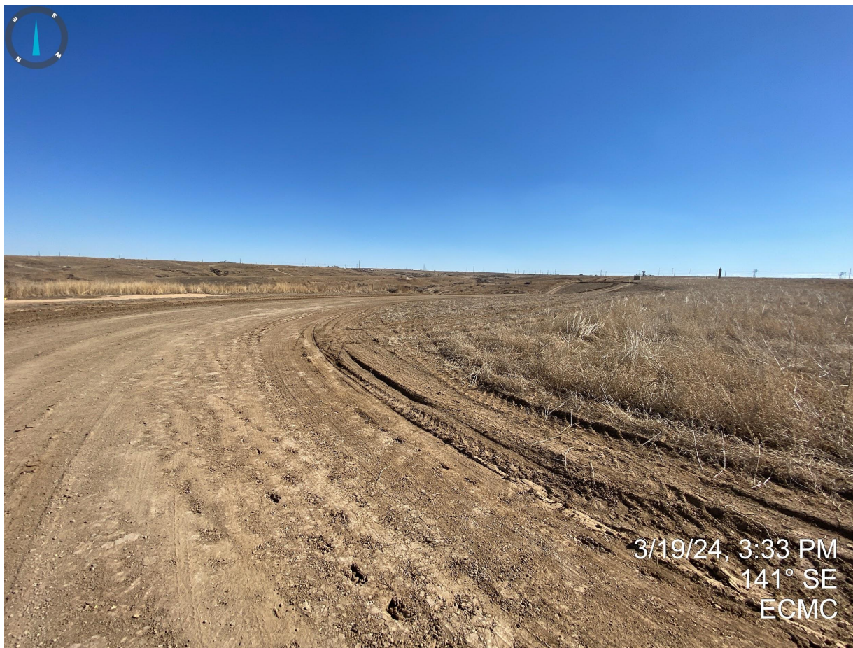
Photo 4. Facing southeast; Taken near the end (northern portion) of the newly constructed access road. See comments in Photo 1.