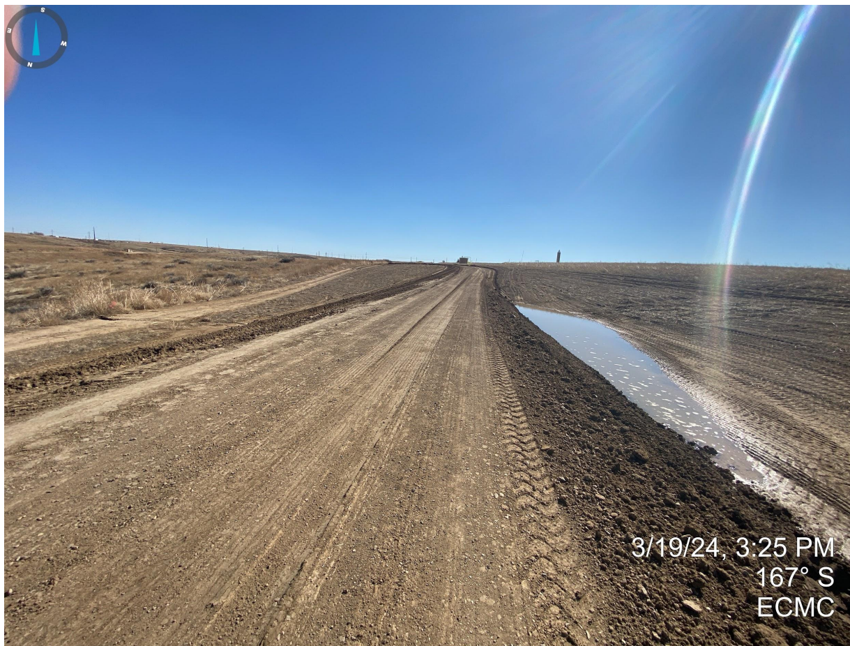
Photo 2. Taken from the center portion of the newly constructed access road. The road appears to have been graded/leveled with fill material and plated with road armor. See comments in Photo 1.