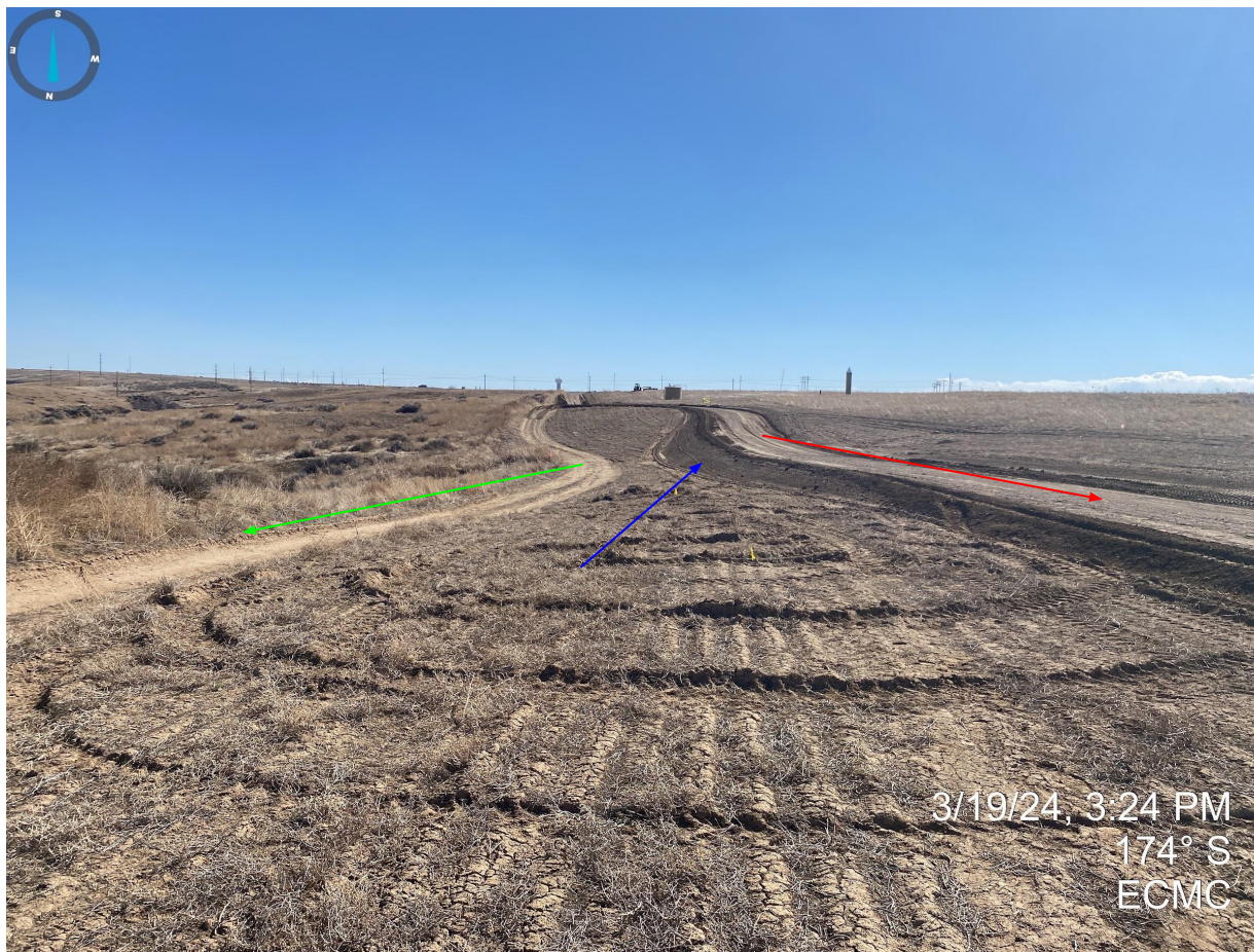
Photo 3. Facing south from the middle portion of the newly constructed access road. See comments in Photo 1. Also pictured, blue arrow indicates fill material used to construct the new access road.