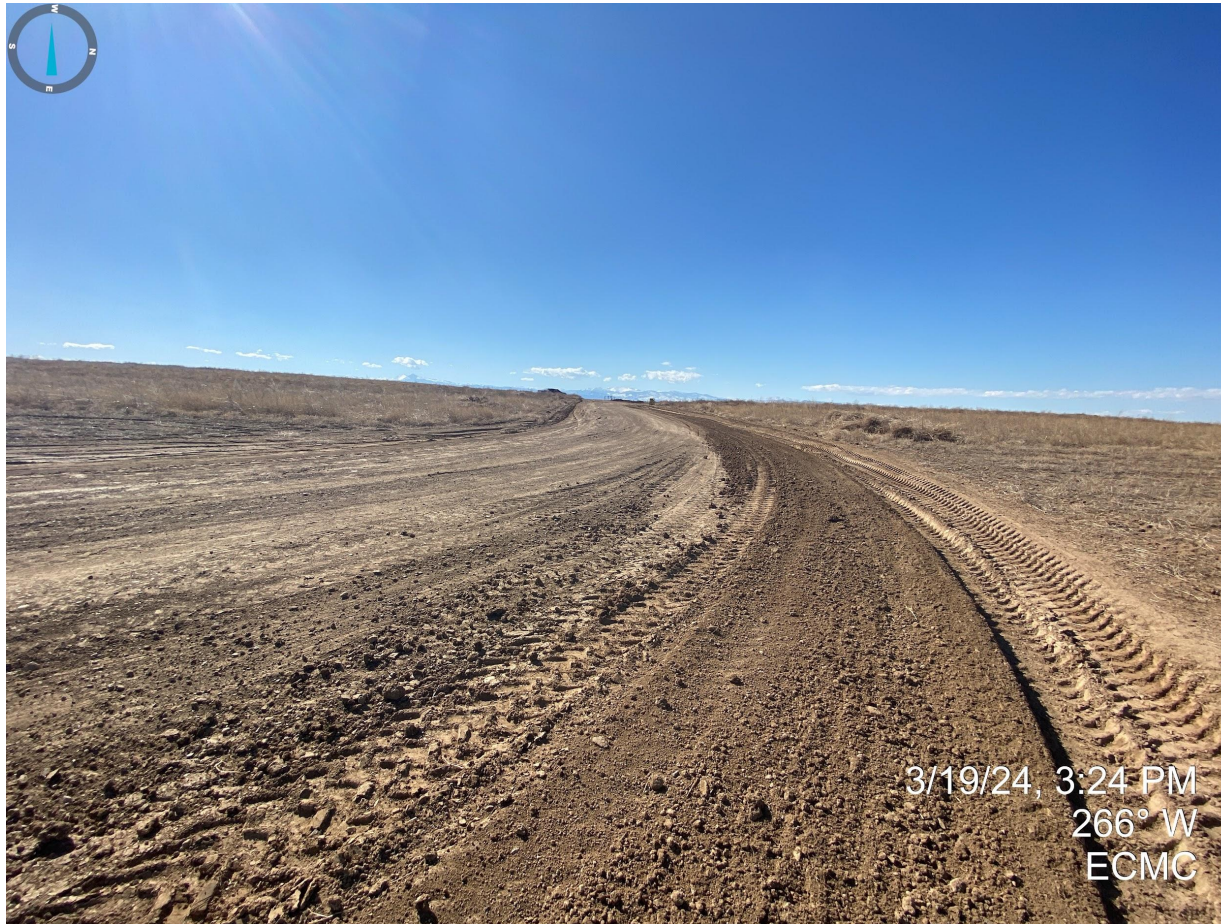
Photo 5. Facing west; Taken near the end (northern portion) of the newly constructed access road. See comments in Photo 1. Construction activities had not occurred at the proposed location (wells and production facilities) at the time of this inspection. No location signage or a copy of the approved Form 2A were posted on location.