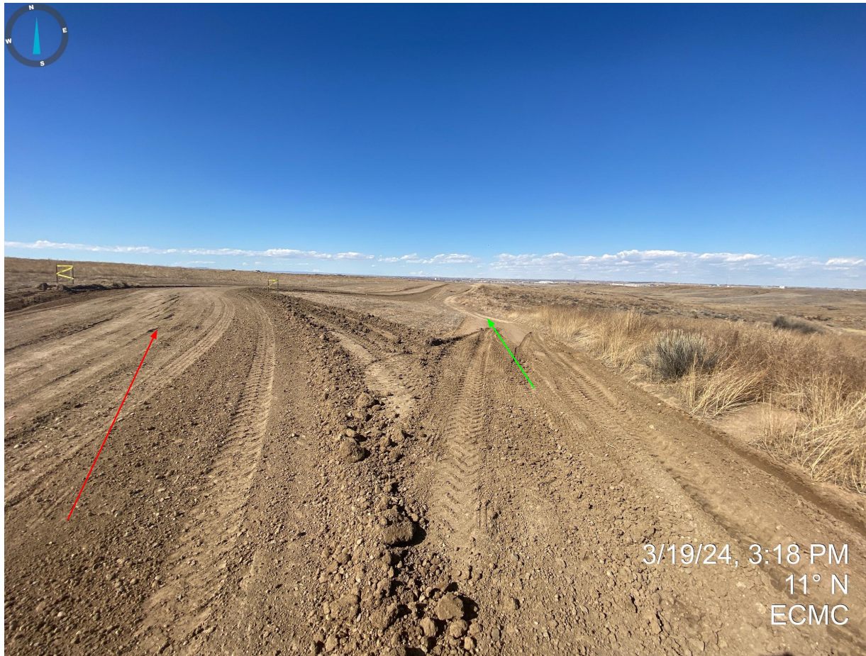
Photo 1. Taken from the start (southern portion) of the proposed new permanent access road to the Schmerge 9-4HZ location. Red line indicates the newly constructed access road and the green line indicates an existing access road. During this inspection, Staff did not observe any topsoil stockpiles that indicated topsoil was salvaged from the access road.