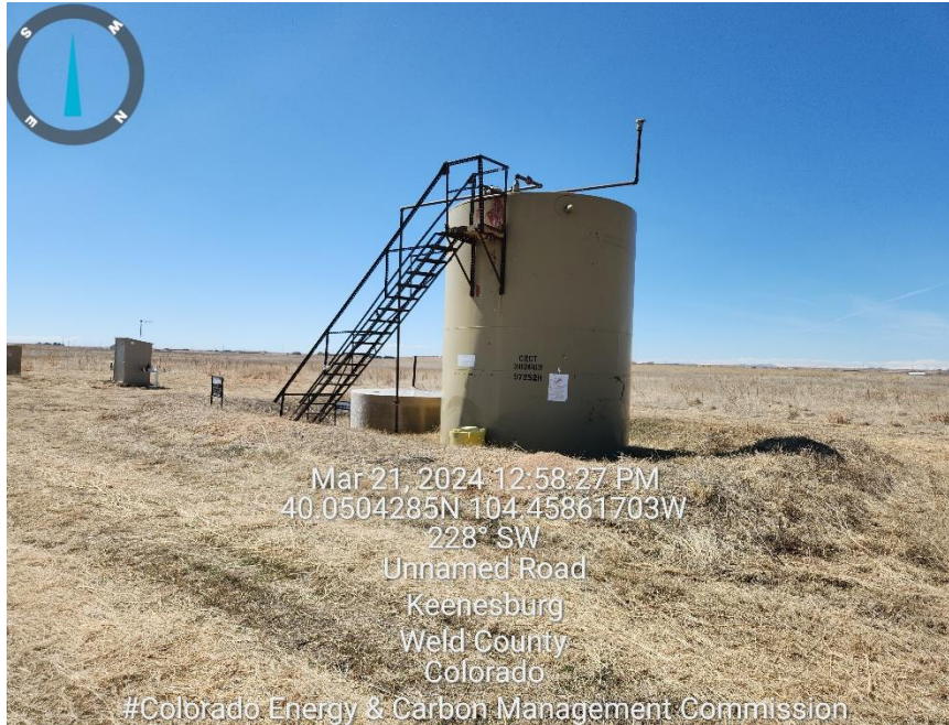
Photo 7 Oil tank has no placards or volume signs