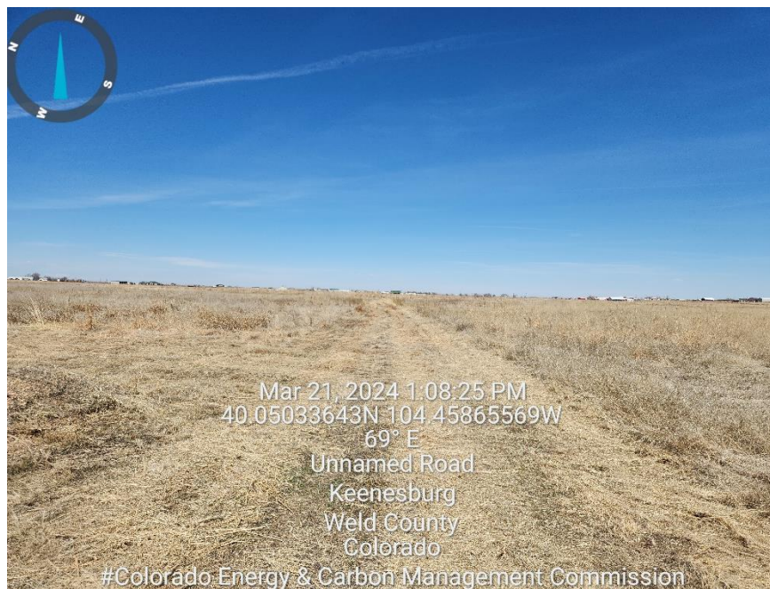
Photo 11 access road mowed not maintained