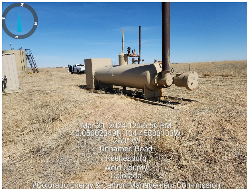
Photo 5 Dead vegetation around equipment