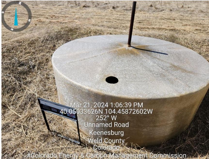
Photo 9 Wildlife protection hole in produced water tank