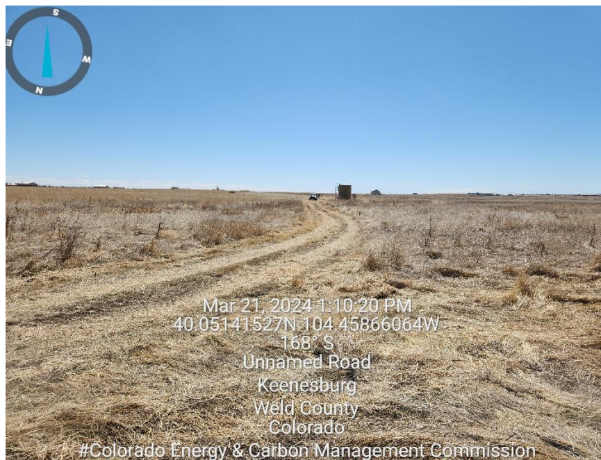
Photo 13 Access road mowed not maintained