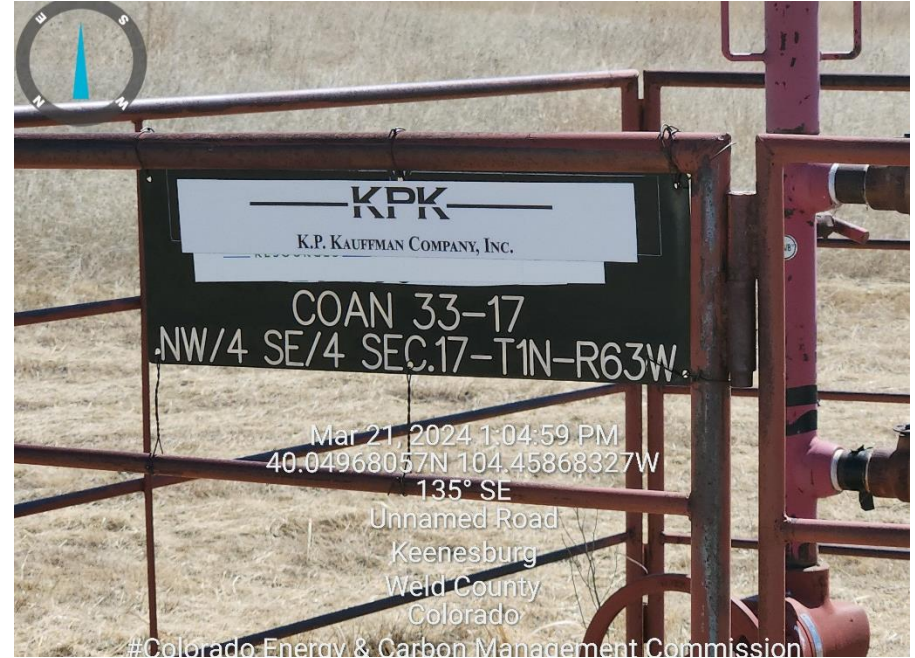
Photo 8 well head sign has not been replaced with correct well number