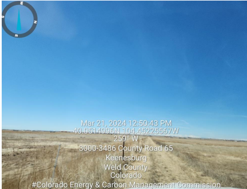
Photo 1 Access road mowed not maintained