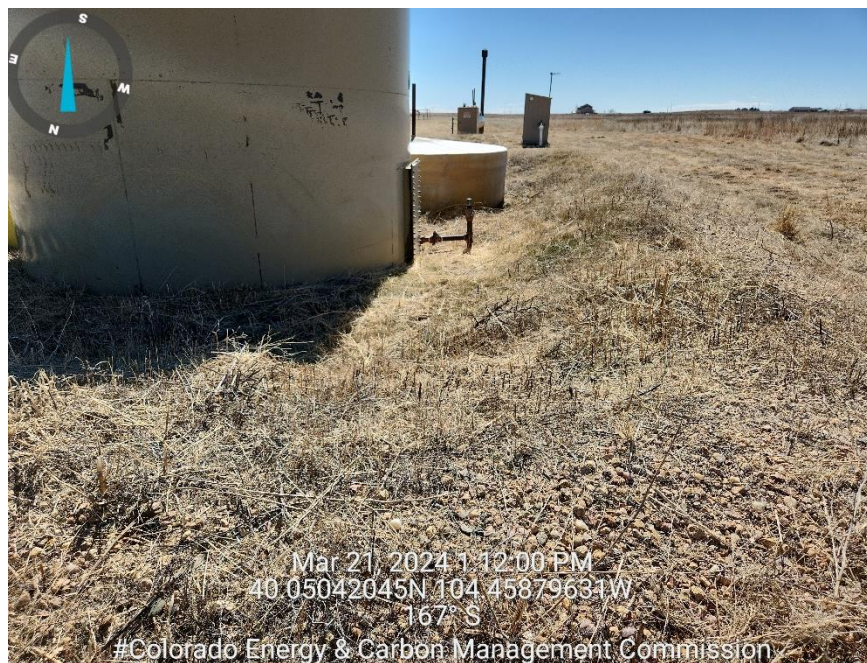
Photo 15 Dead vegetation in secondary containment