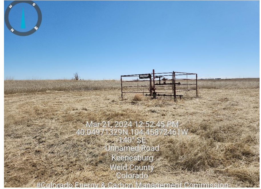
Photo2 Well head Dead vegetation around well head