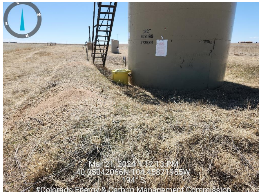
Photo 16 Dead vegetation in secondary containment