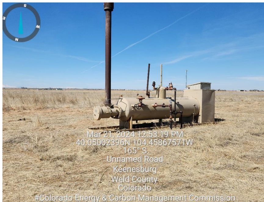
Photo 3 Heater stack installed Dead vegetation around separator