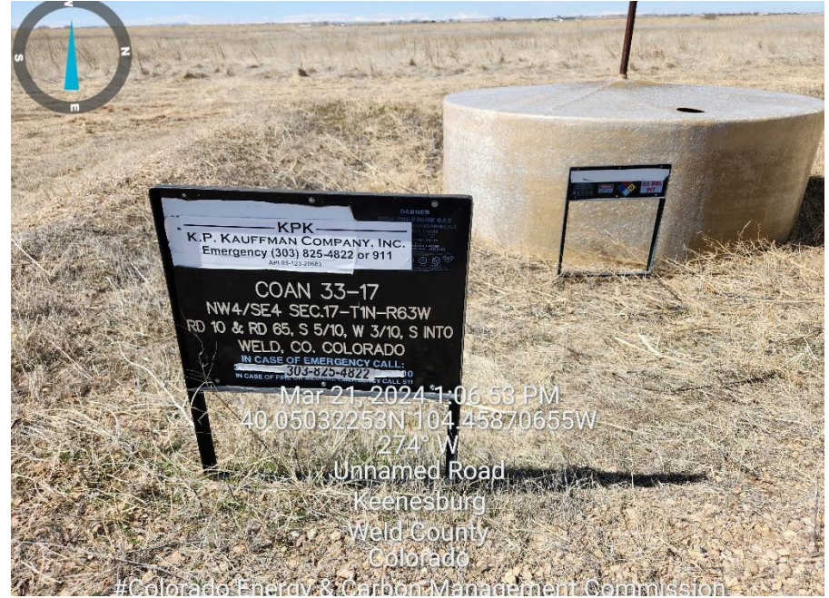
Photo 10 TNK BTRY sign does not reflect correct well number