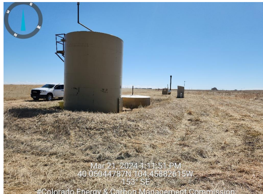
Photo 14 Debris cut down in and around secondary containment but not removed