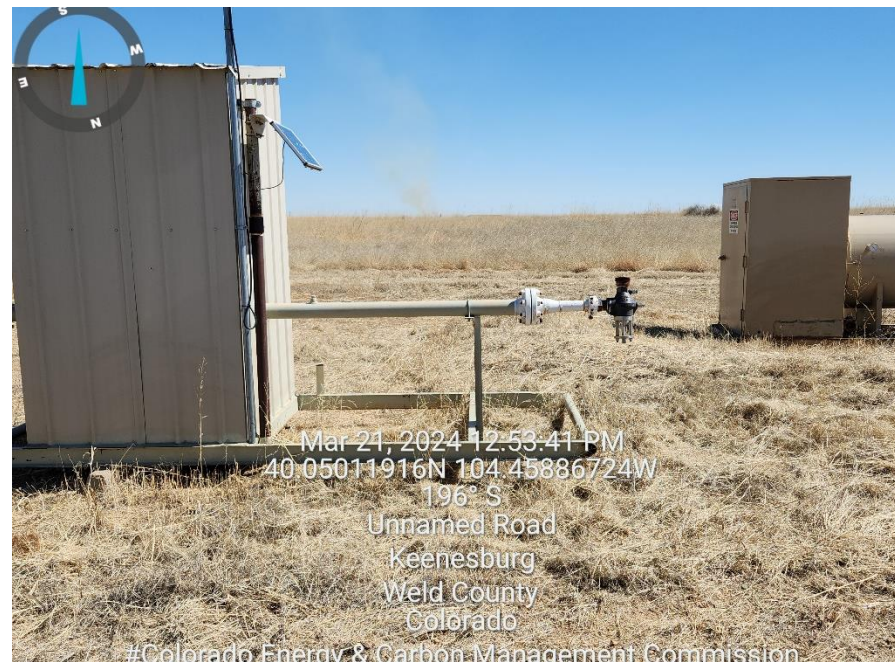
Photo 4 Meter house not connected to sales flow line not operational