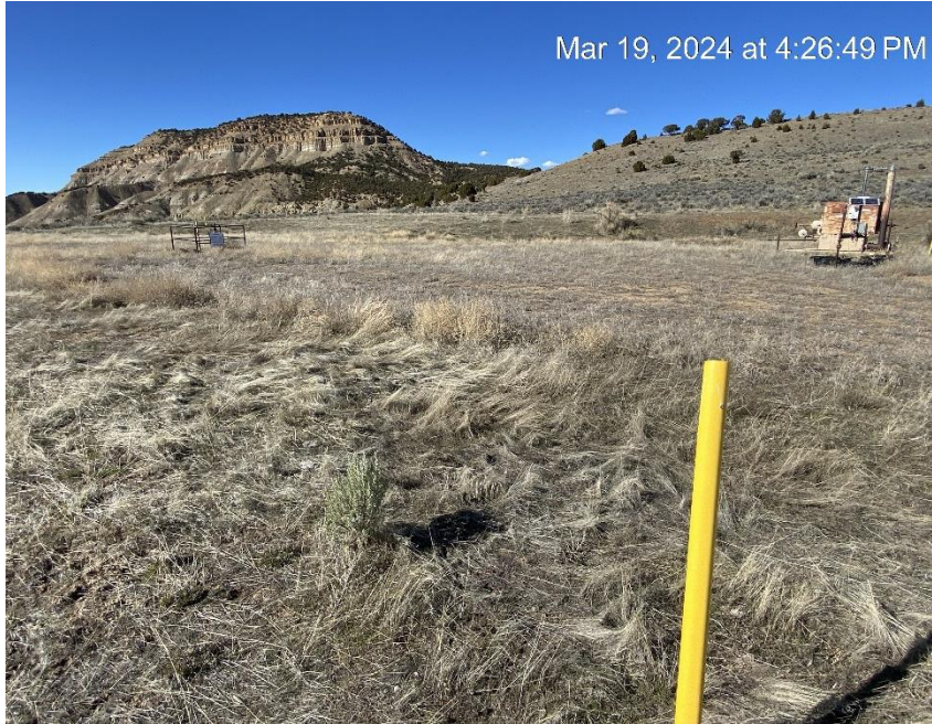
Location from Southeast corner