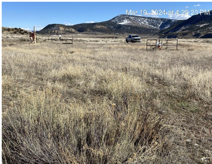
Location from Northwest corner