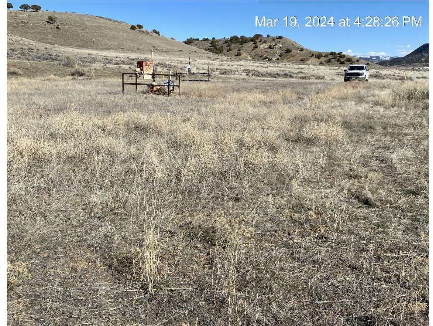
Location from Southwest corner