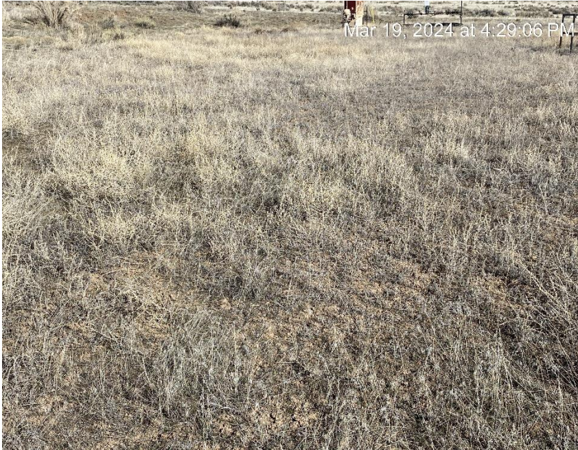
Last year's weeds