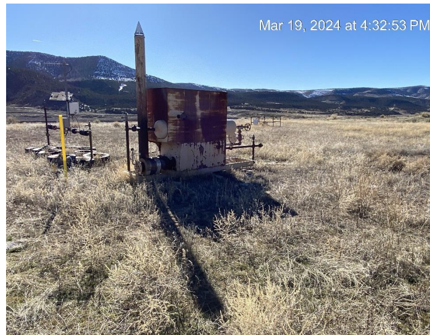
Location from Northeast corner