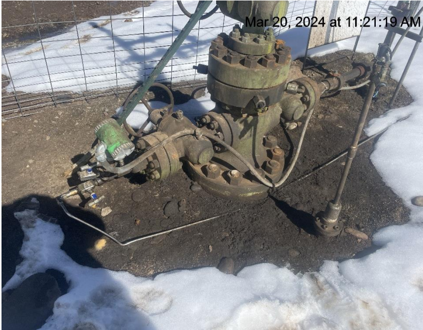
Photo # 612 Stained soils & gravel around S. Leverich 13-16C wellhead