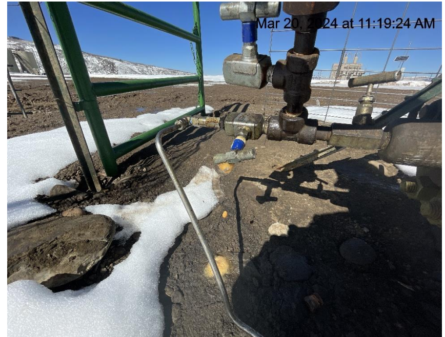
Photo # 611 Mechanical condition/Fluid leaking onto the ground from S. Leverich 13-16C wellhead