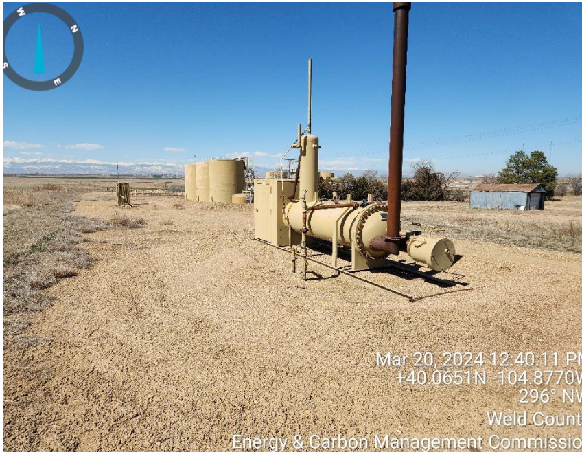
Photo 3 production equipment