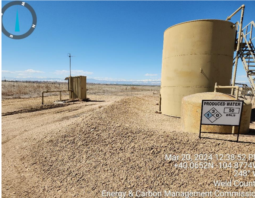
Photo 5 tank battery