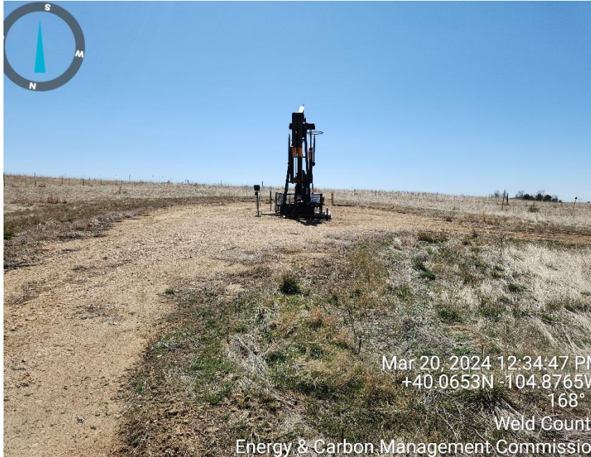
Photo 1 well head and equipment