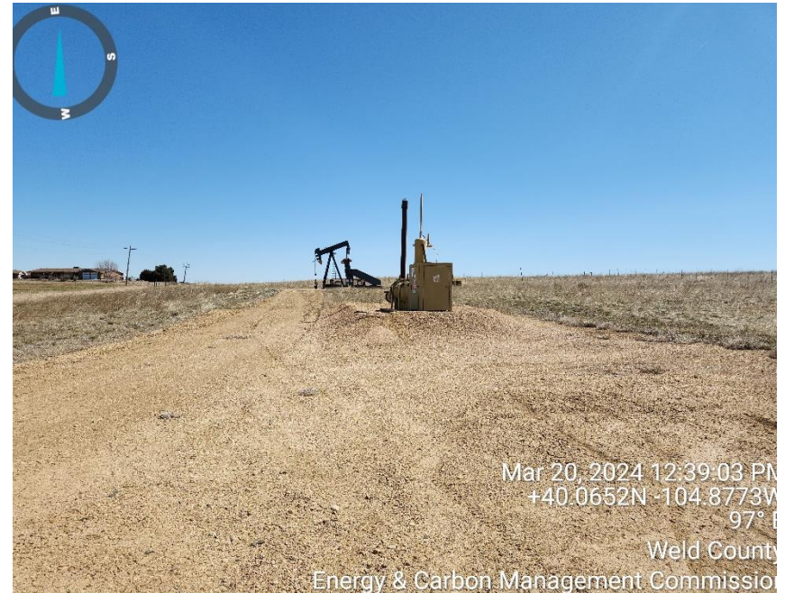
Photo 4 production equipment