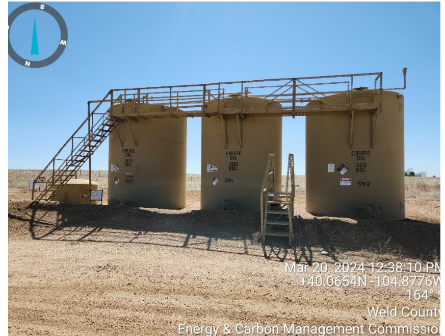
Photo 6 tank battery