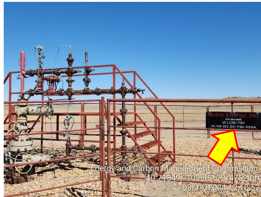
Photo 2 – LC26-780 Wellhead – Sec. # not adequate Well is in Sec. 26 not Sec. 34