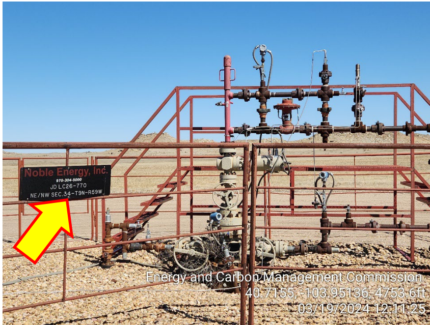
Photo 5 – LC26-770 Wellhead – Sec. # not adequate Well is in Sec. 26 not Sec. 34