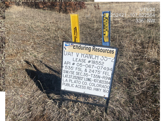
Photo 1. Overview of the disturbance taken from the entrance facing center.