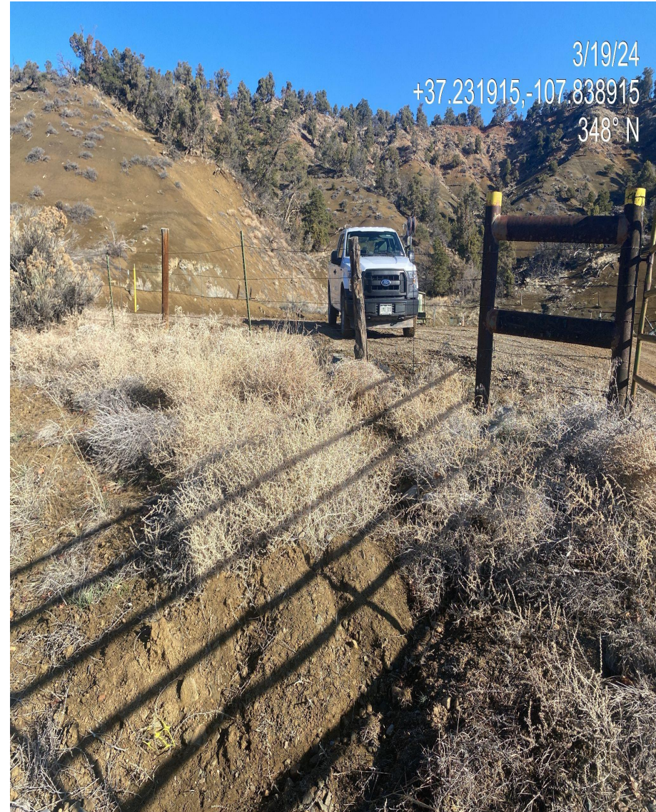
Photo 2. Weedy debris observed in the eastern interim reclamation fill slope and in the southern interim reclamation area at the access point. Fill slope lacks desirable vegetation and needs to be stabilized.