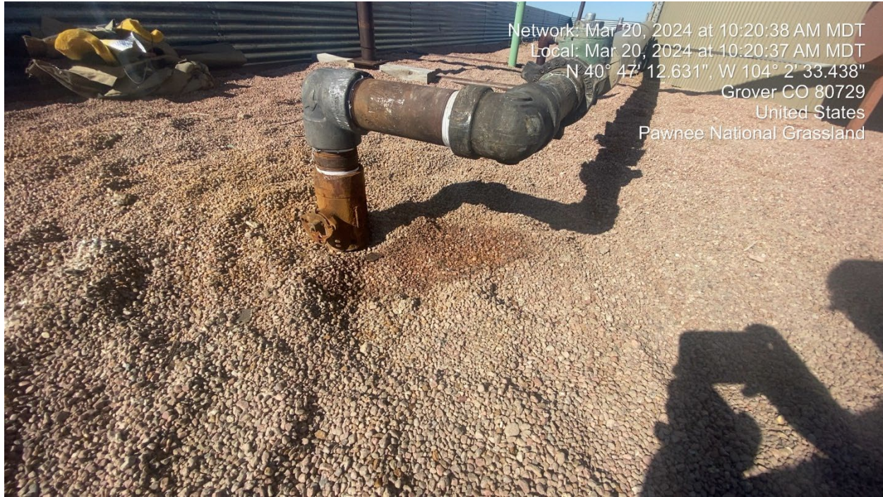
Photo Date 3/20/2024- Impacted soil from release.