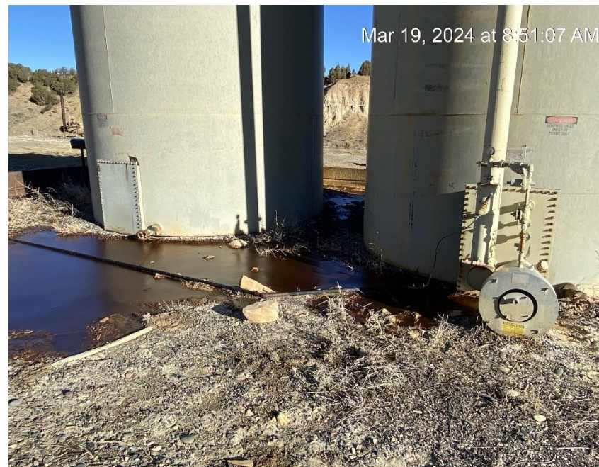
Oily waste and stained soil