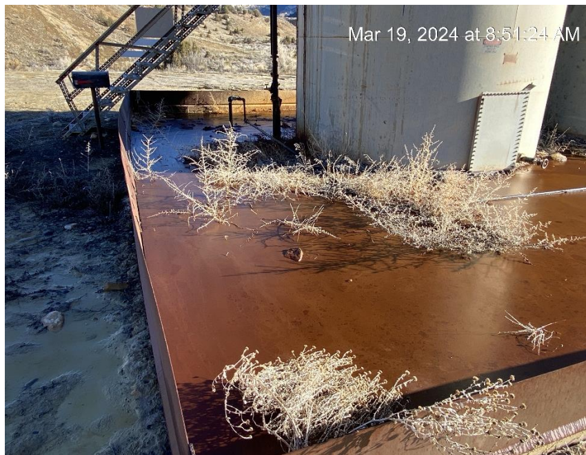
Oily waste and stained soil