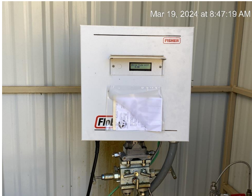
Gas meter calibration display