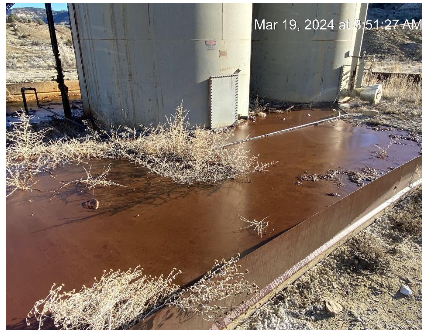
Oily waste and stained soil