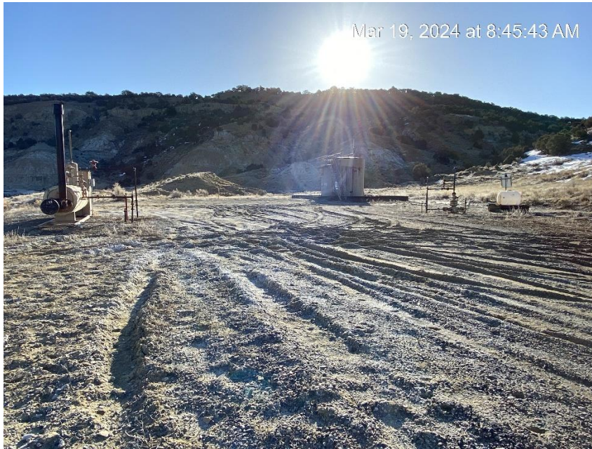
Location from Northwest corner