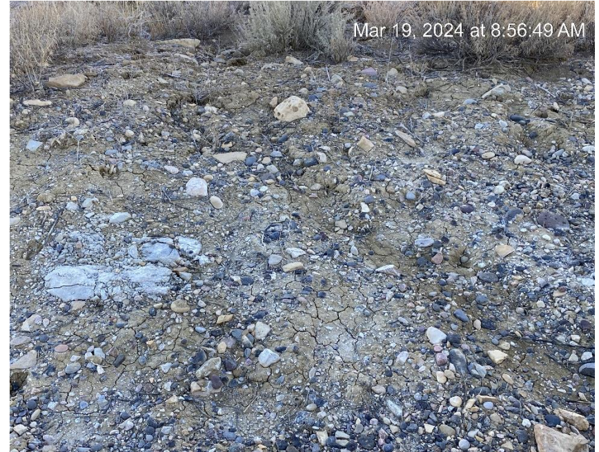
Erosion and sediment migration