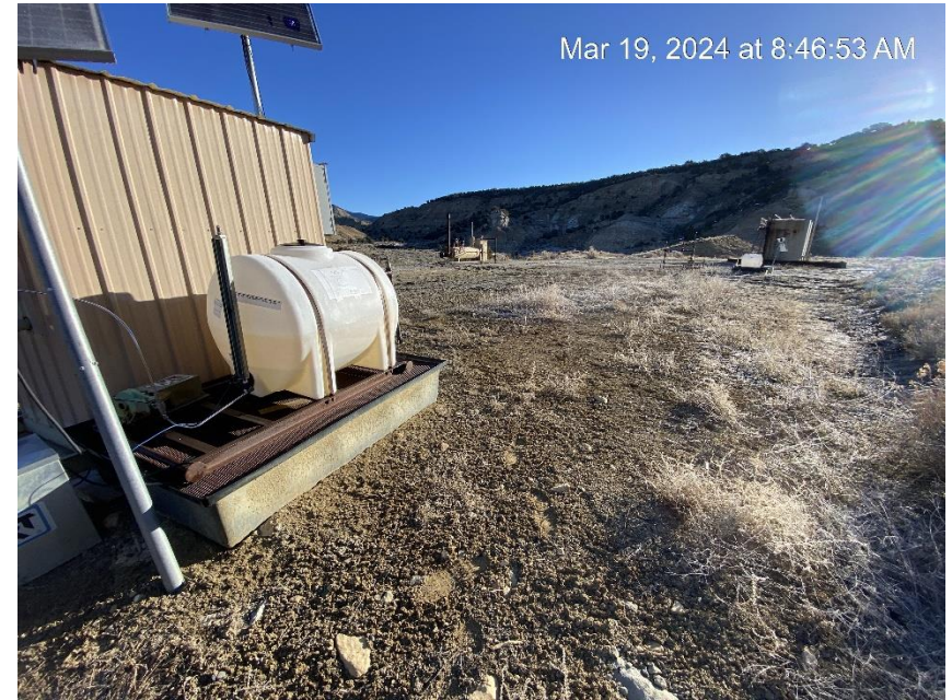
Location from Southwest corner