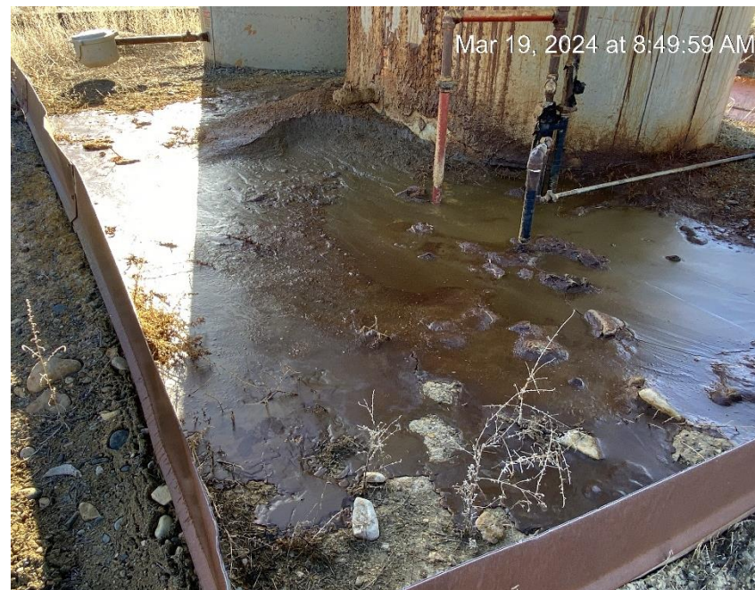
Oily waste and stained soil