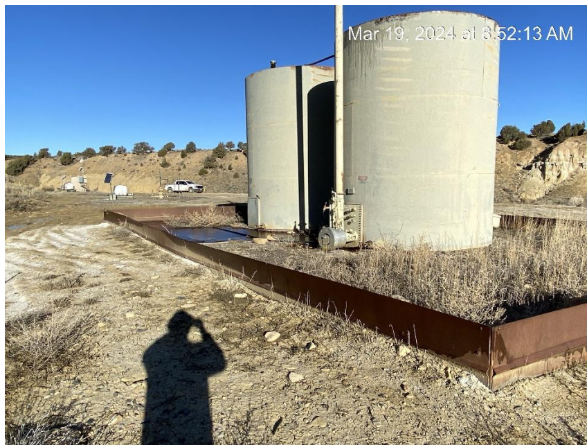
Location from Southeast corner