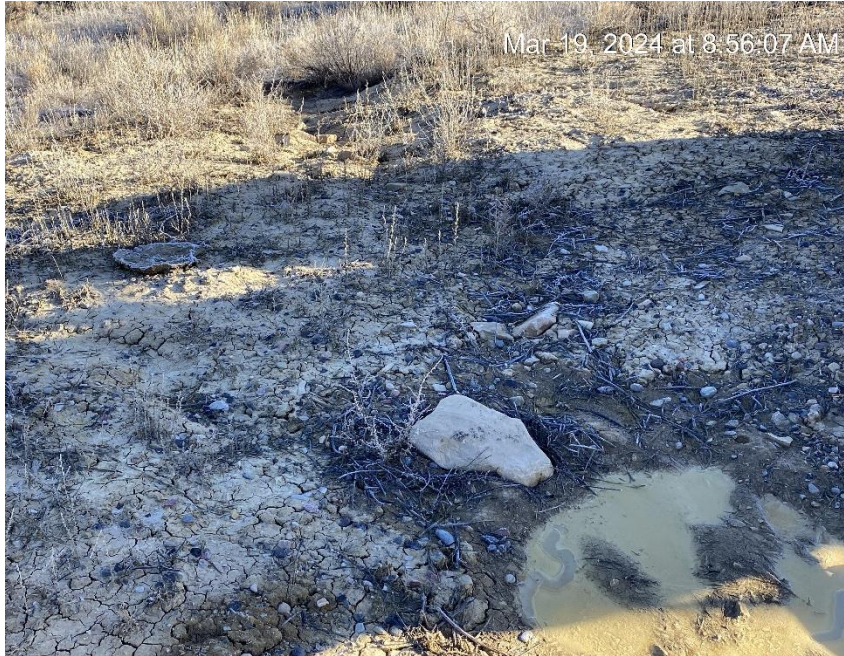
Erosion and sediment migration