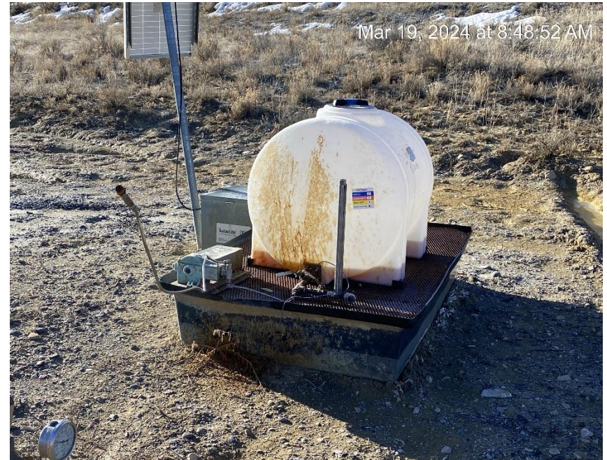
Oily waste and stained soil