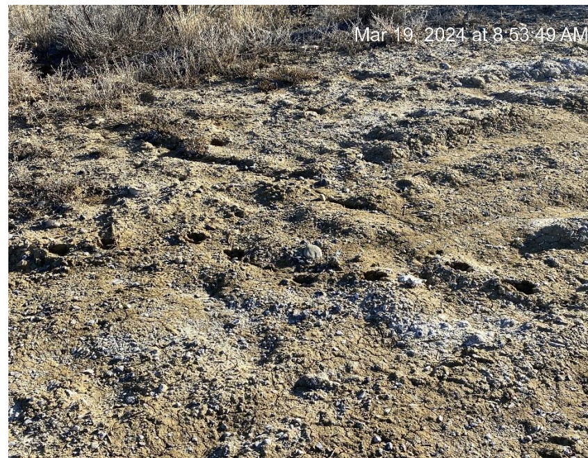
Erosion and sediment migration