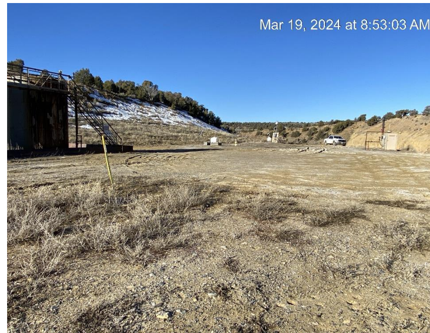
Location from Northeast corner