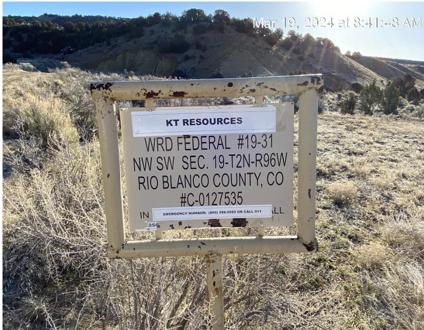
As signs are replaced additional information is required