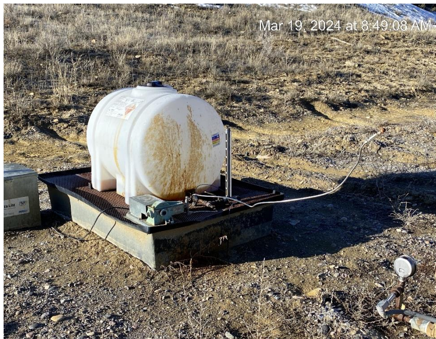
Equipment out of service