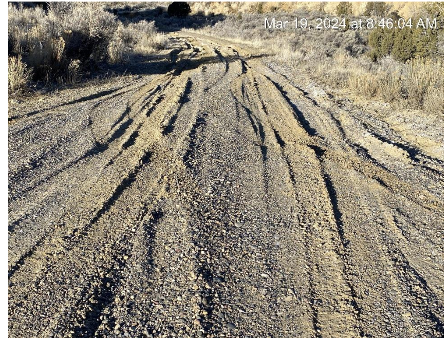
Lack of stabilization on lease road