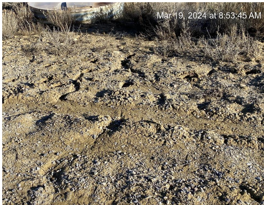
Erosion and sediment migration