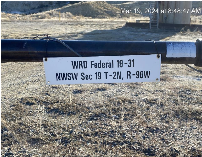
As signs are replaced additional information is required